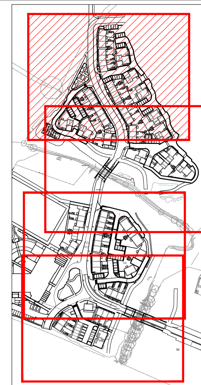
Sheet Arrangement (1:2500)

SURVEY INFORMATION MK Surveys - 01908 565561 DRG NUMBER: 17523 - Sheets 1-12 DATE RECEIVED: 17/12/2014