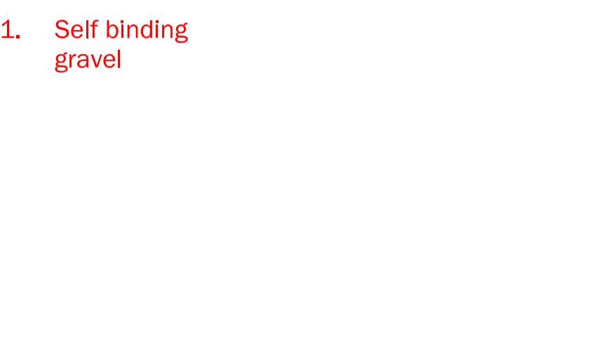
1. Self binding gravel 2. Marshed M3 covered bench (or similar approved)

SEE INSERT FOR DETAILS FOR CONTINUATION REFER LLA DWG 1619 02