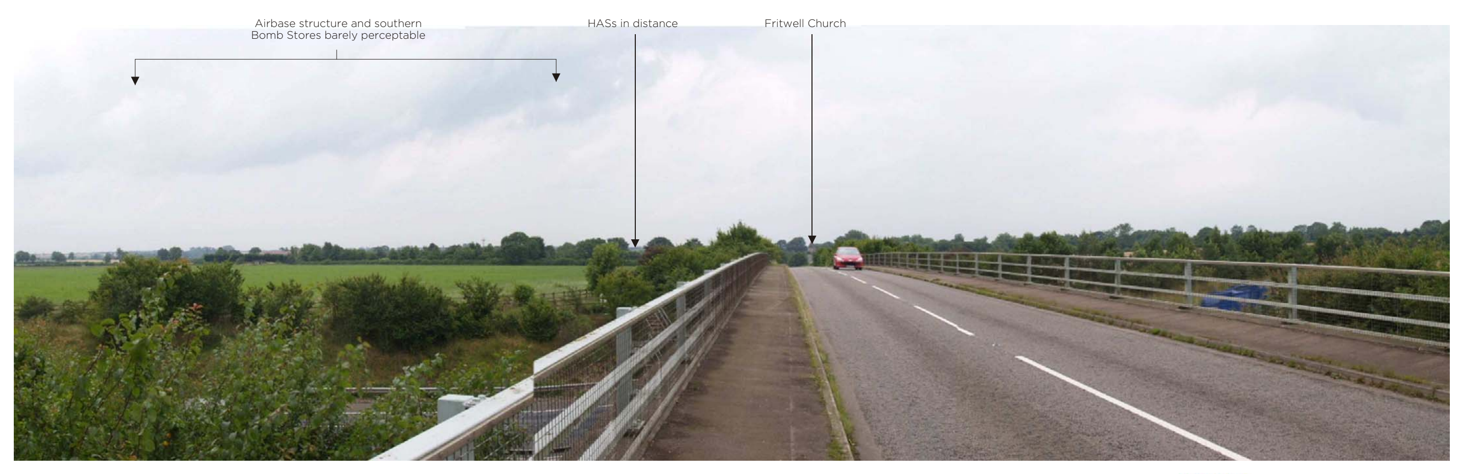
Viewpoint 22: Local road north-east of Fritwell, looking towards former airbase.