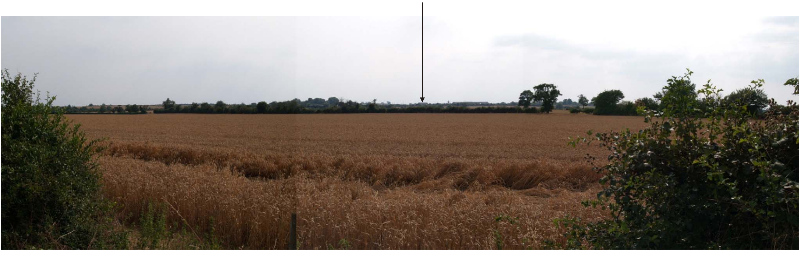
Viewpoint 23: From road midway between Fritwell and Ardley villages, looking south-southwest towards site