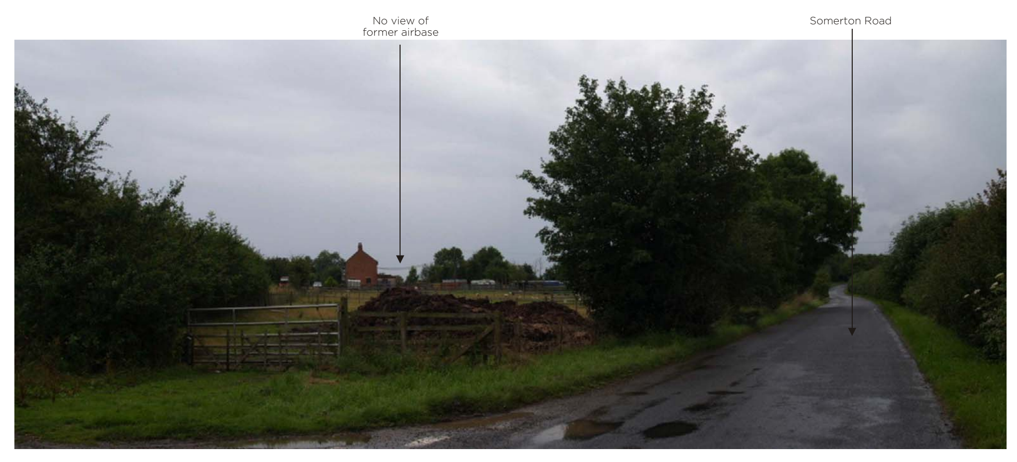
Viewpoint 25: Somerton Road 200m to south-west of Ardley, adjacent to link over rail line