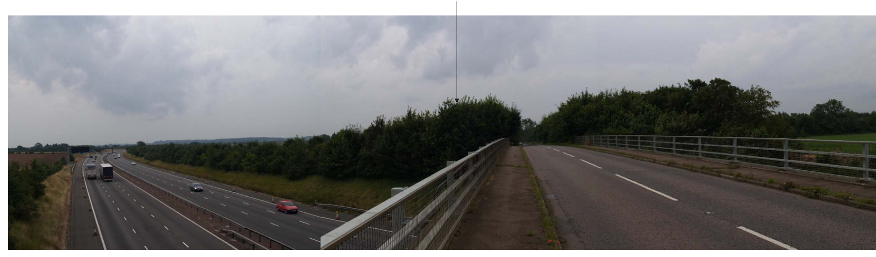
Viewpoint 21: Local road to the north of Fritwell, looking towards former airbase