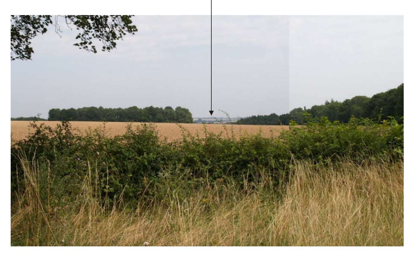
Viewpoint 8: From A4260 from Rousham looking northeast towards site (see inset on Plan L2)