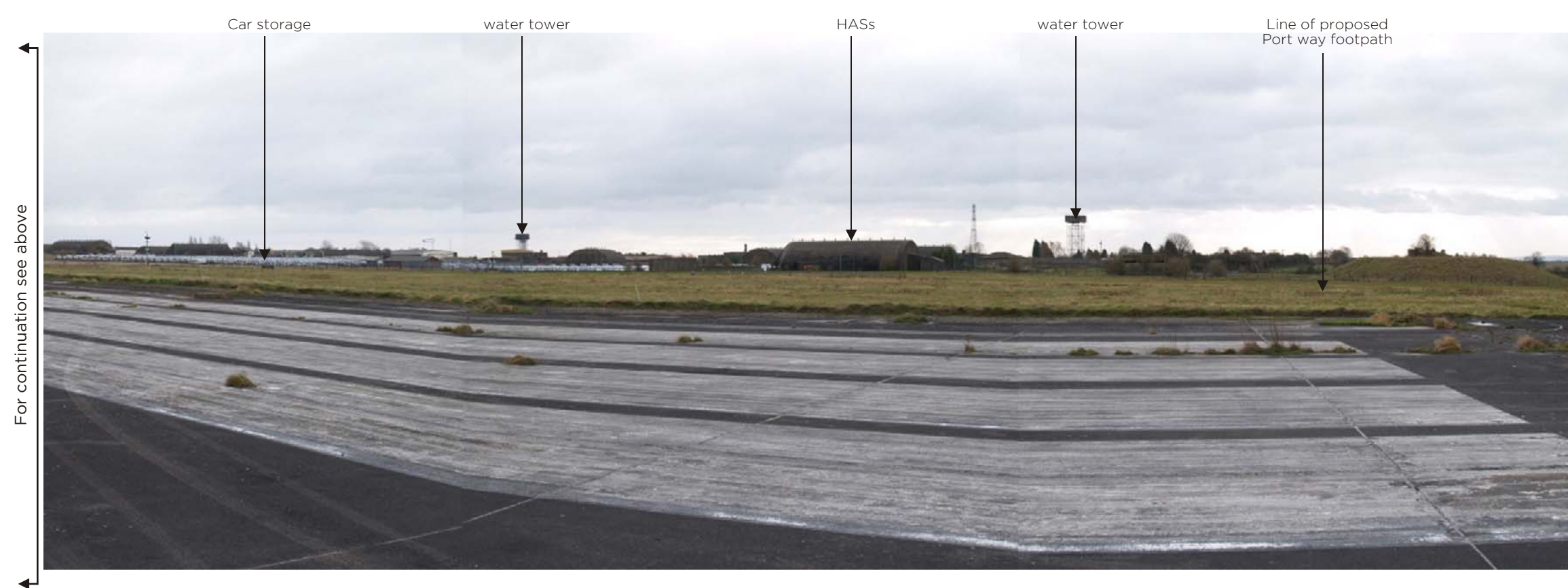
Viewpoint 38A: From same location looking south showing airfield buildings to the north of Camp Road