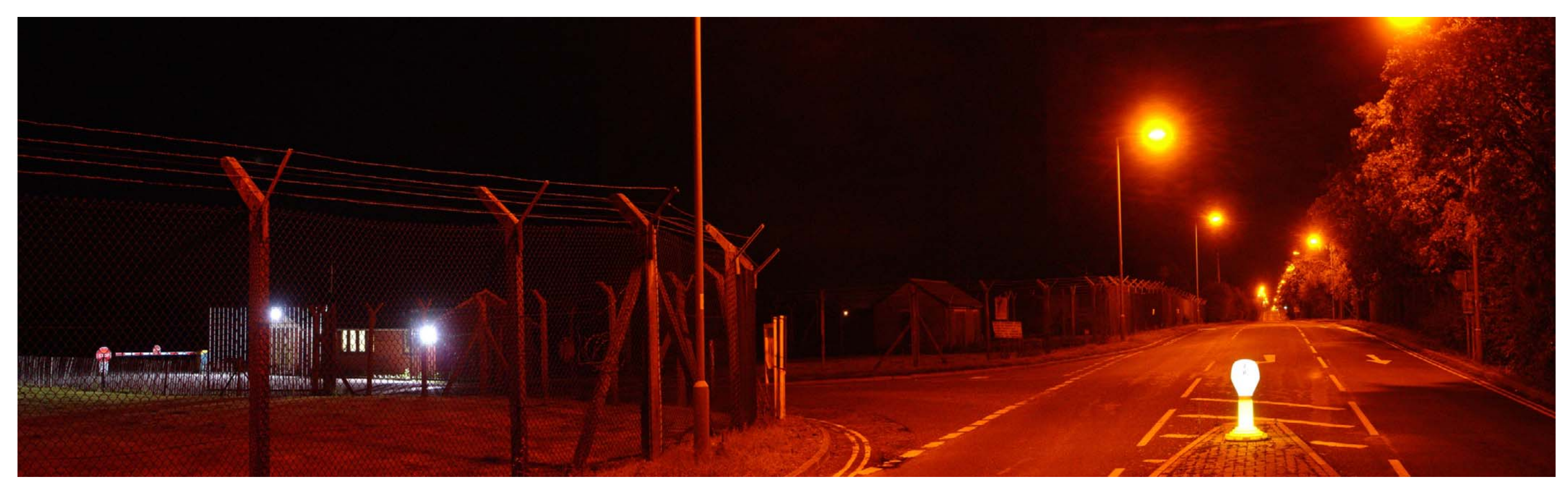
Viewpoint 30: From Camp Road on the west edge of the airbase, looking east towards the 8B Avionics and HAS character area.