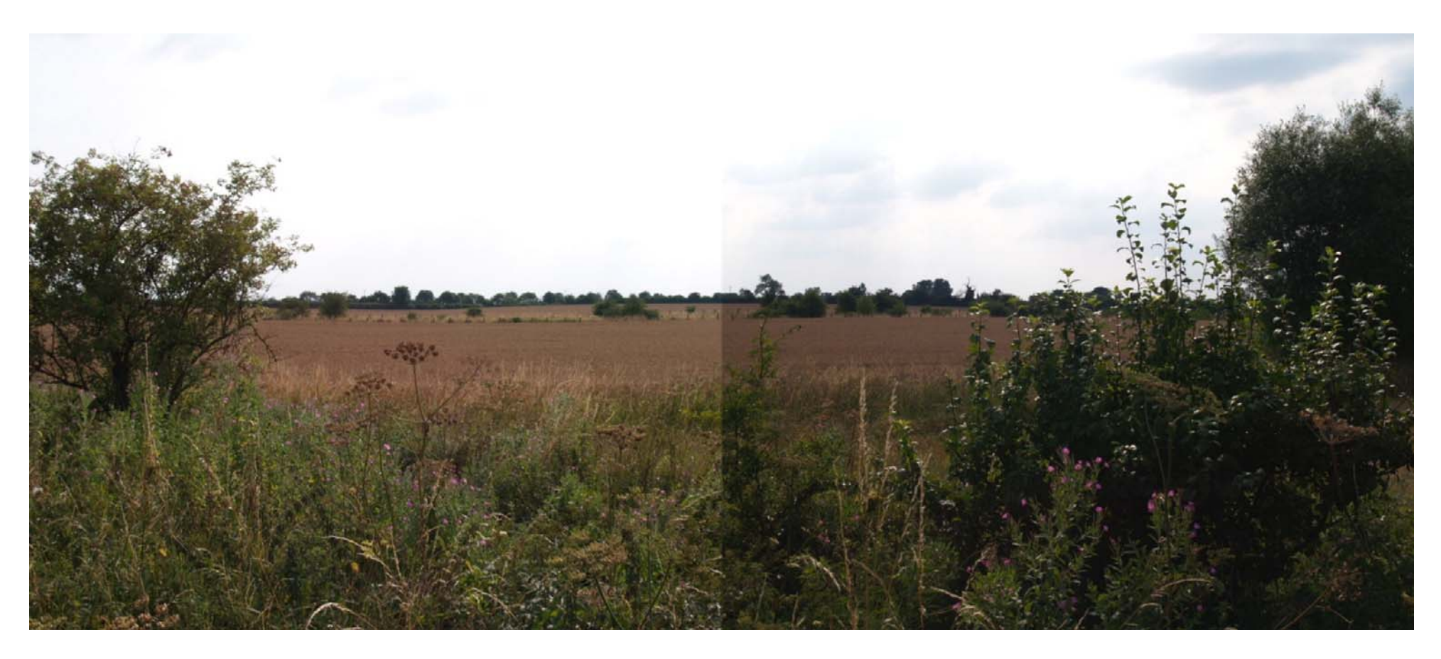
Viewpoint 24 : From road to Fritwell 0.6km south of the village, looking south-southwest towards site