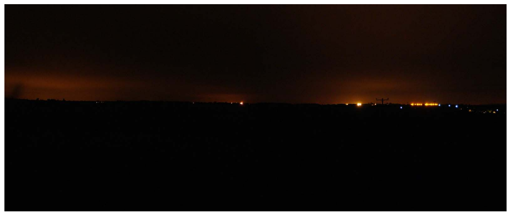
Viewpoint 15: From roadside viewpoint, a passing place between Middle Ashton and North Ashton, looking east towards site