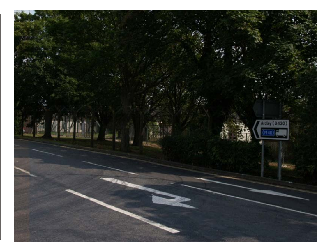
Viewpoint 31: From Camp Road on the west edge of the airbase, looking east towards site continued

Viewpoint 30: From Camp Road on the west edge of the airbase, looking east towards the 8B Avionics and HAS character area.