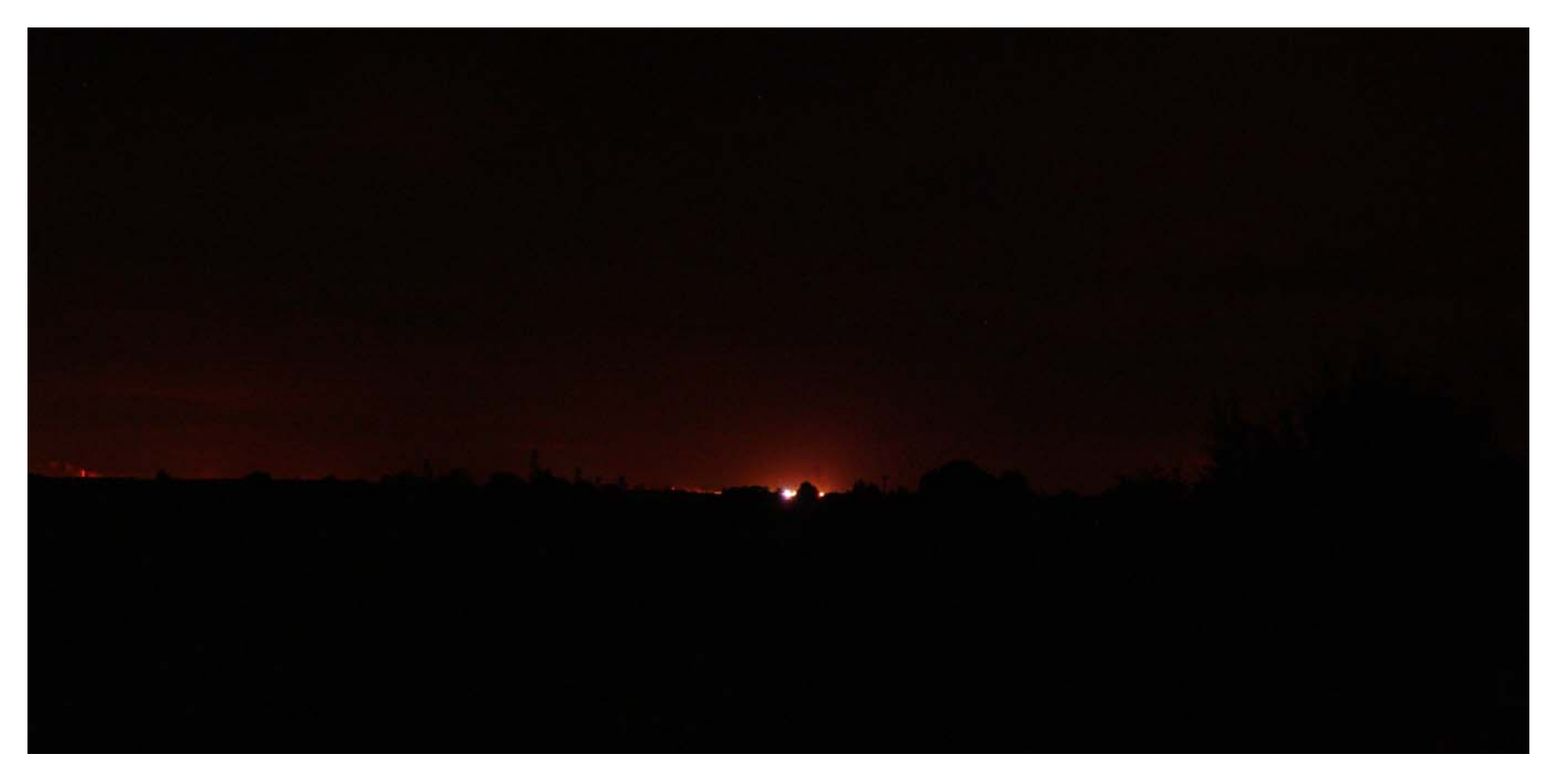
Viewpoint 22: Local road north-east of Fritwell, looking towards former airbase.