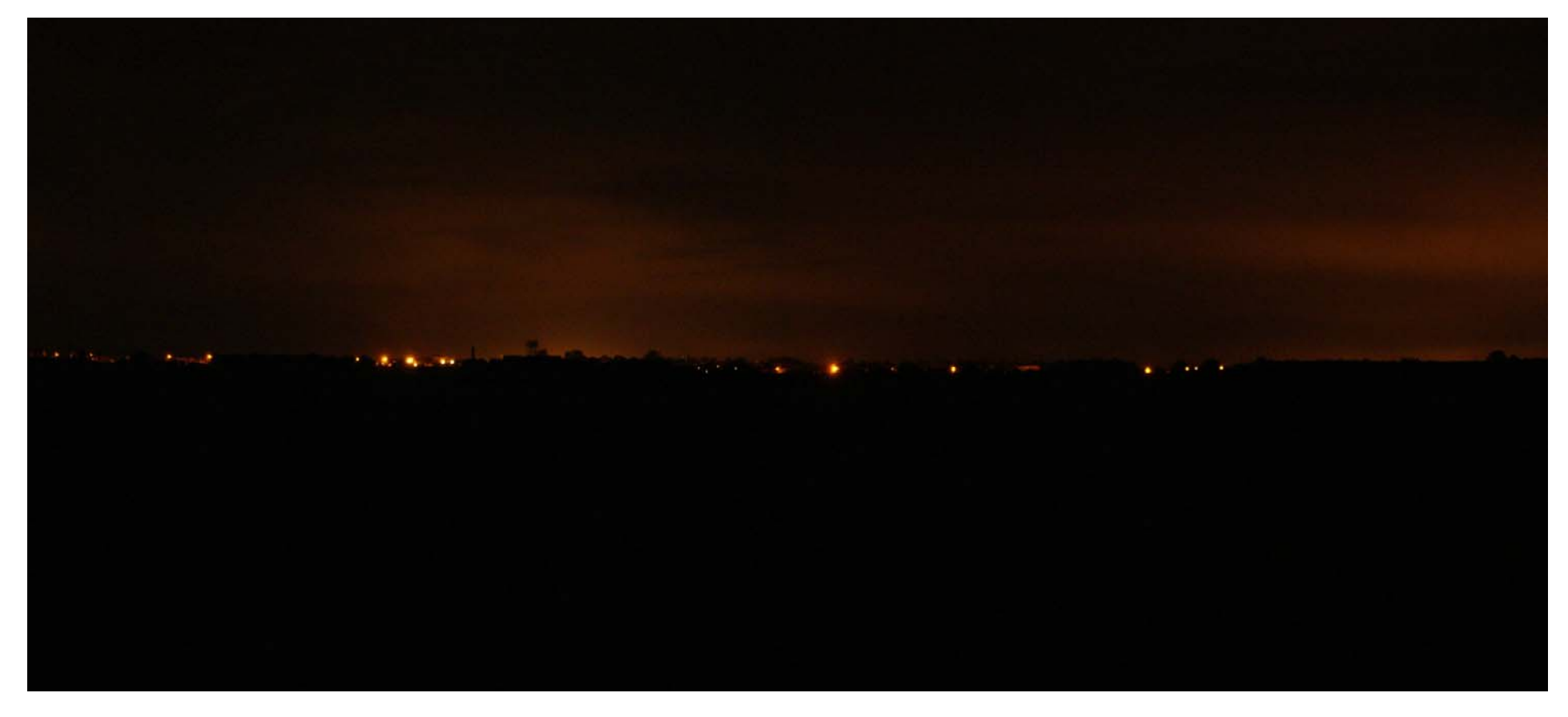
Viewpoint 31: From B4030 at junction with the unclassified Port Way, looking north-northeast towards site