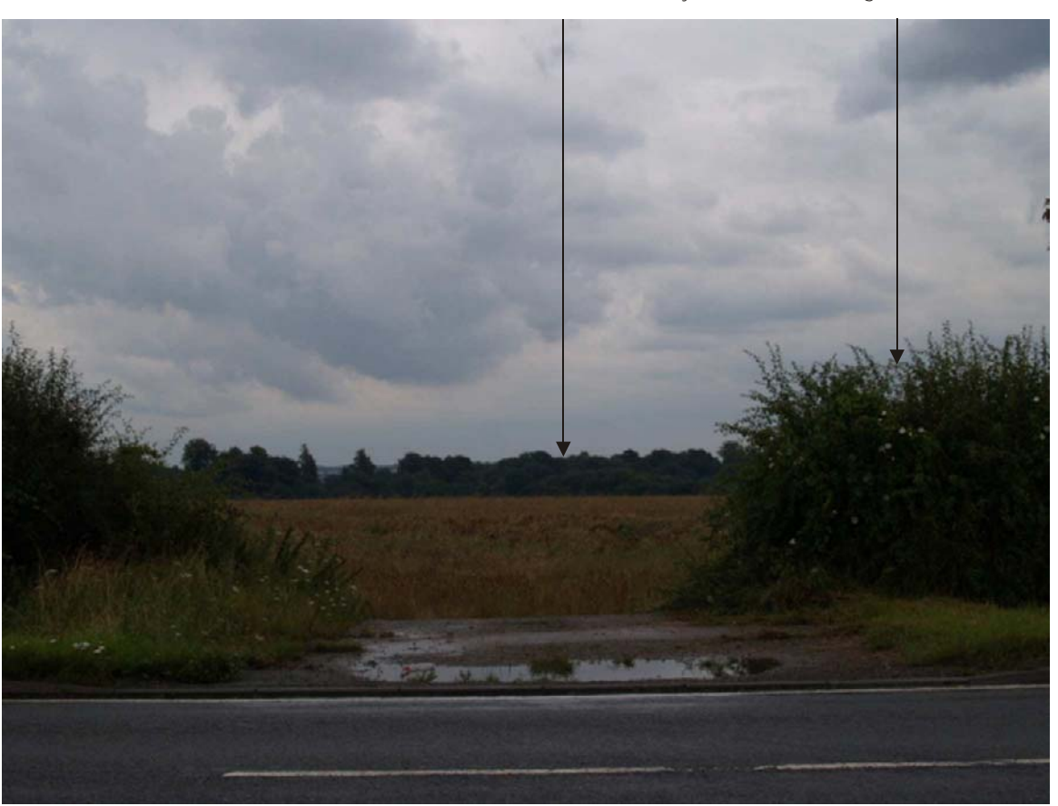
Viewpoint 7: A4260 Opposite Brazenose Farm looking north