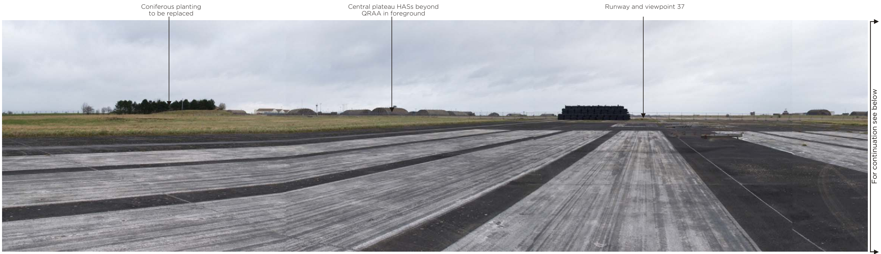
Viewpoint 38: New viewpoint proposed on Portway looking east down main Runway