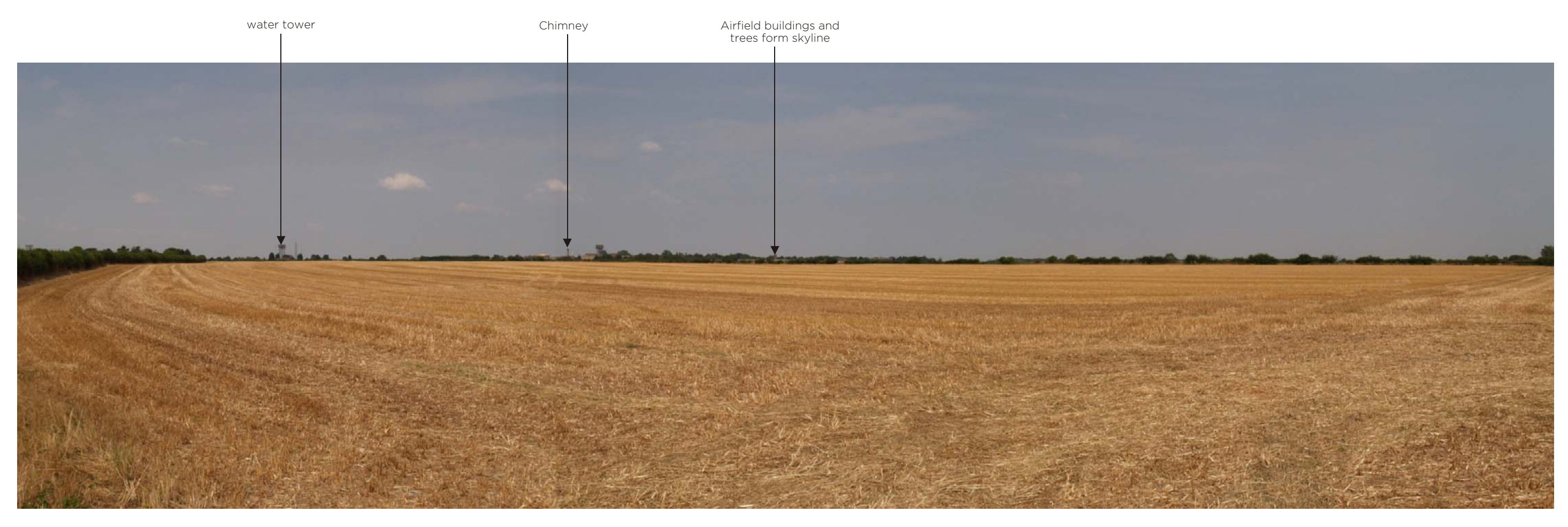
Viewpoint 31: From B4030 at junction with the unclassified Port Way, looking north-northeast towards site