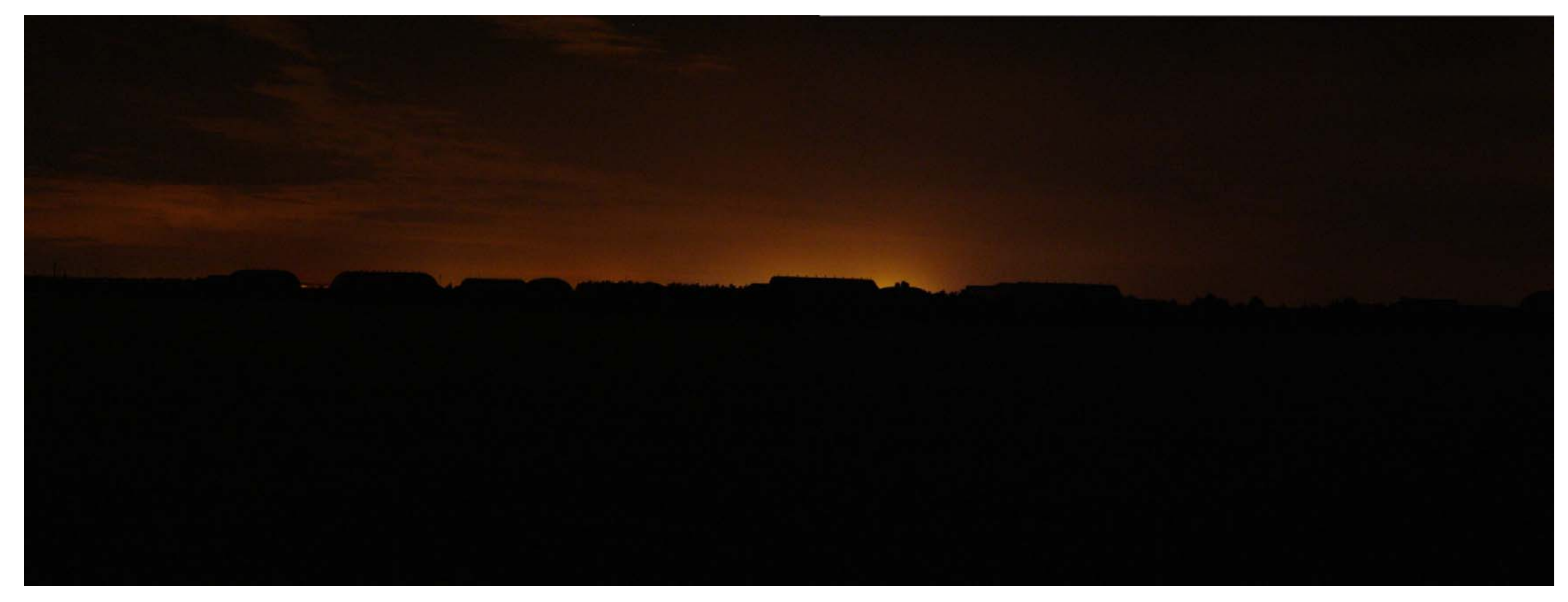
Viewpoint 26: From public footpath south of Troy Farm