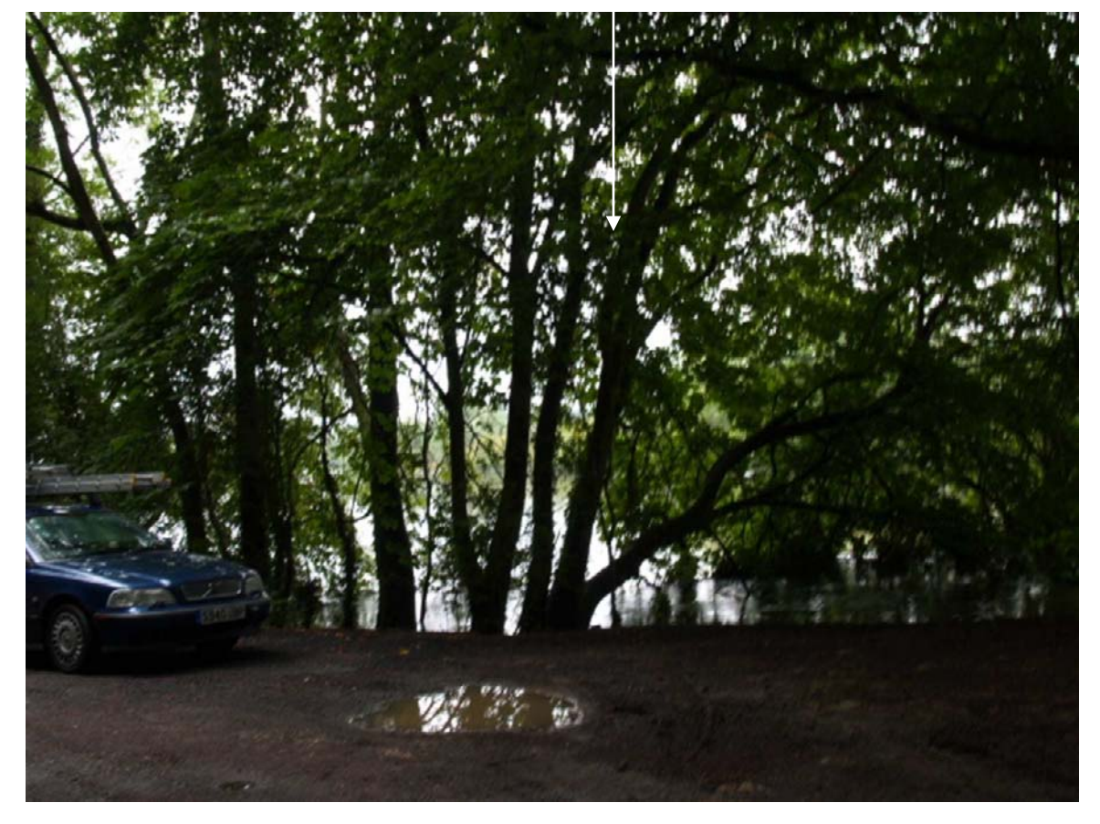
Viewpoint 12: Steeple Aston Road, close to Rousham Junction, in flood conditions, July 2007.

Tree planting enclose views towards former airbase