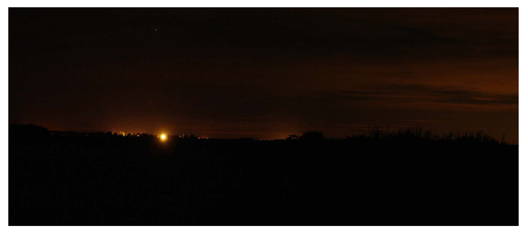
Viewpoint 36 : From the entrance to a covered reservoir on road from B430 to Upper Heyford, 0.3km from junction with B430, looking west-northwest towards site