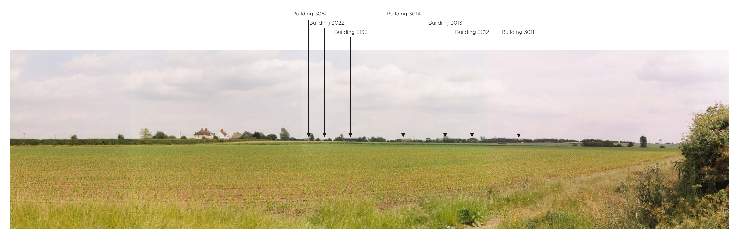
Viewpoint 28: From Somerton to Upper Heyford road approx 0.5km south of Somerton, looking east-southwest towards site