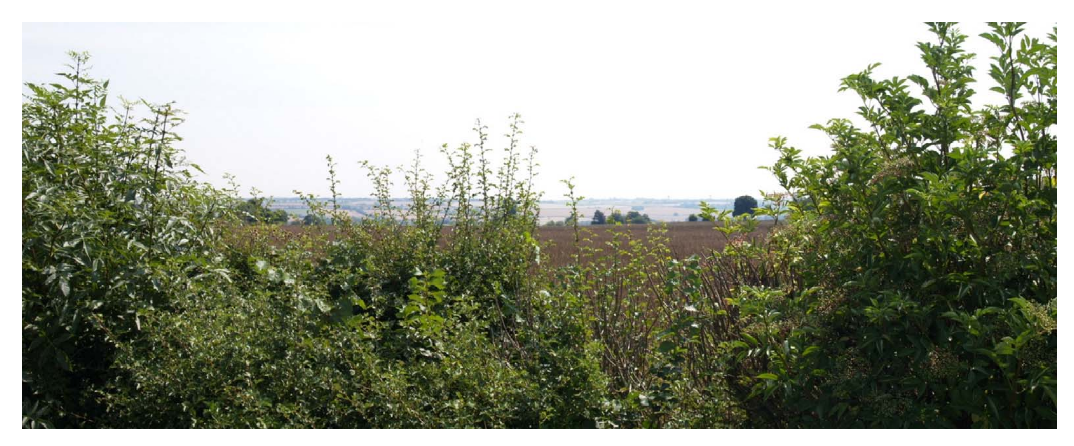
Viewpoint 5: From the A426 north of the Middle Ashton junction