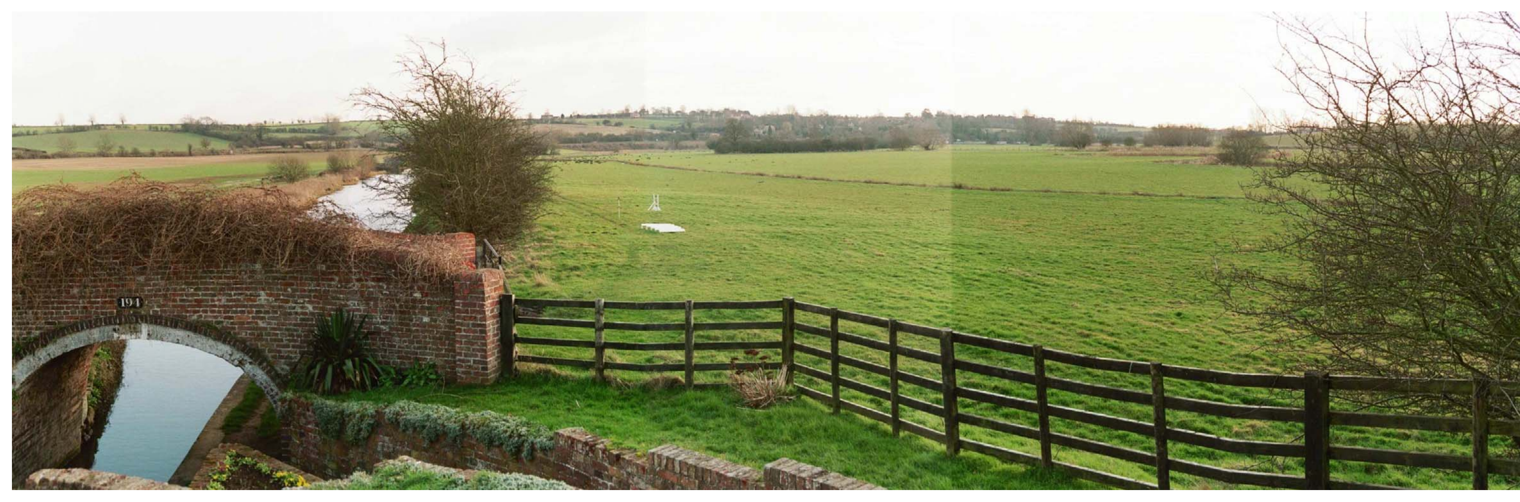
Viewpoint 39: From within the Cherwell Valley looking toward the former airbase