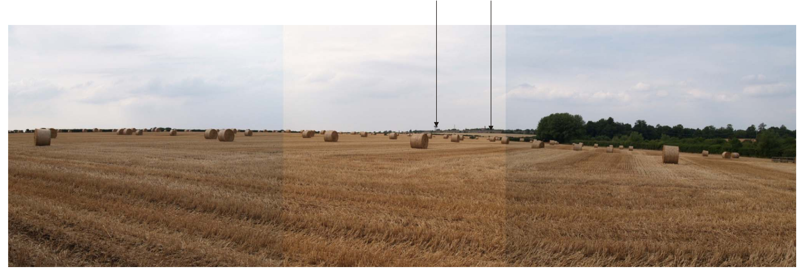
Viewpoint 33: From B4030 0.6km to the east of Caulcott, looking north-northwest towards site