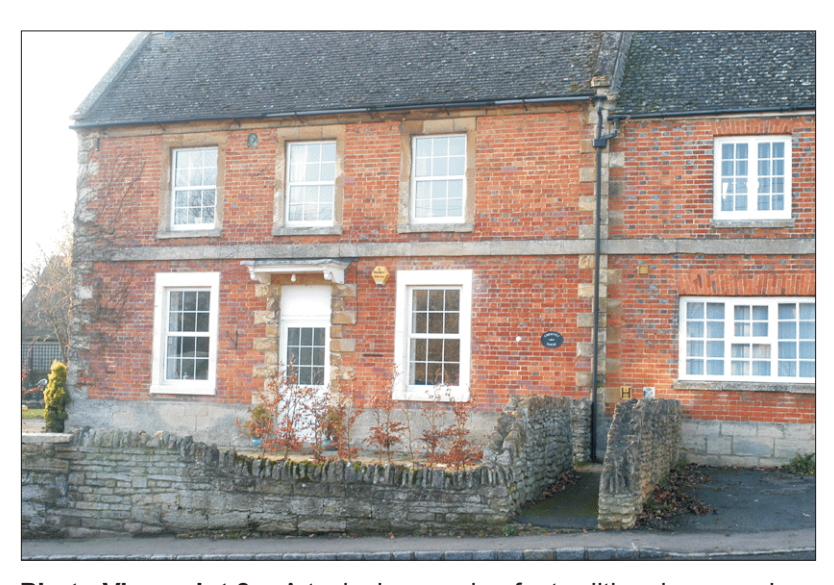
Photo Viewpoint 3a: A typical example of a traditional vernacular house in Steeple Aston.