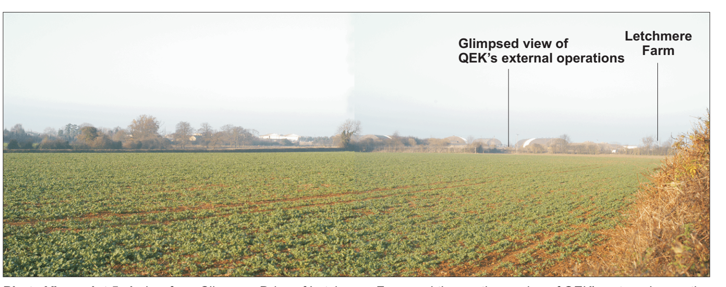
Photo Viewpoint 5: A view from Clingrove Drive of Letchmere Farm and the southern edge of QEK's external operations

Heyford Park QEK Global Solutions (UK) Ltd Landscape and Visual Assessment