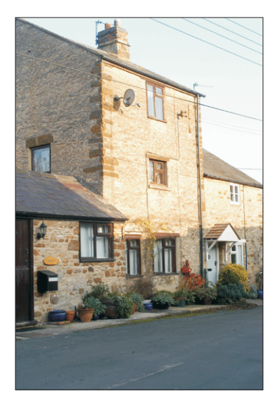
Photo Viewpoint 3b: A typical example of a vernacular house in Steeple Aston.