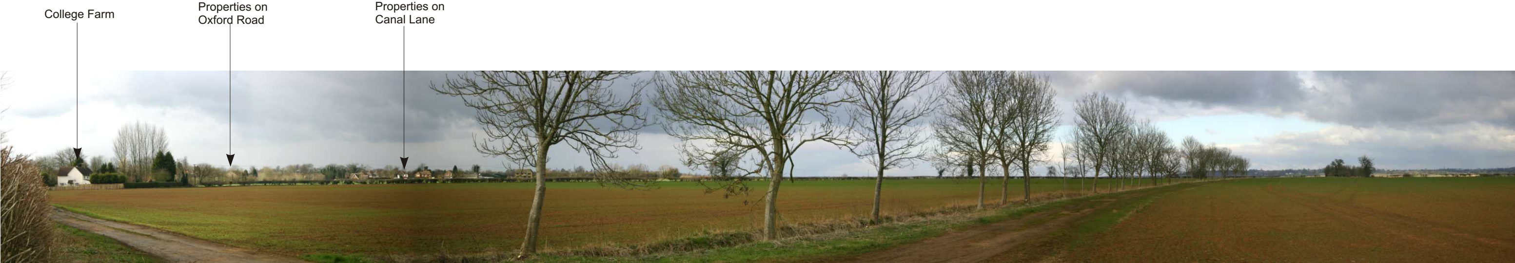
Viewpoint L : Public Footpath near, Bannatyne’s Health Club

Hallam Land Management Ltd./J.J Gallagher Ltd.