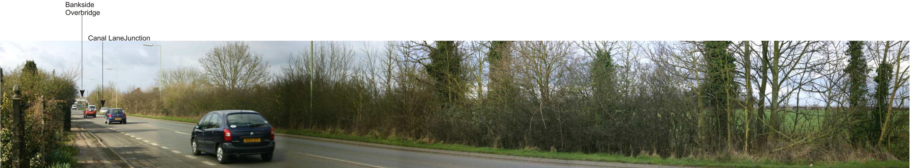
Viewpoint K : Oxford Road