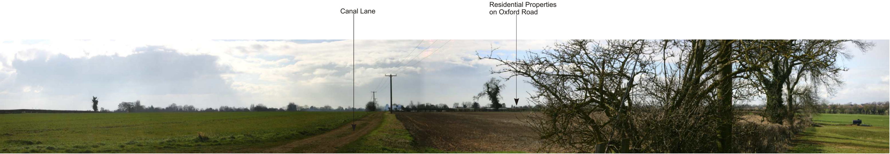
Viewpoint I : Canal Lane (Public Bridleway)