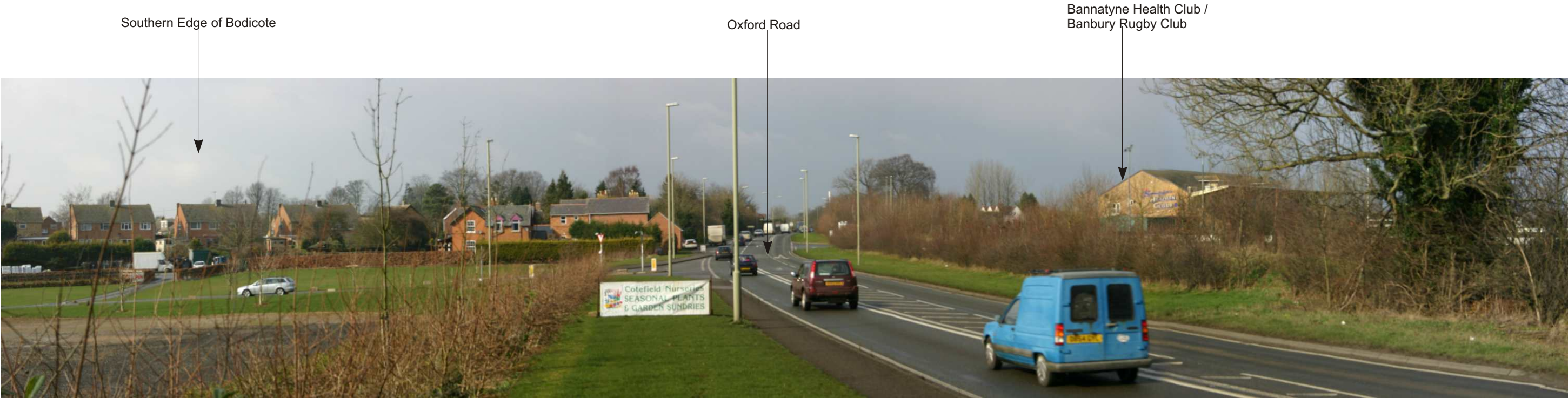
Viewpoint O : Oxford Road, near Cotefield Farm

Hallam Land Management Ltd./J.J Gallagher Ltd.