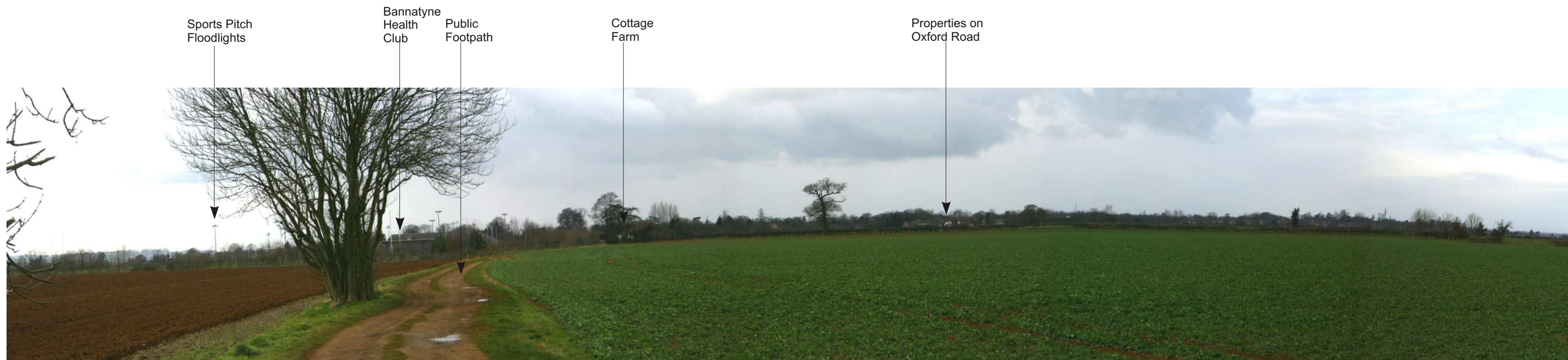
Viewpoint N : Public Footpath near Bushy Furze Barn