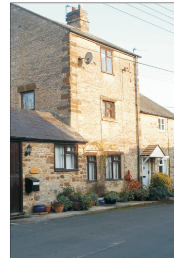
Photo Viewpoint 3b: A typical example of a vernacular house in Steeple Aston.