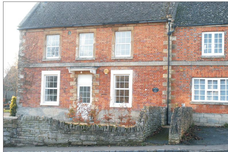
Photo Viewpoint 3a: A typical example of a traditional vernacular house in Steeple Aston.