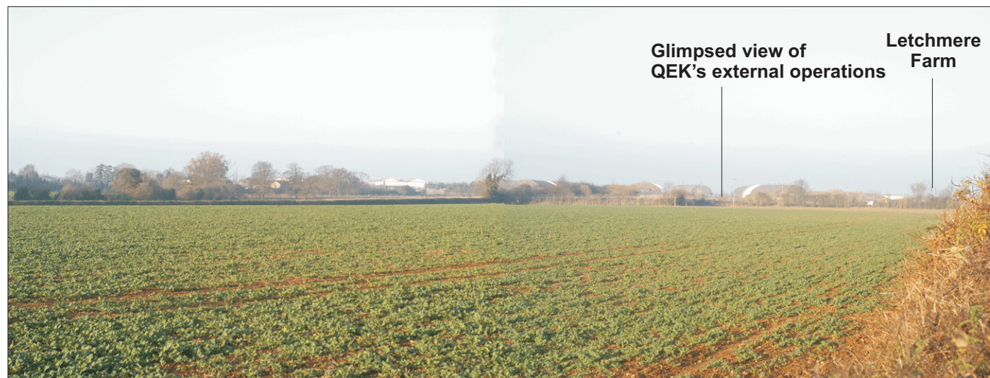
Photo Viewpoint 5: A view from Clingrove Drive of Letchmere Farm and the southern edge of QEK's external operations

Heyford Park QEK Global Solutions (UK) Ltd Landscape and Visual Assessment