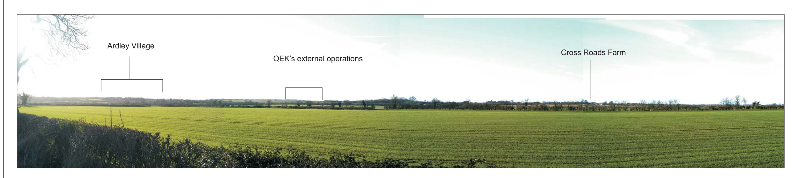
Photo Viewpoint 9: View from Water Lane between Fritwell & Ardley.