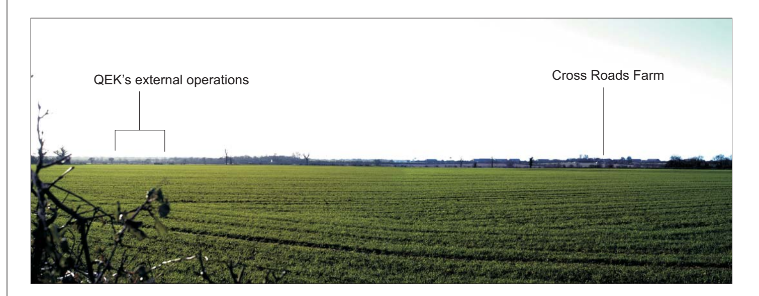
Photo Viewpoint 10: View from Water Lane and footpath number 6, south of Fritwell.