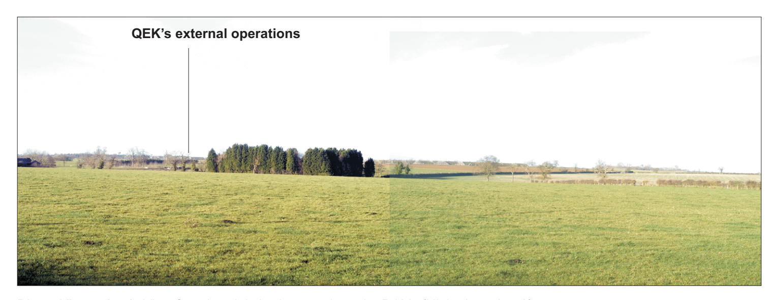
Photo Viewpoint 8: View from break in hedgerow along the B430. (Night time shot 2).

Heyford Park QEK Global Solutions (UK) Ltd Landscape and Visual Assessment