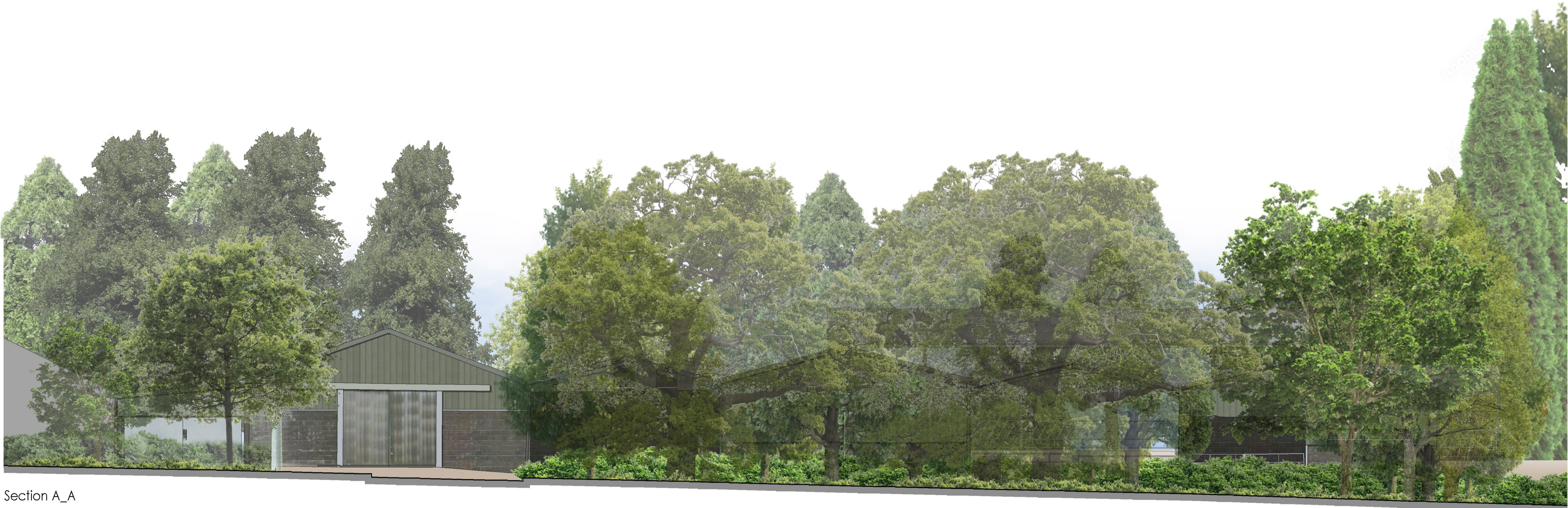
Section A_A 0m 5m 10m