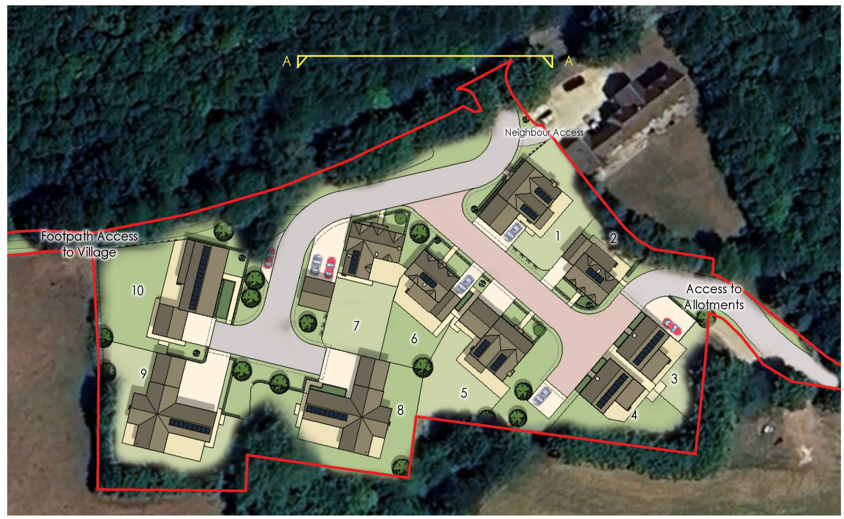
Key Plan (NTS)