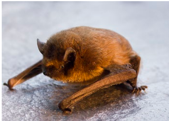
This image shows a pipistrelle bat approximately 5 cm in length