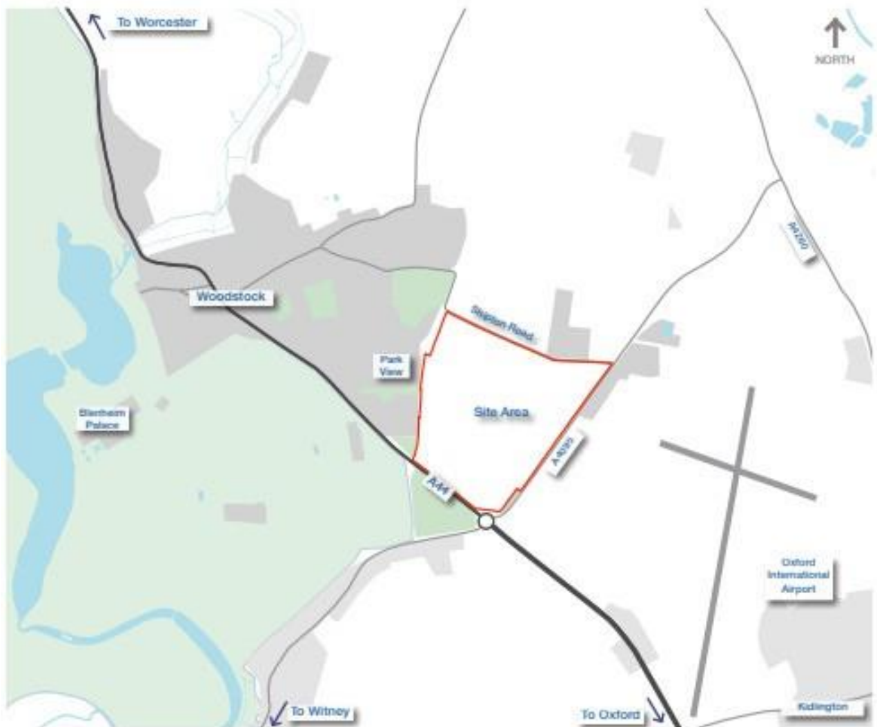
Figure 1 - Site Area Map

The site location is situated southeast of Woodstock, Northwest of Oxford and neighbours Oxford Airport to the east and Blenheim Palace to its west. The village is within the Hanborough civil parish which also includes the neighbouring village of Church Hanborough.