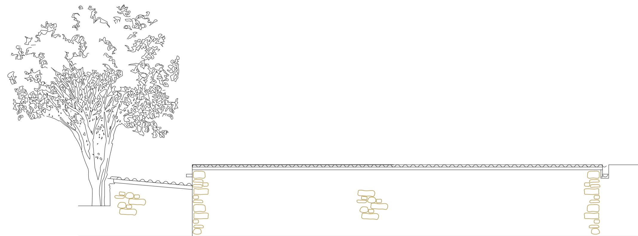
NORTH ELEVATION 1:50