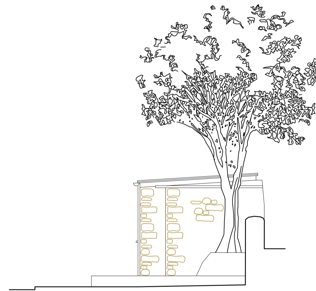
EAST ELEVATION 1:50