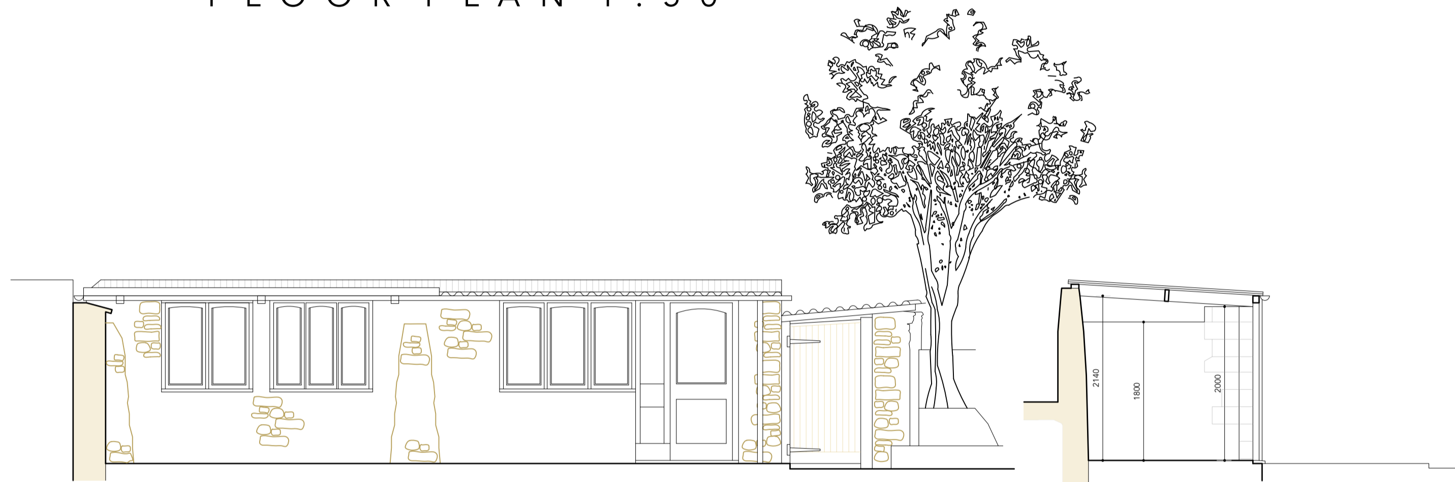
SOUTH ELEVATION 1:50