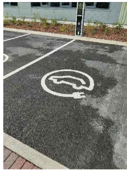
Image of Graphic for EV Parking Bay