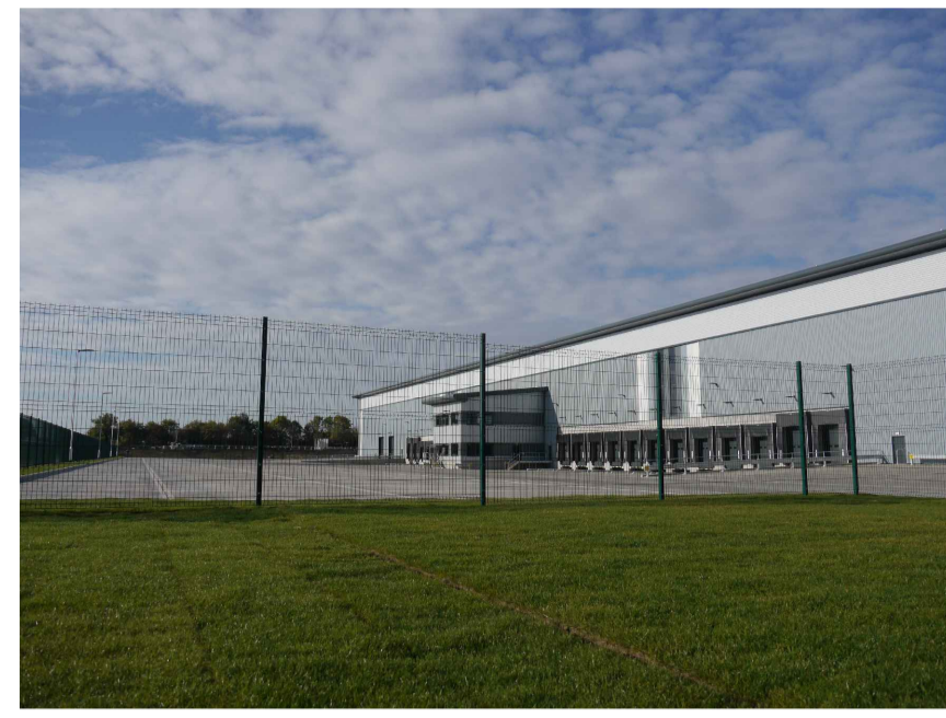
Image of typical paldain mesh security fence