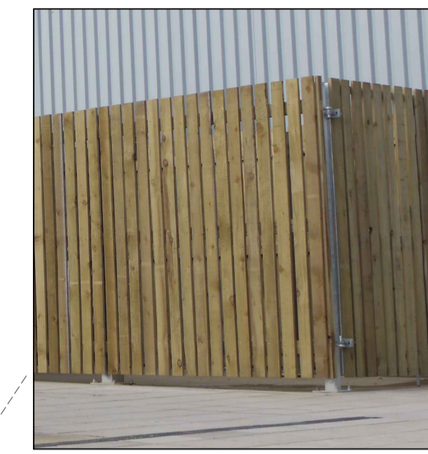
Image of Timber Fencing on Galvanised steel posts to Waste Recycling and Compactor compound