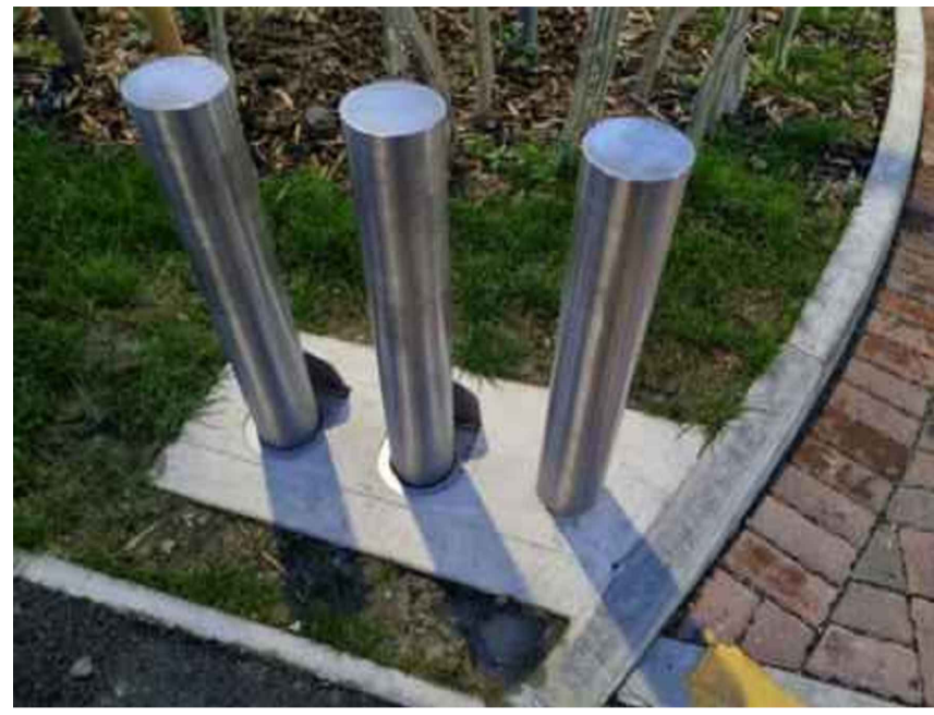
Image of removable Stainless Steel BX47 Semi domed top bollard