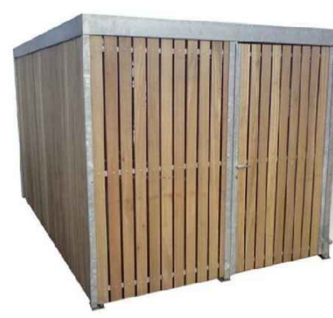
Image of FalcoLok-250 Bin Store