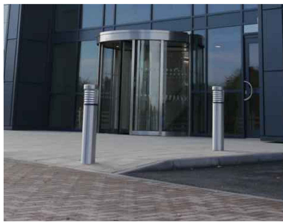
Image of illuminated brushed stainless steel bollards