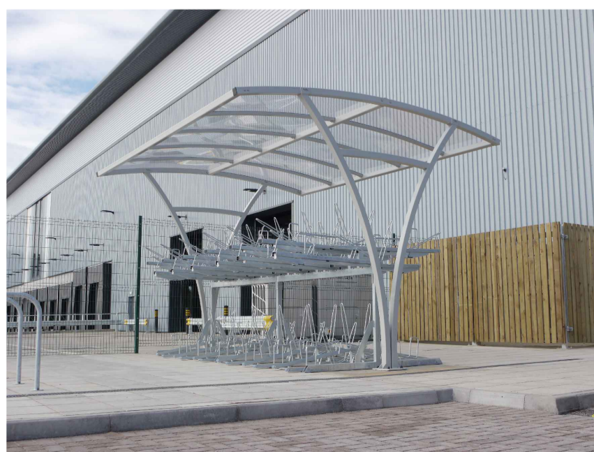
Image of Falcorail cycle canopy