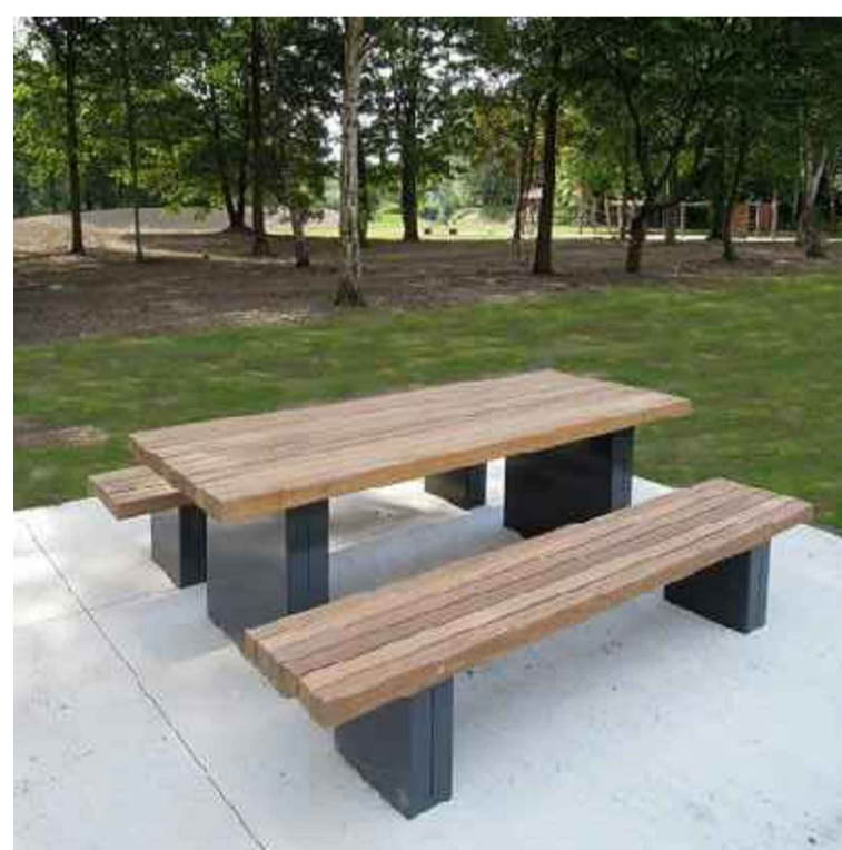
Typical amenity area seating