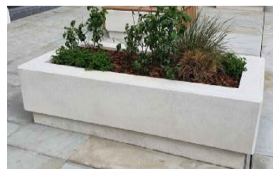
Image of precast concrete planter