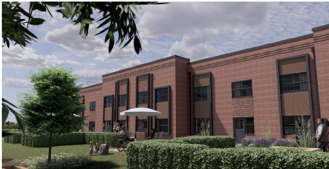
FIGURE 7: Façade Details