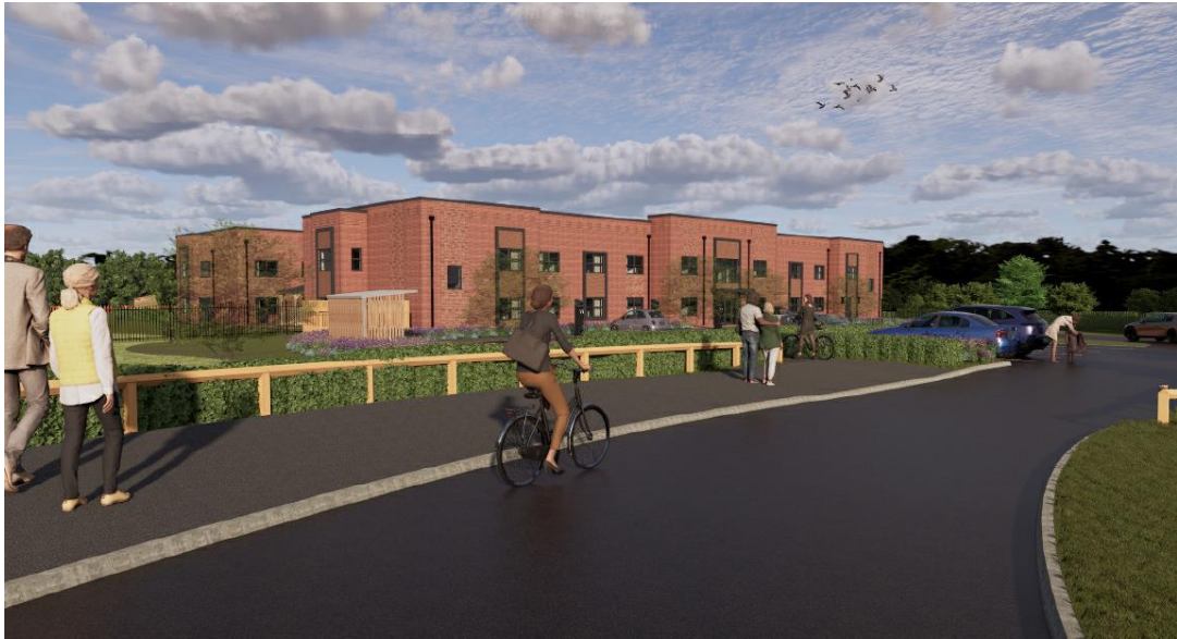
FIGURE 5: Visual of Proposal

5.16 With regard to the internal amenity space the care home is designed to meet the provisions of the Care Standards Act 2000, the former and most relevant legislation to outline room sizes. Below is a comparison of the Care Standards Act requirements and the proposed care home provisions: