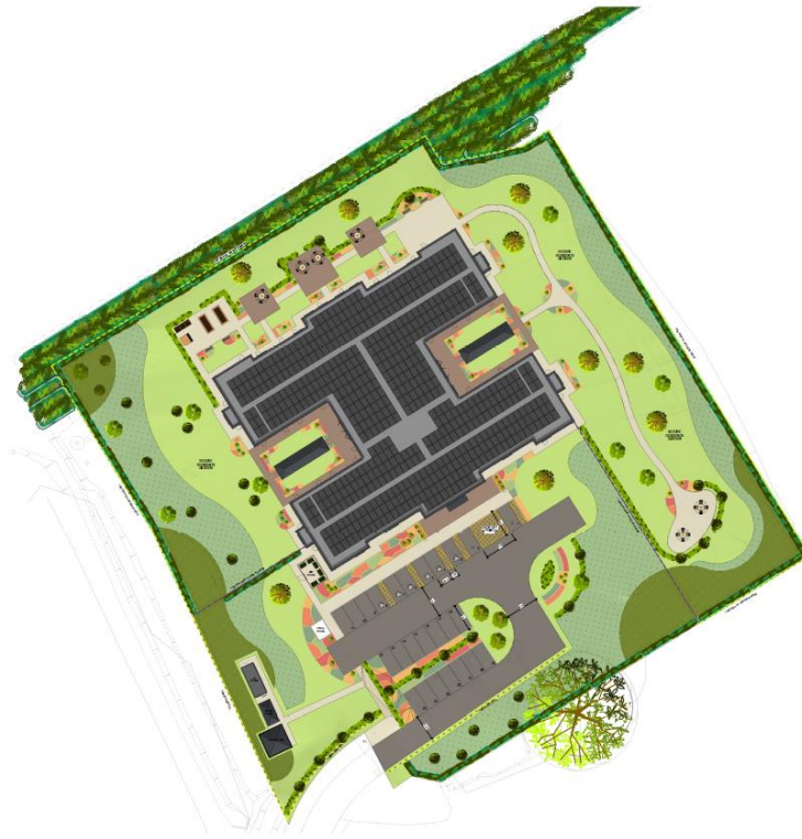
FIGURE 6: Proposed Site Layout and Indicative Landscaping