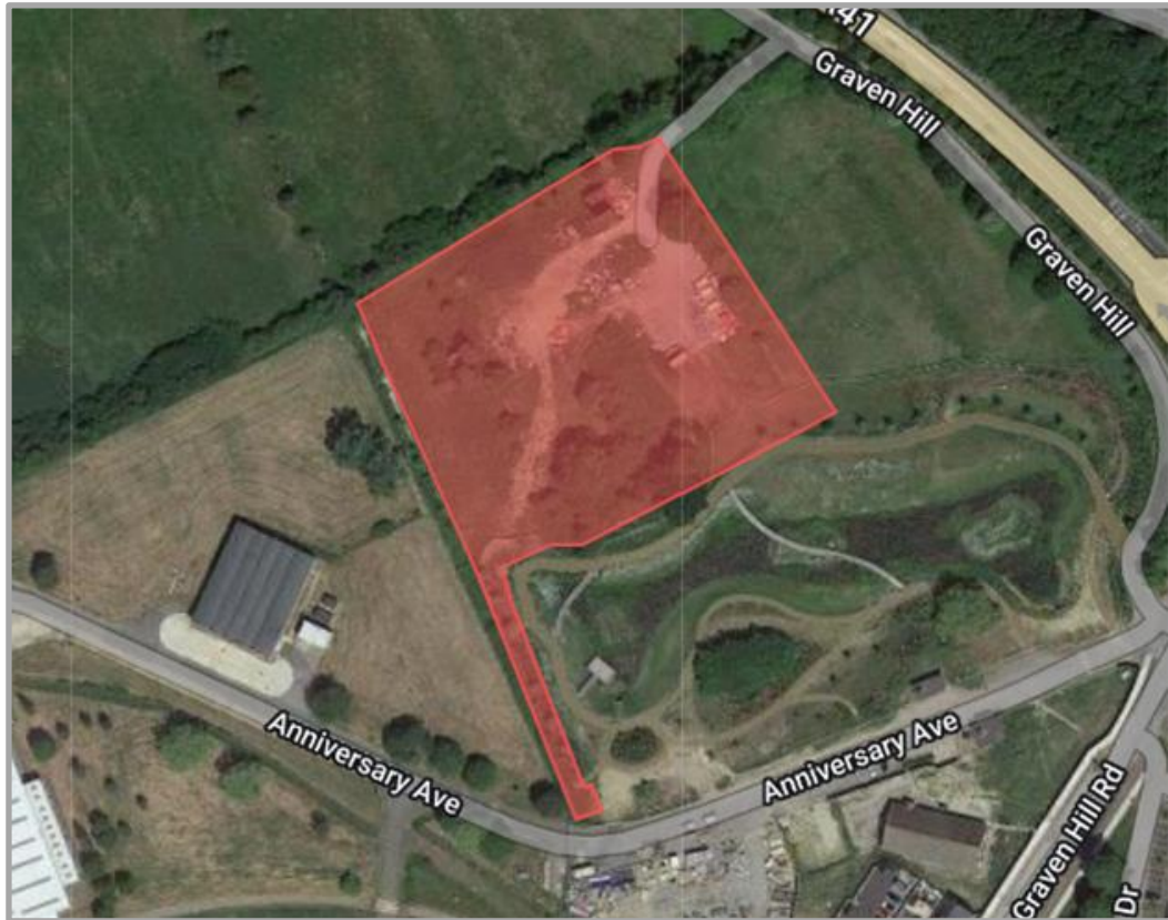
FIGURE 2: Site Location