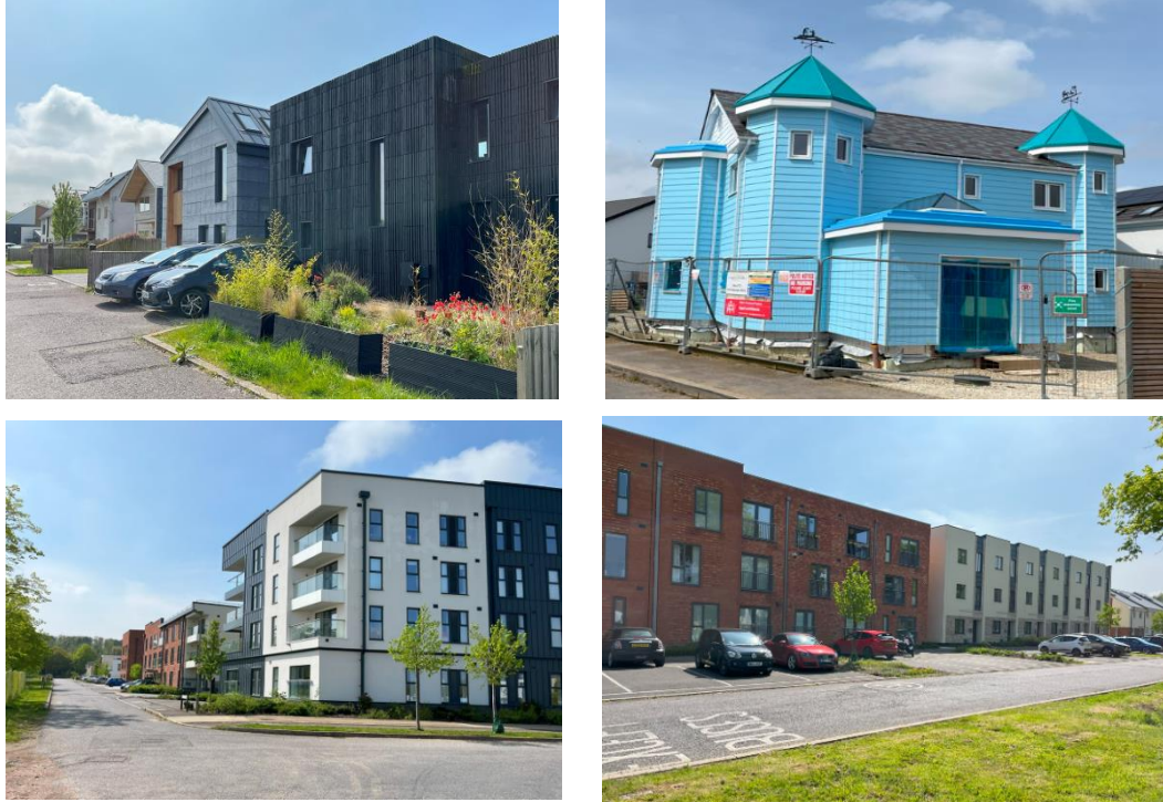
FIGURE 3: Residential Properties off Anniversary Avenue & Graven Hill