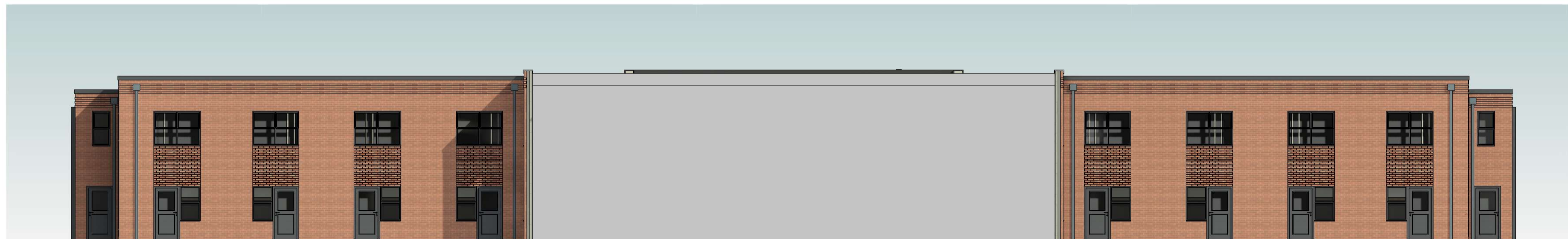
Section 2 1 : 100