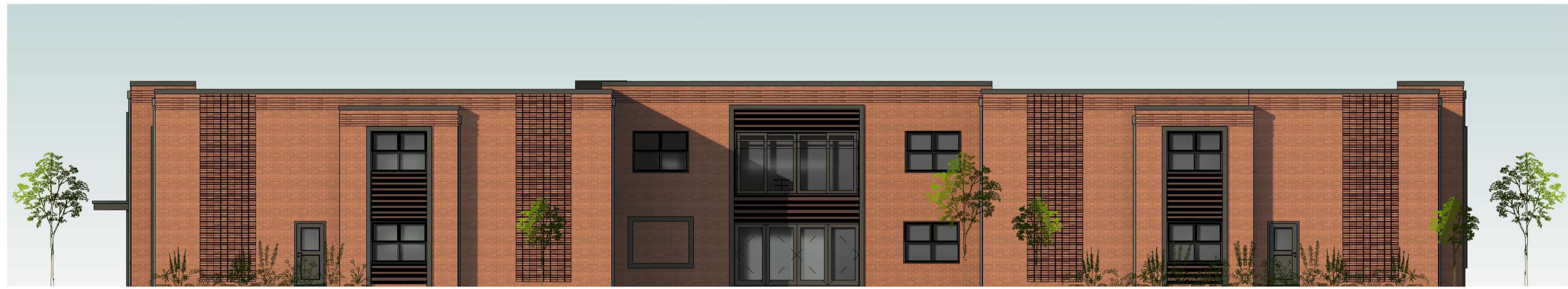
NORTH EAST 1 : 100