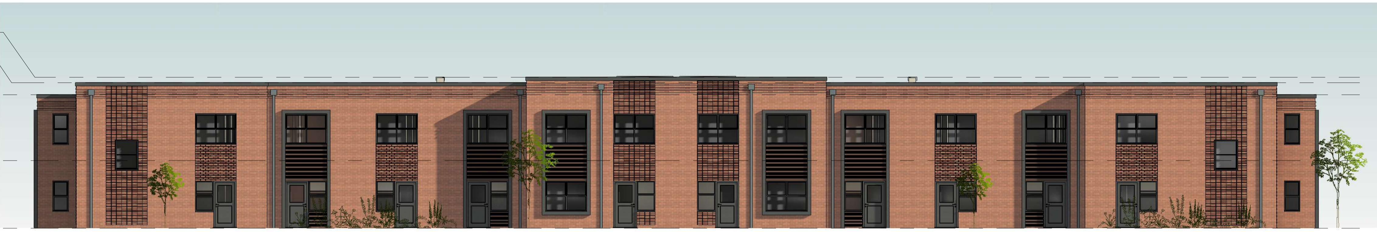
NORTH WEST 1 : 100