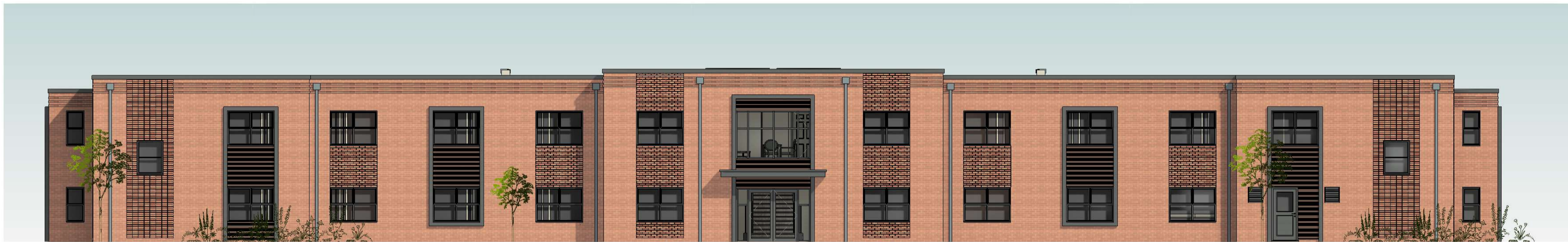
SOUTH EAST 1 : 100