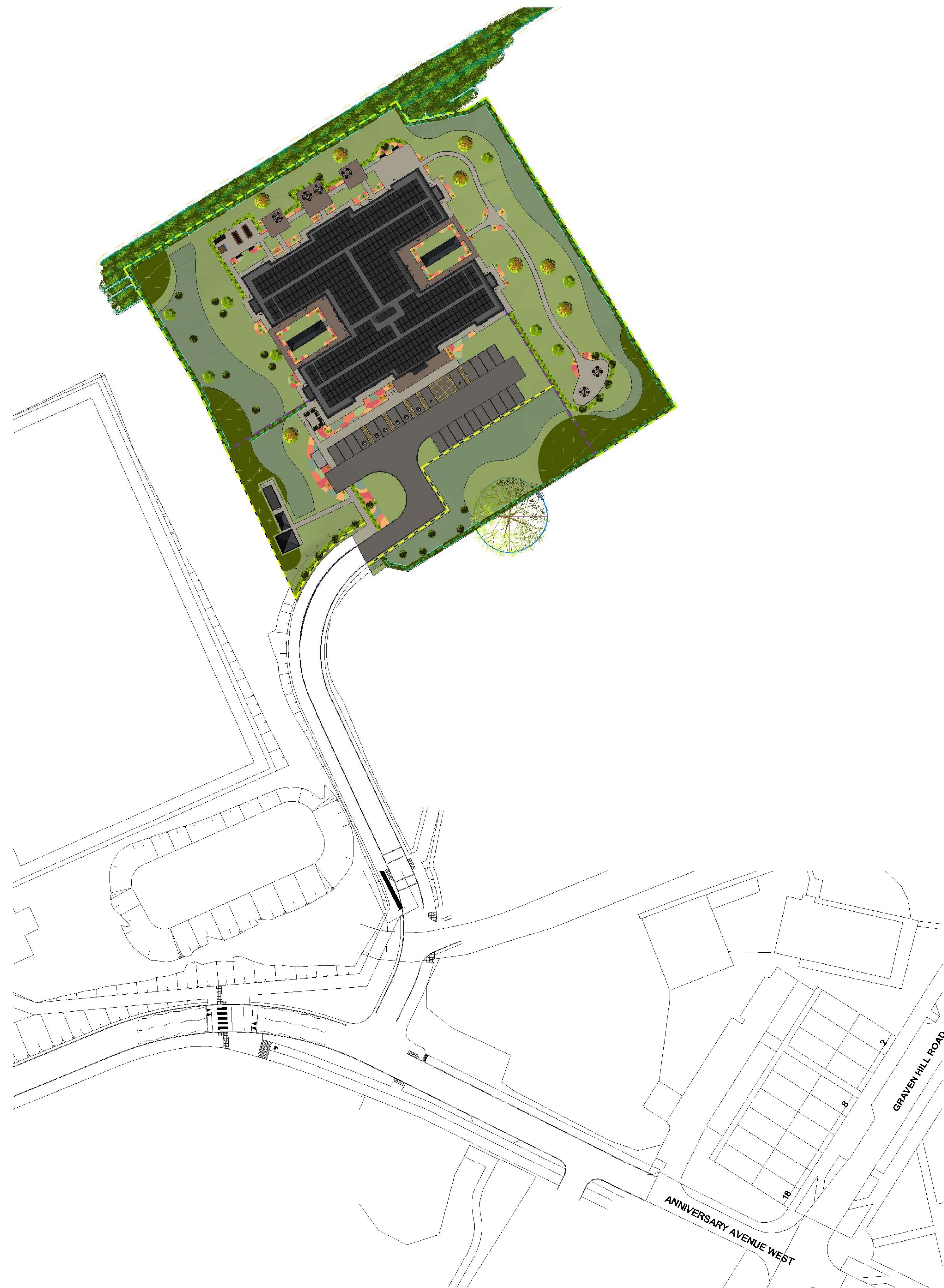
BLOCK PLAN 1 : 500