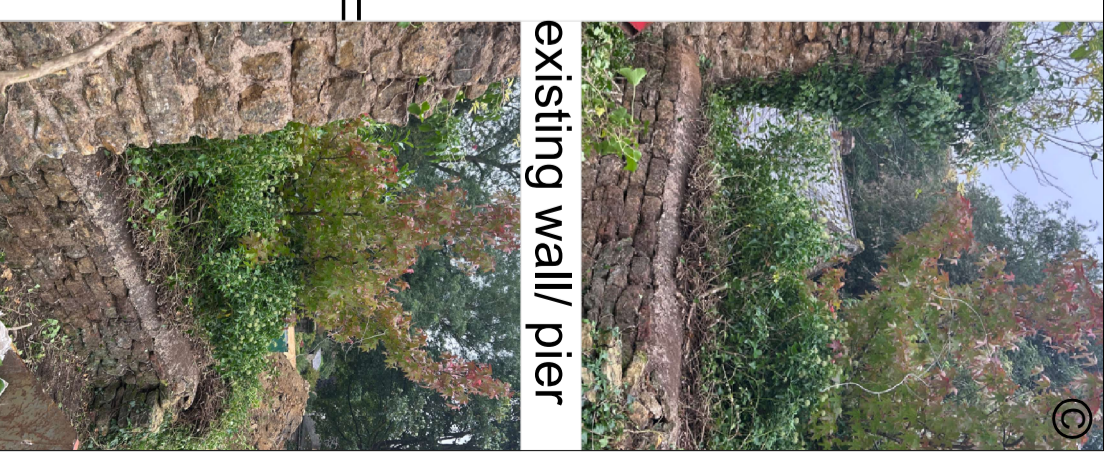
existing wall/ pier