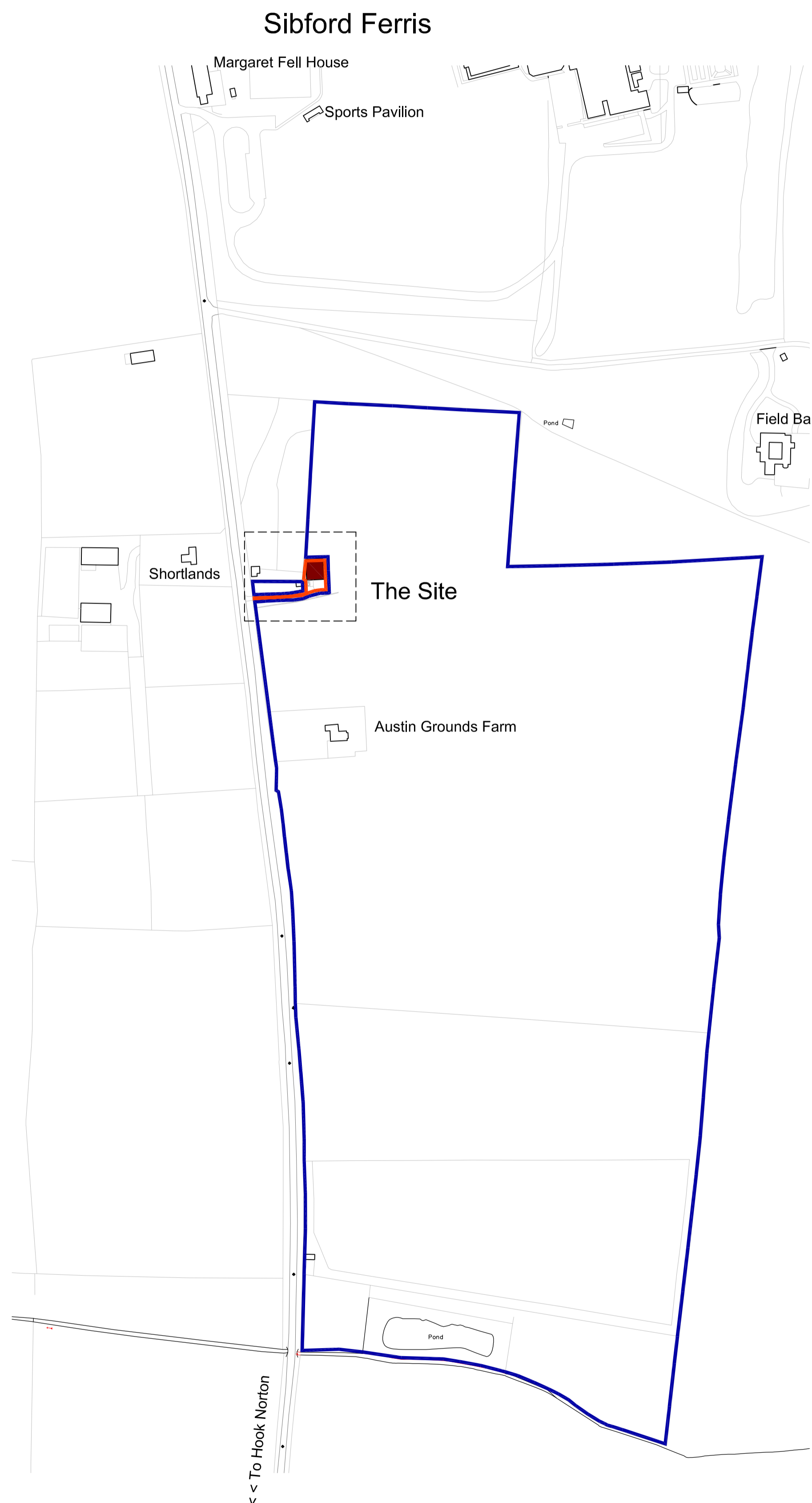
LOCATION PLAN (Scale 1:2500)