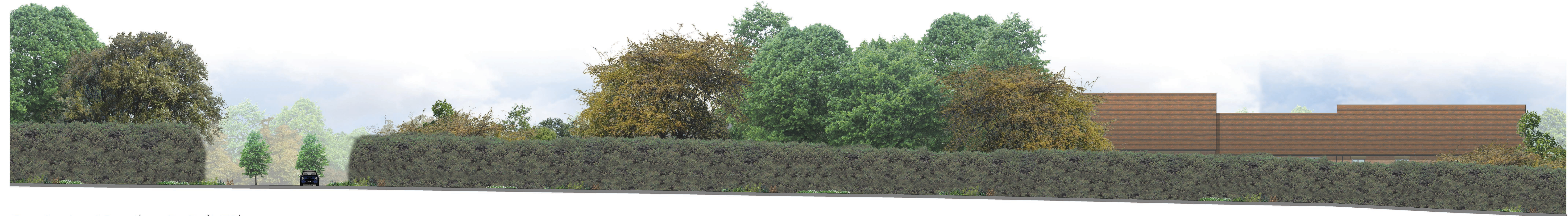
Contextual Section D_D (NTS)