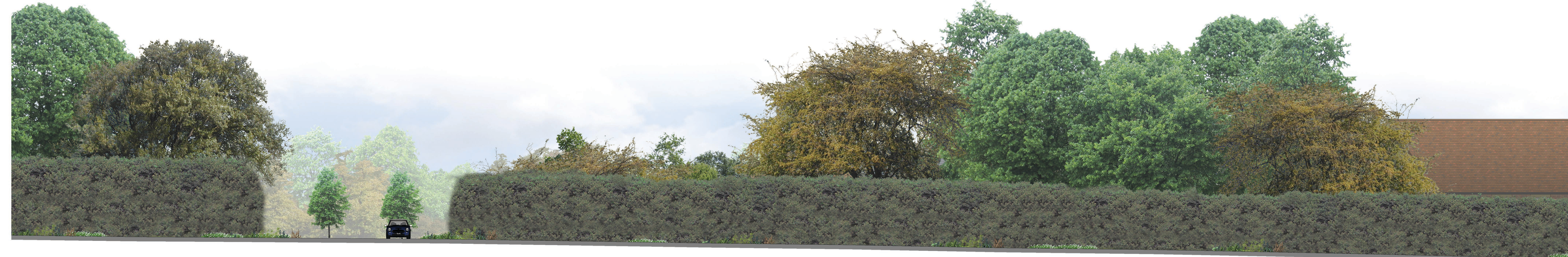
Contextual Section D_D