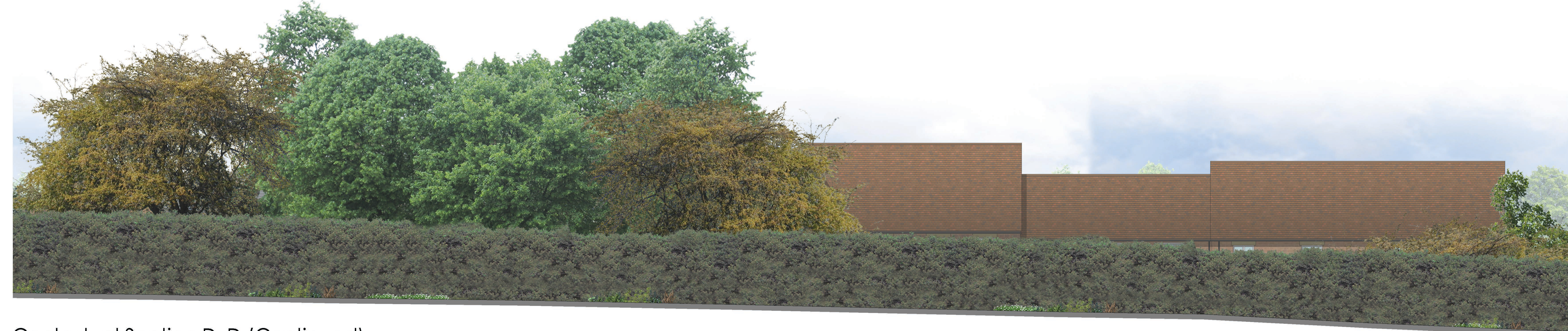
Contextual Section D_D (Continued)