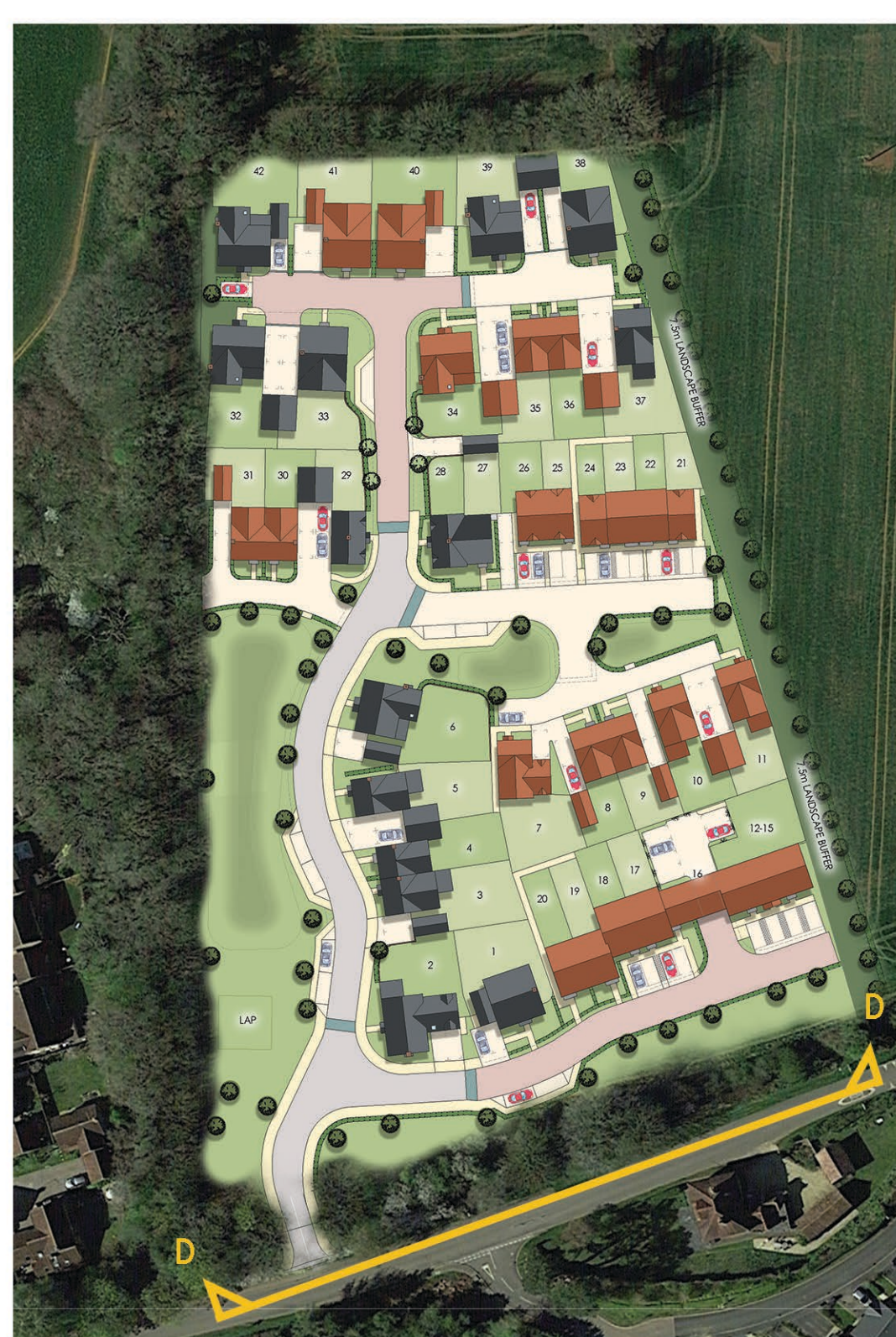
Nav Plan (NTS)