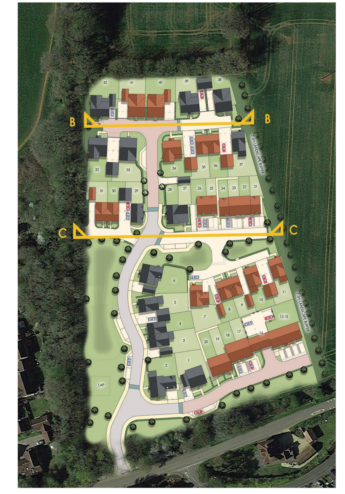
Nav Plan (NTS)