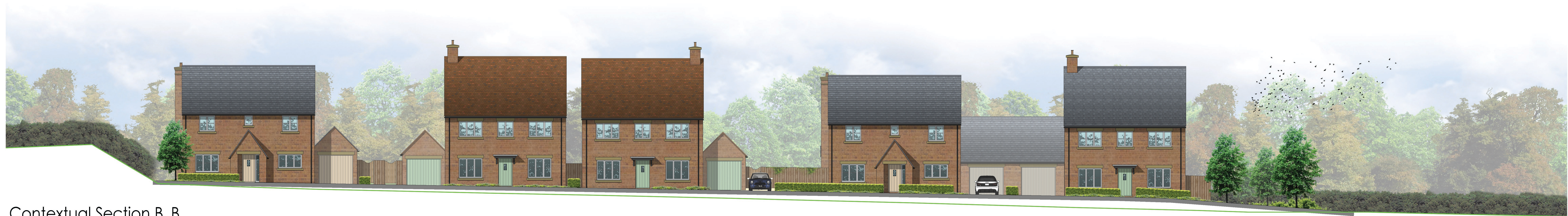
Contextual Section B_B