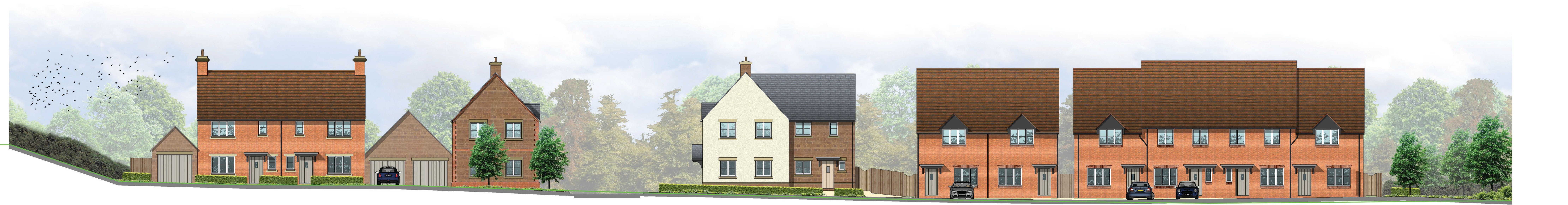
Contextual Section C_C