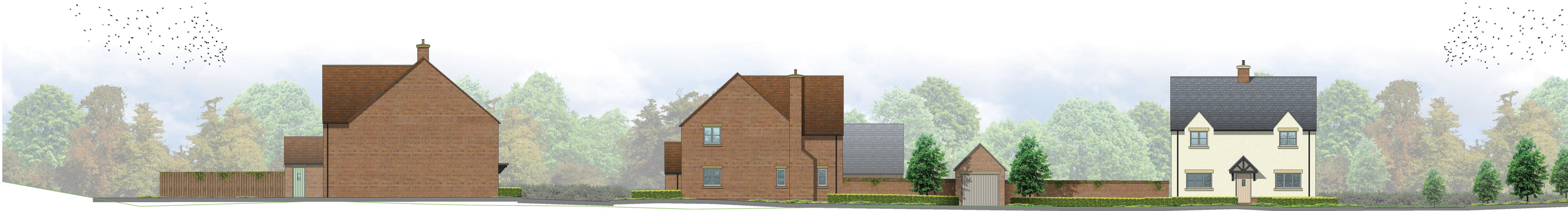
Contextual Section A_A 0m 5m 10m