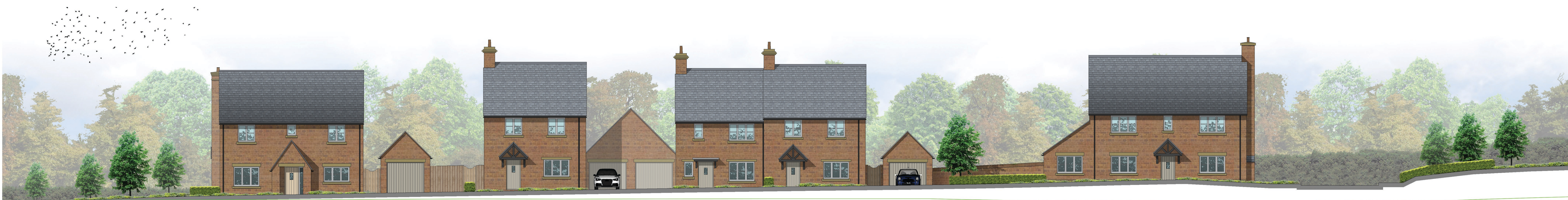
Contextual Section A_A Continued