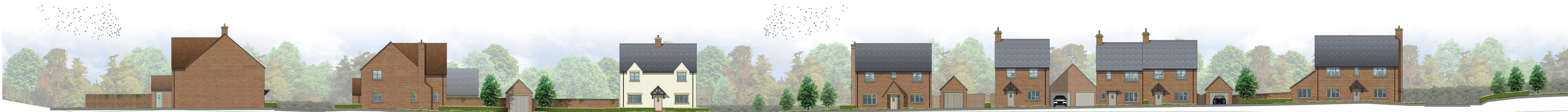
Contextual Section A_A (NTS)