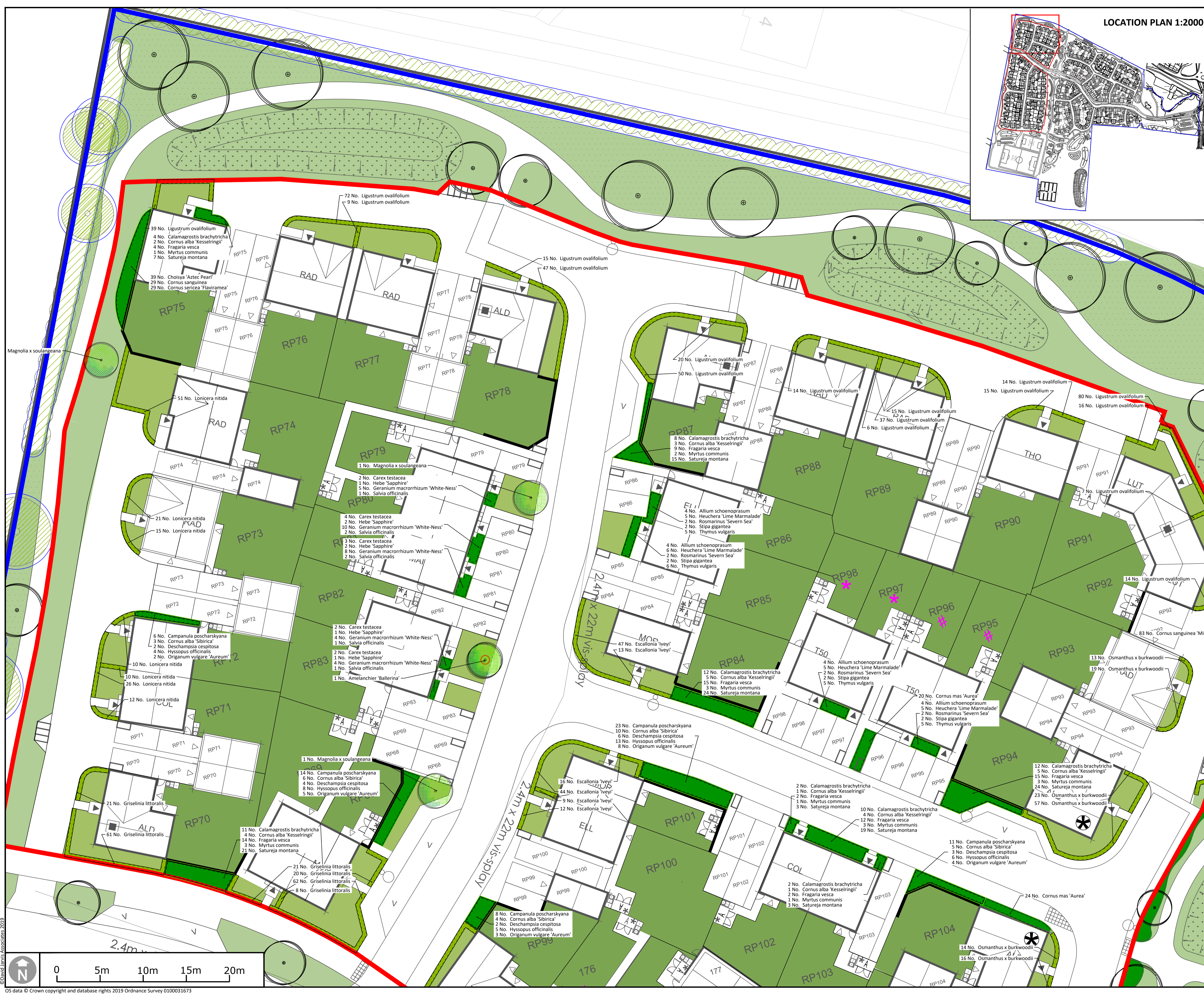
LOCATION PLAN 1:2000