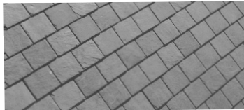
Cafersa Standard blue grey Spanish Slate.