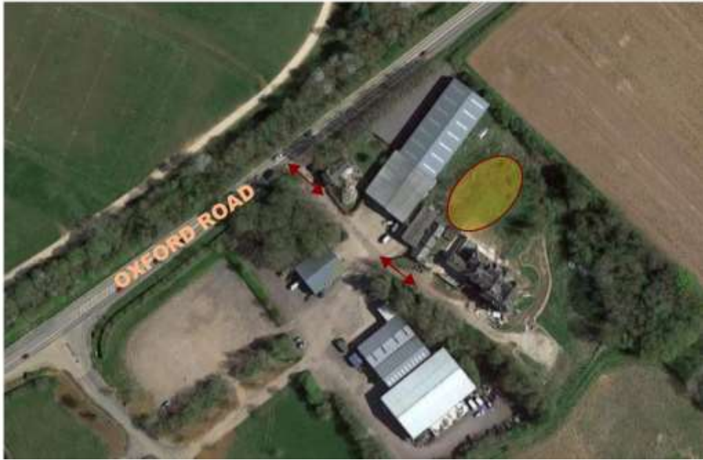
Site Location & Construction vehicle routing to the site