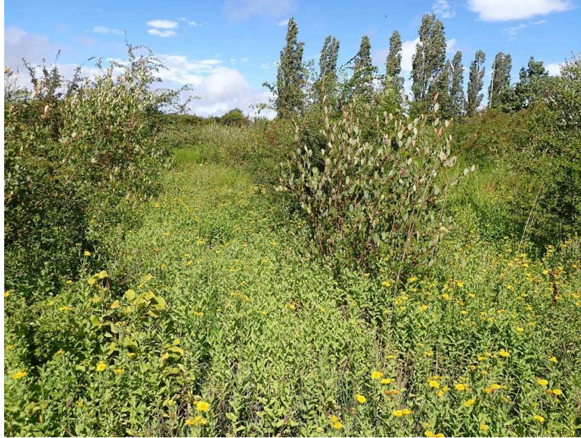
Northern fenced scrub and tree planted area, Fleabane field layer just starting to flower 12.08.2023