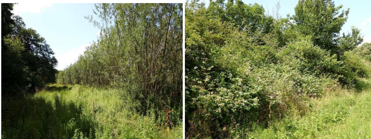
Southern most grassy and Common Fleabane-rich ride adjacent to Stratfield Brake (left) - 29.07.2023. Western margin of thick Elm and bramble scrub margin adjacent to Frieze Way (right) - 25.06.2023.