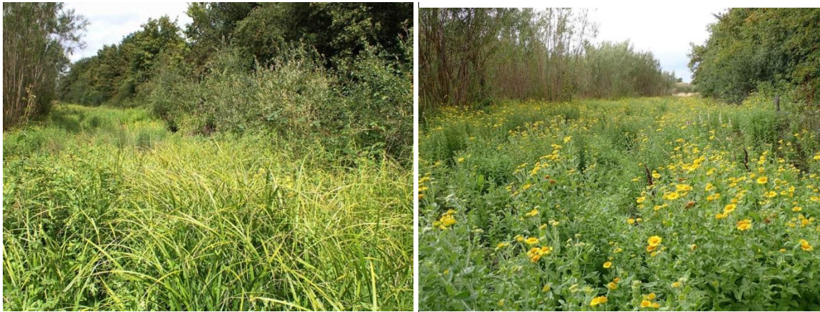
Eastern ride adjacent to marginal tree belt along Oxford Road. Very winter-wet sedge-dominated area at the south (on left) 12.08.2023, Common Fleabane Pulicaria dysenterica dominated eastern ride further north (on right) 19.08.2023