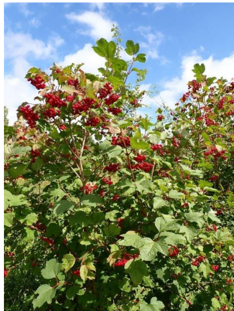
Northern fenced off mixed scrub area. Berrying Hawthorn with Flowering Fleabane field layer (left) and berrying Guelder Rose (right).12.08.2023.