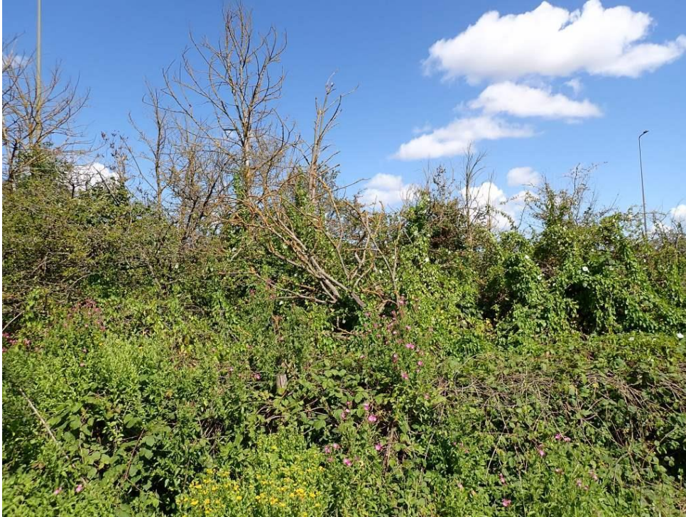
English Elm Ulmus procera on eastern margin next to Oxford Road, dying due to Dutch Elm Disease, much standing deadwood. Flower-rich scrub and buried fence in the foreground. 29.07.2023