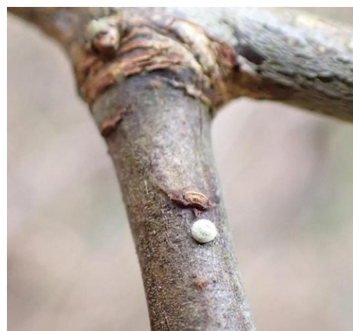
Brown Hairstreak Butterfly Thecla betulae , photographed resting under an Elm leaf on the inside of the Frieze way hedge to the Triangle on 07.09.2023. Egg on blackthorn nearby 11.02.2024