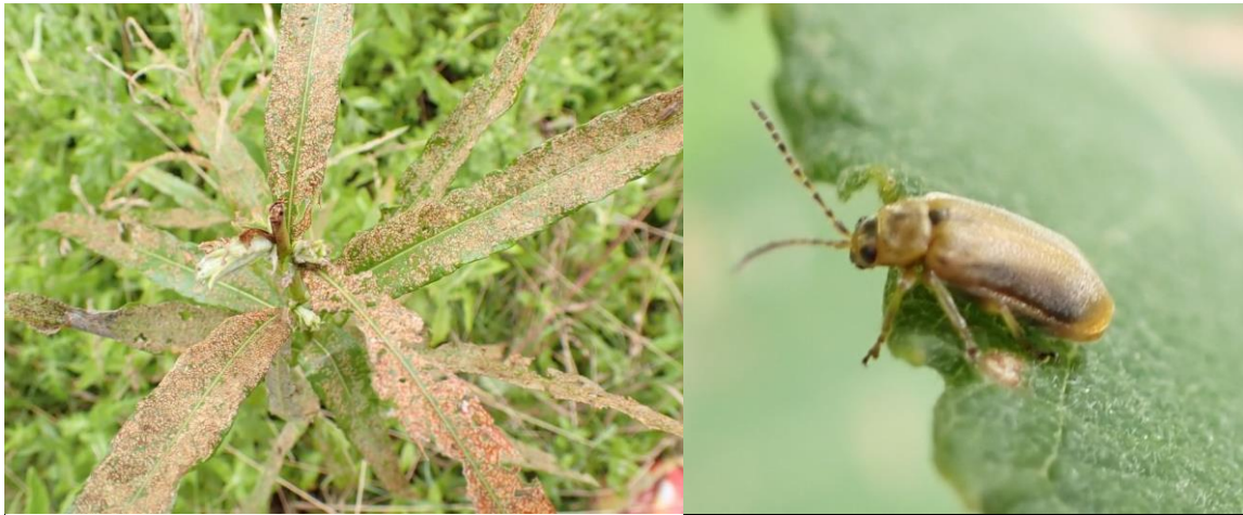
Osier willow leaves extensively grazed by beetle larvae of various common leaf beetles and the Willow Leaf Beetle Lochmaea caprea (one of the several species responsible for the feeding damage).