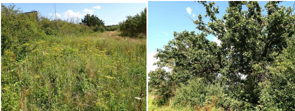
Eastern marginal ride adjacent to Oxford Road, yellow Wild parsnip Pastinaca sativa flowers in foreground (left). Mature Oak trees and Blackthorn scrub on this margin further to the south (right) - both 29.07.2023.