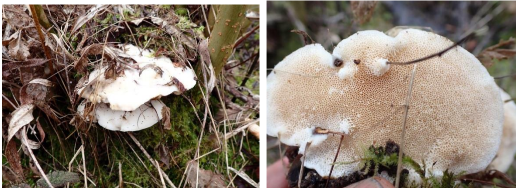
Rare Scented Bracket Trametes suaveolens on dead wood of eight old Osier coppice stools on 17.02.2024