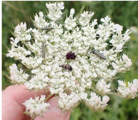
The deadwood-breeding pin-tail Mordellid beetle Variimorda villosa . 29.07.2023 The right hand photo shows this beetle (centre) and 3 other metallic green beetles Oedemera lurida on the flowerhead of Wild Carrot at the Triangle, A maroon single flower in the centre is normal for Wild Carrot.