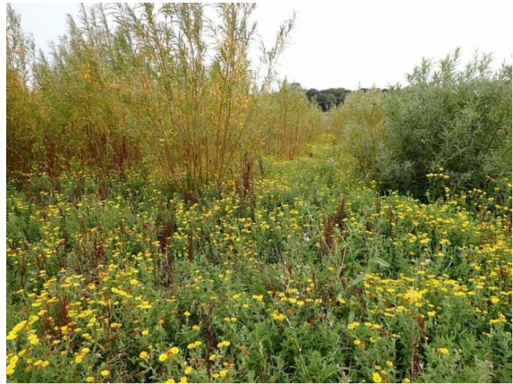
Triangle northern ride flowers and central area with Osier coppice and Common Fleabane in flower 12.08.2023 and 29.08.2023