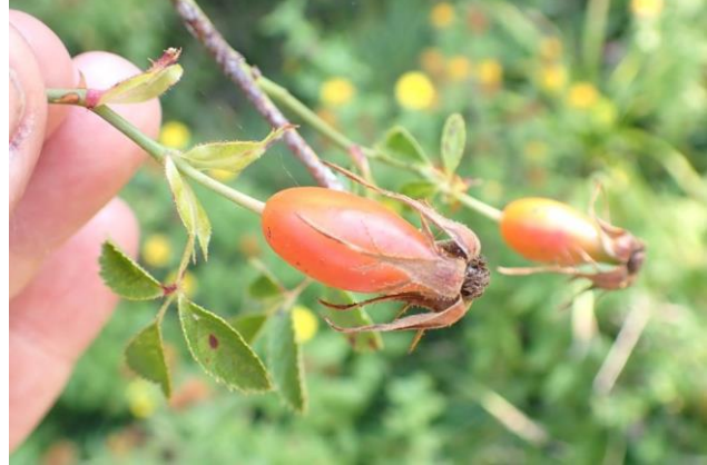
Sweet Briar (Eglantine, apple scented leaves) wild rose Rosa rubiginosa (top left) and the rare small-leaved hybrid white flowered Sweet Briar Rose that awaits identification by a wild rose expert (right and below). This last on the eastern ride along the wire fence line 09.07.2023 and 07.09.2023.