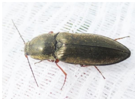
Paraphotistus nigricornis . A rare click beetle swept from a ride at the Triangle on 25.08.2023. Note the golden hairs which tend to rub off. Photo from my personal photo archive, from Oxford Meadows SAC in 2016, a site a short distance to the south-west of the Triangle.