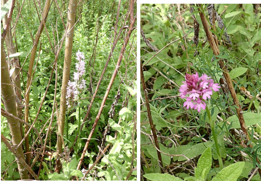
Common spotted orchids Dactylorhiza fuchsii (left) and Pyramidal orchids Anacamptis pyramidalis (right) under willow coppice and surrounded by Common Fleabane plants, 25.07.2023