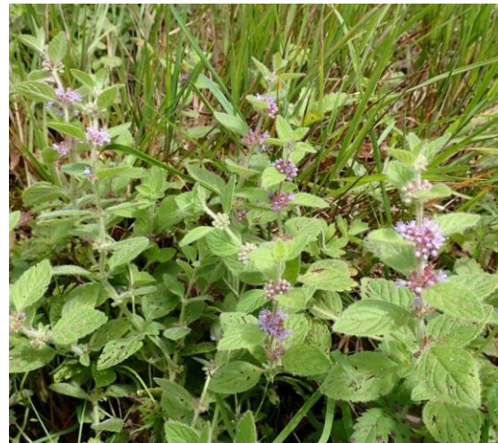
Narrow-leaved Bird's-foot Trefoil Lotus tenuis (Scarce in Oxon, in county Rare Plants Register) on 09.07.2023 in a ride (left) and Corn Mint Mentha arvensis under Osier coppice (on New England Red List) 29.07.2023 (right).