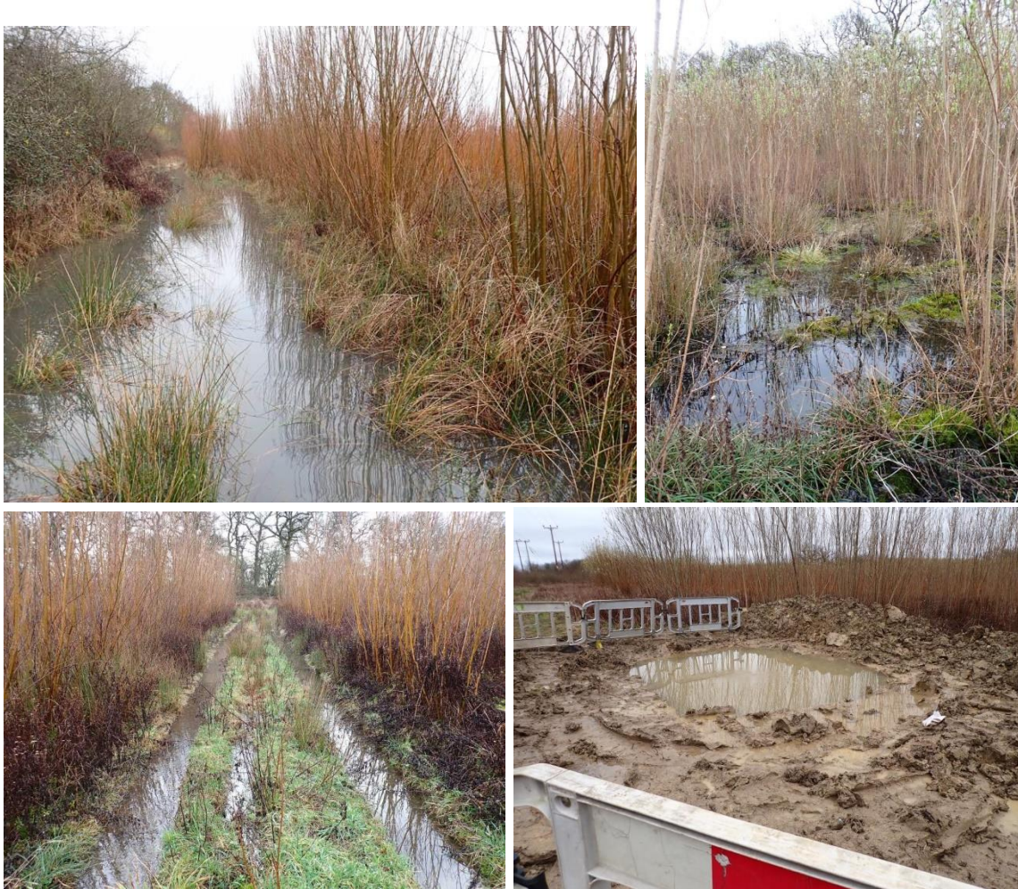
Winter flooding of the site, photographs from 02.01.2024 to 17.02.2024. Last photo shows how flooding is making leaking gas main repair by SGN very difficult