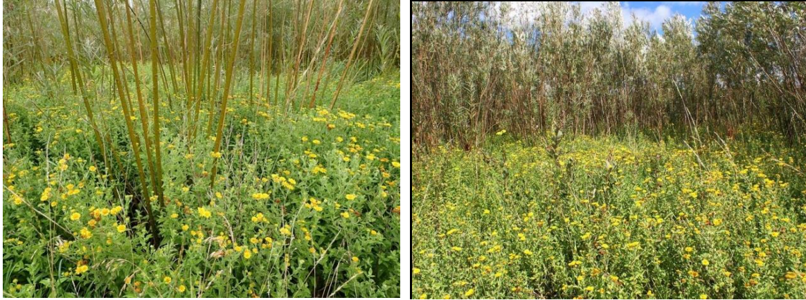
Sheets of Common Fleabane Pulicaria dysenterica in full golden flower under Osier coppice blocks - 06.08.2023 & 12.08.2023