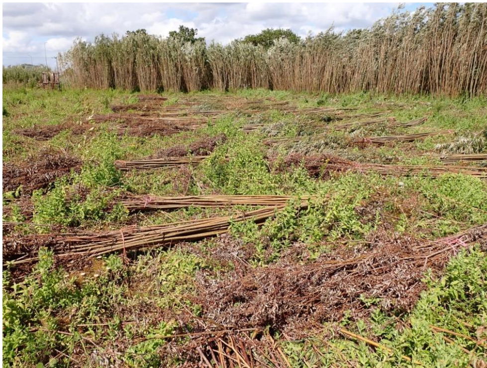
Osier willows cut and bundled ready for use. A new temporary glade created - 29.07.2023

Flooding and ground conditions in the Triangle during autumn, winter 2023 and spring 2024