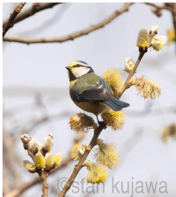
Male Osier willow catkins flowering on 24.02.2024. Food for early flying insects, providing nectar and pollen which can also be taken by birds such as Blue Tits, example here.