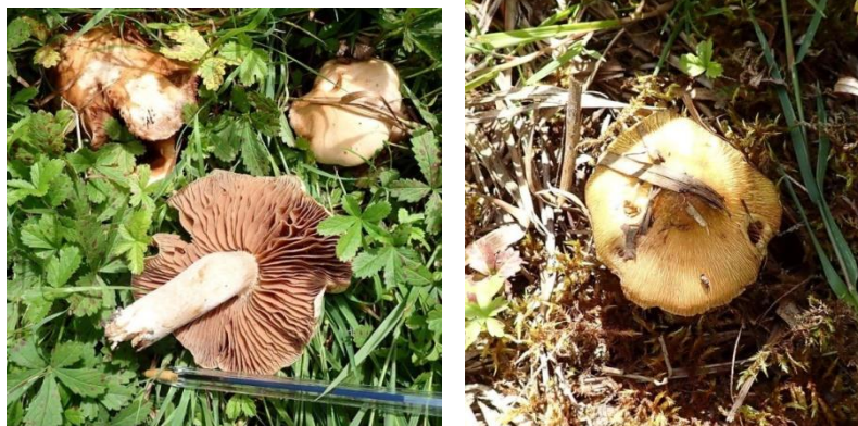
Fungi. Sweet Poison Pie Hebeloma sacchariolens (left) and a Fibre cap Inocybe sp. (right). Both mycorrhizal with the roots of the Willows (Osiers) 12.08.2023 & 29.07.2023.