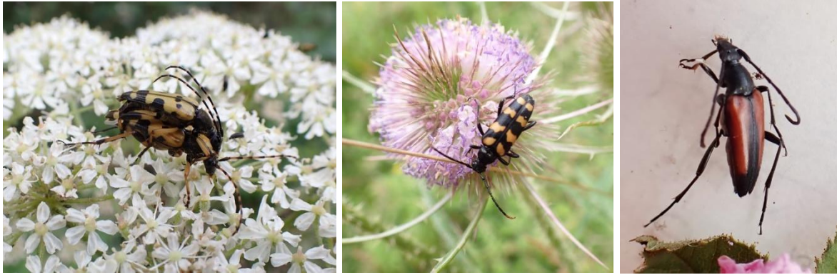
Three deadwood-breeding Longhorn Beetles found on flowers in the Triangle. Spotted Longhorn beetles Rutpela maculata , mating pair on Hogweed flowers (left). Four-spotted Longhorn Leptura quadrifasciata on Teasel flowers (centre) and Black-striped Longhorn Stenurella melanura on Rose flower (right). All common, but spectacular deadwood breeding beetles. Various dates in July and August.