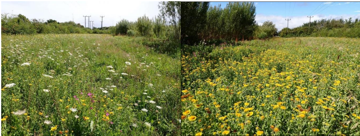
Two views of the wide grassy ride at north end of site in full flower, wet meadow-like flora with abundant flowers of yellow Common Fleabane, white Wild Carrot and pink Great Willow herb. Under overhead cabling - 12.08.2023.