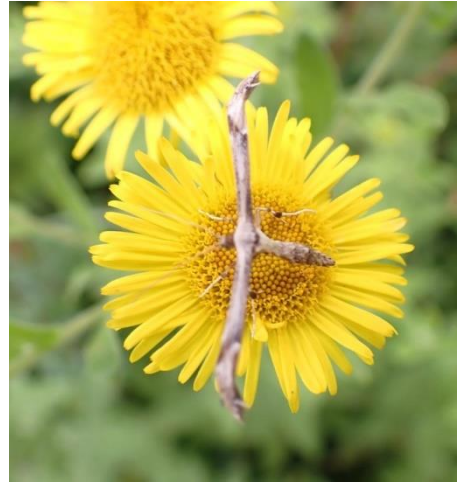
Red-tipped Clearwing Moth Synanthedon formicaeformis (left). Caterpillars breed in willow twigs, especially Osiers. Found in the Triangle on 06.08.2023. Dusky Plume moth Oidaematophorus lithodactyla (right). Caterpillars breed in Fleabane flowers. 20.07.2023.