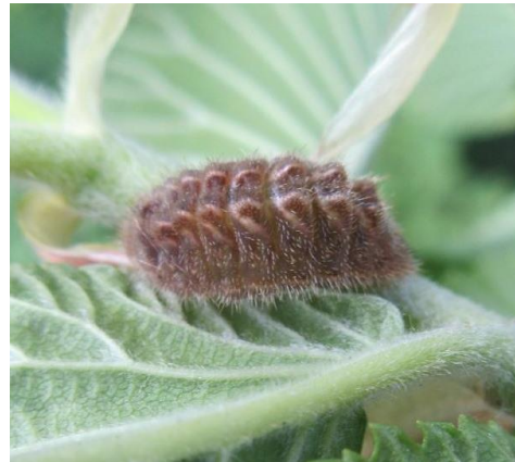
White Letter Hairstreak Satyrium w-album butterfly adult and caterpillar. Adult photo from my personal archive, (not within the Triangle) but the caterpillar on right was found on an elm leaf on adjacent Frieze Way on 15.05.2020