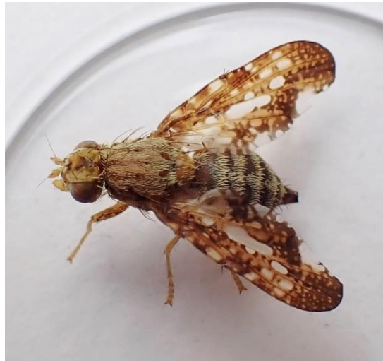
The Swiss-cheese Tephritid (picture-wing) fly Merzomyia westermanni . This Notable/Very Local fly breeds in flowers of Hoary Ragwort. One swept on 23.09.2023.