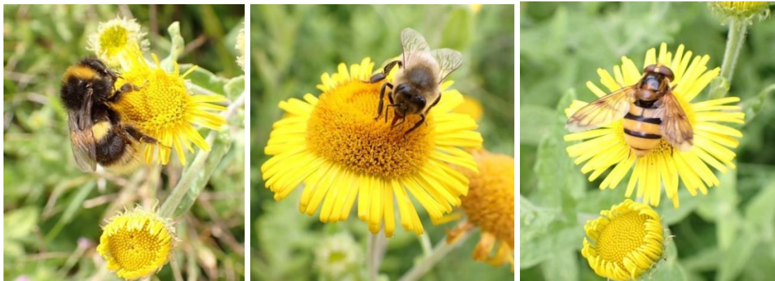
All common insects love Fleabane flowers. Buff-tailed Bumble bee Bombus terrestris queen (left). Large numbers of Honey Bees Apis mellifera (centre) also use the flowers as do hoverflies e.g. Volucella inanis (right). 12.08.2023