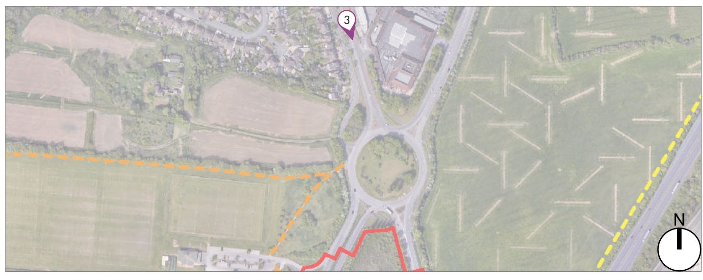
VIEWPOINT LOCATION PLAN