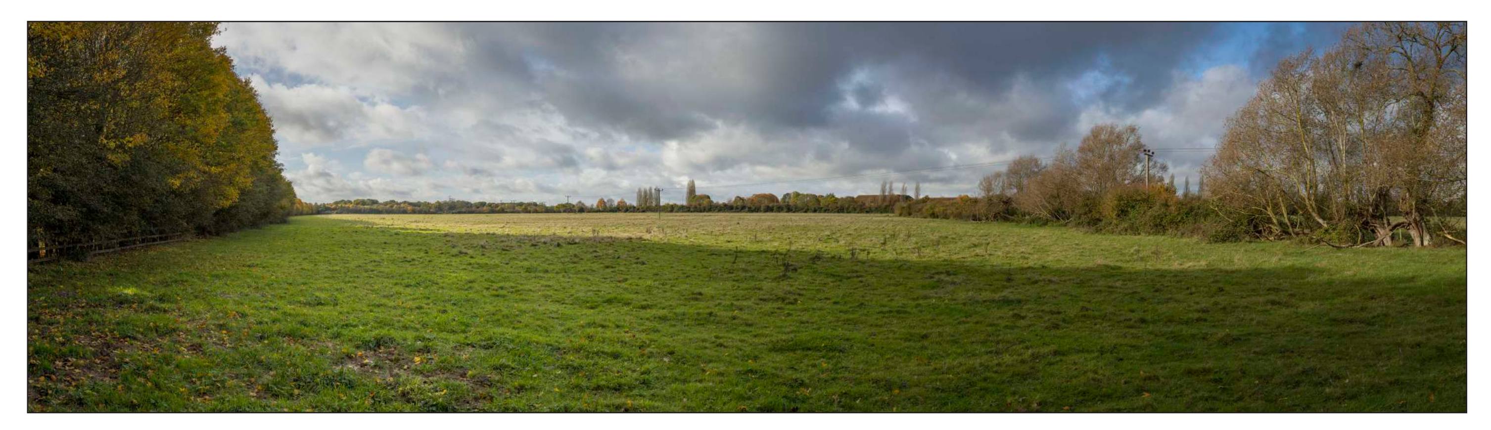
FIGURE 7.69 VVM VIEW 2: BASELINE PHOTO VIEW FROM PROW 229/4/30 TO THE EAST OF THE SITE WITHIN THE PR7A RESIDENTIAL ALLOCATION SITE, LOOKING WEST TOWARDS THE SITE.