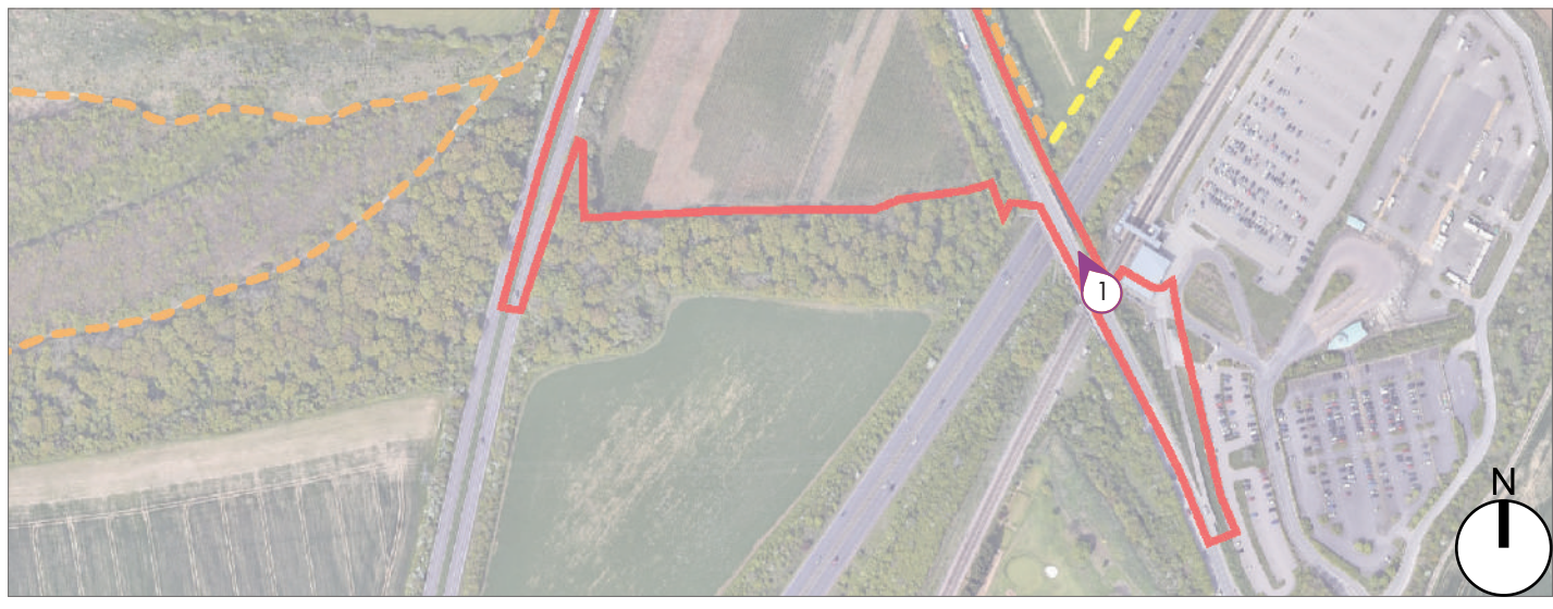
VIEWPOINT LOCATION PLAN