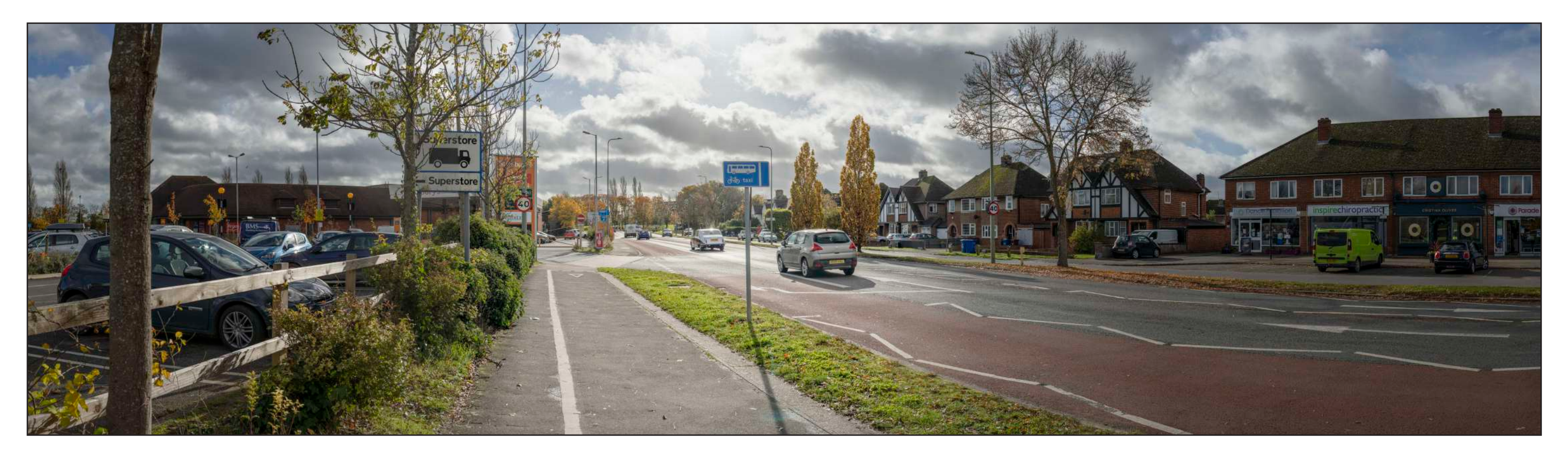
FIGURE 7.73 VVM VIEW 3: PROPOSED DEVELOPMENT AT YEAR 1 VIEW FROM OXFORD ROAD TO THE NORTH OF THE SITE ADJACENT TO THE SAINSBURY'S SUPERSTORE CAR PARK WITH THE YEAR 1 PROPOSED DEVELOPMENT PARTIALLY VISIBLE WHERE GAPS IN THE EXISTING VEGETATION ON KIDLINGTON ROUNDABOUT ALLOW. THE EXISTING CHARACTER OF THE SKYLINE IS RETAINED.