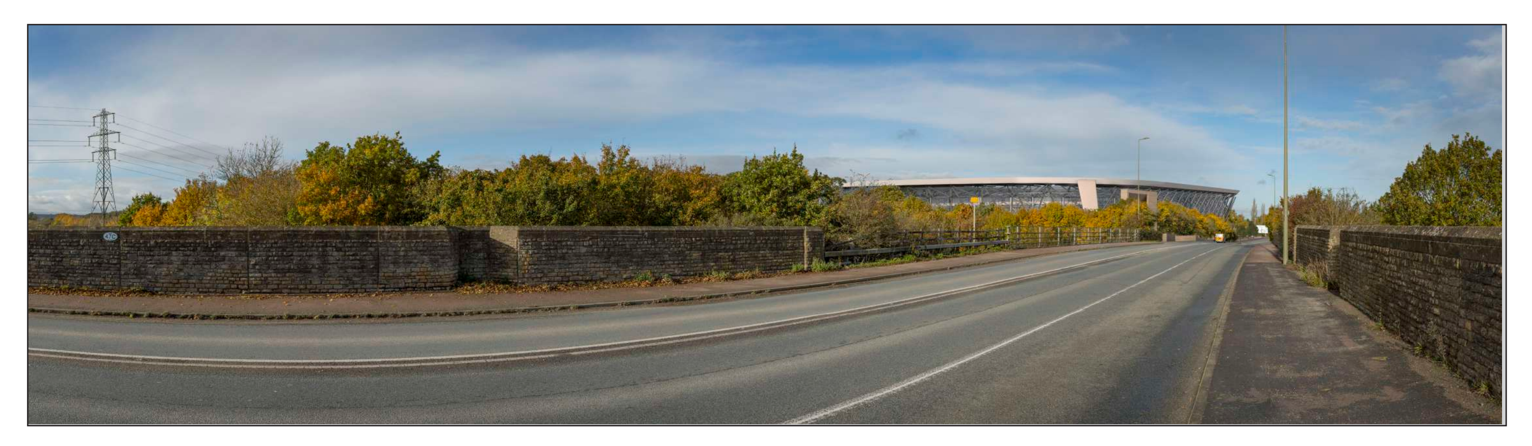
FIGURE 7.67 VVM VIEW 1: PROPOSED DEVELOPMENT AT YEAR 1 VIEW FROM OXFORD ROAD AS IT CROSSES THE BRIDGE OVER THE RAILWAY LINE WITHIN THE SITE, LOOKING NORTH TOWARDS THE CENTRAL FIELD WITHIN THE SITE WITH THE YEAR 1 PROPOSED DEVELOPMENT VISIBLE AGAINST THE SKYLINE ABOVE THE TREE LINE.