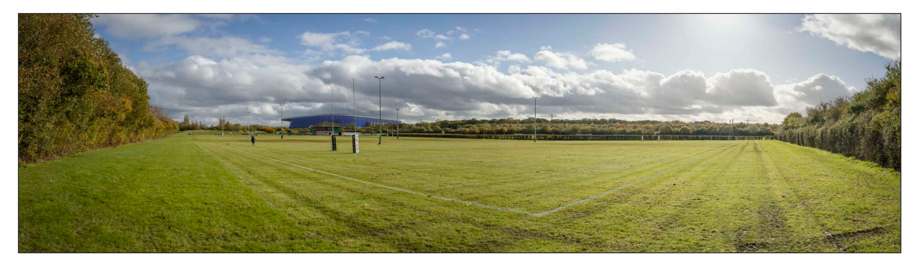
FIGURE 7.76 VVM VIEW 4: PROPOSED DEVELOPMENT AT YEAR 1 VIEW FROM THE NORTHERN HALF OF STRATFIELD BRAKE SPORTS GROUND WHERE THE RUGBY PITCHES ARE LOCATED, LOOKING EAST TOWARDS THE SITE WITH THE YEAR 1 PROPOSED DEVELOPMENT VISIBLE AGAINST THE SKYLINE ABOVE THE TREE LINE.