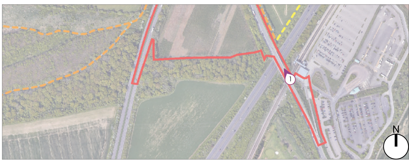
VIEWPOINT LOCATION PLAN