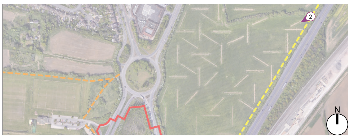
VIEWPOINT LOCATION PLAN