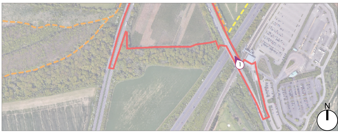
VIEWPOINT LOCATION PLAN