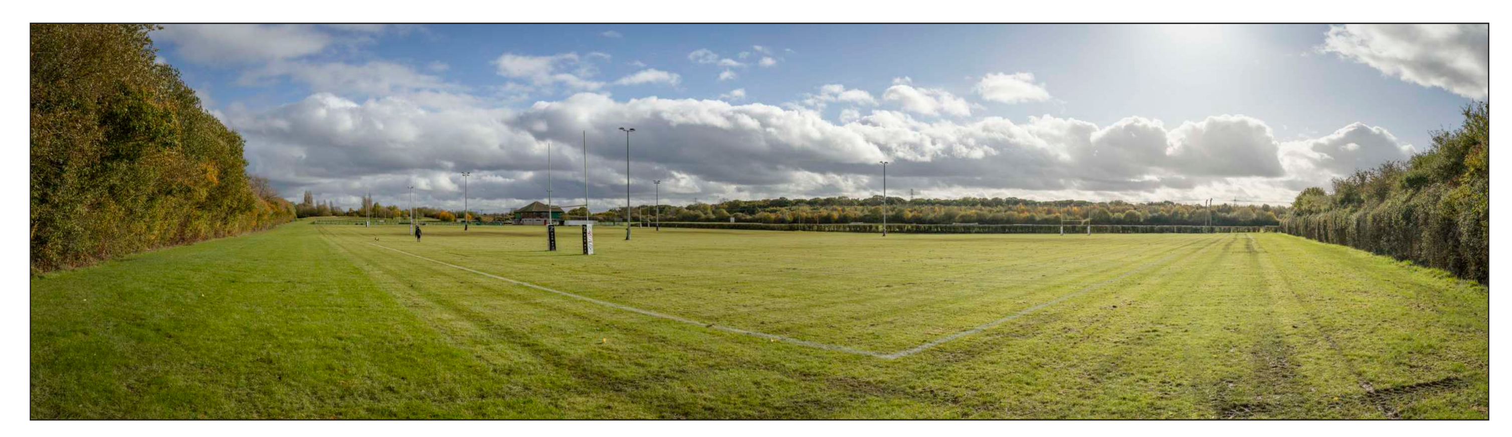
FIGURE 7.75 VVM VIEW 4: BASELINE PHOTO VIEW FROM THE NORTHERN HALF OF STRATFIELD BRAKE SPORTS GROUND WHERE THE RUGBY PITCHES ARE LOCATED, LOOKING EAST TOWARDS THE SITE.