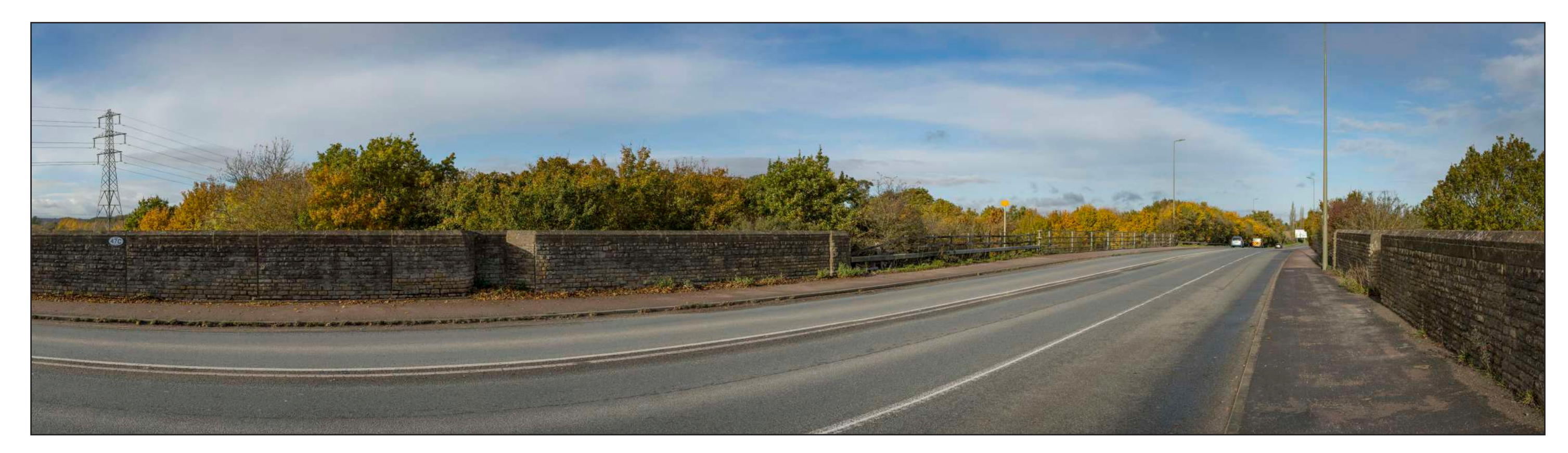
FIGURE 7.66 VVM VIEW 1: BASELINE PHOTO VIEW FROM OXFORD ROAD AS IT CROSSES THE BRIDGE OVER THE RAILWAY LINE WITHIN THE SITE, LOOKING NORTH TOWARDS THE CENTRAL FIELD WITHIN THE SITE.