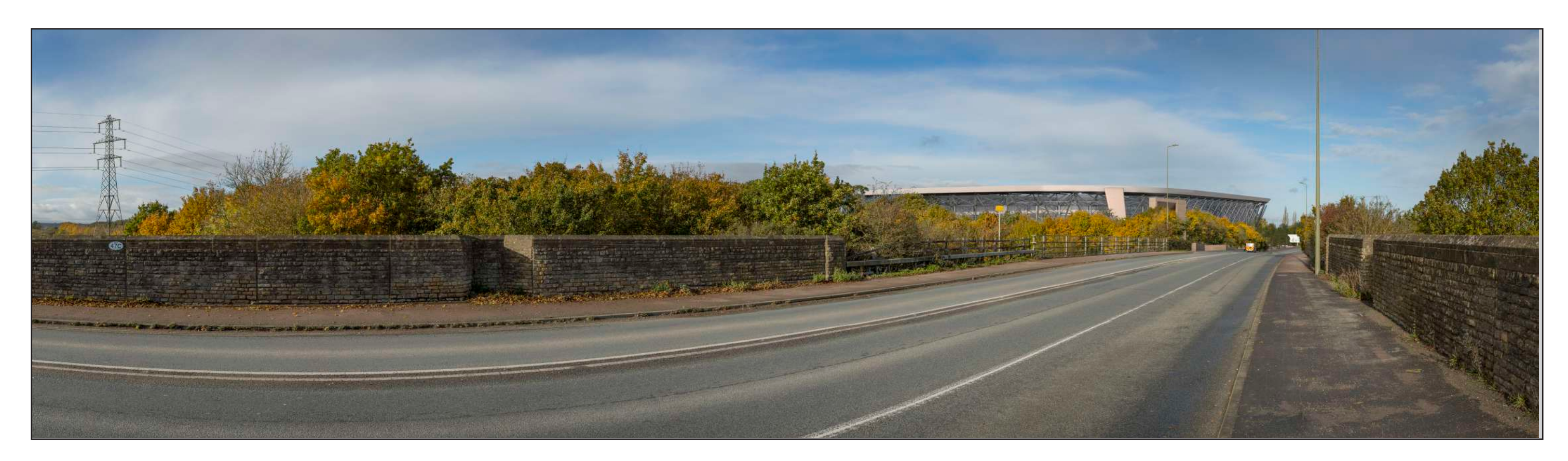
FIGURE 7.68 VVM VIEW 1: PROPOSED DEVELOPMENT AT YEAR 15 VIEW FROM OXFORD ROAD AS IT CROSSES THE BRIDGE OVER THE RAILWAY LINE WITHIN THE SITE, LOOKING NORTH TOWARDS THE CENTRAL FIELD WITHIN THE SITE WITH THE YEAR 15 PROPOSED DEVELOPMENT VISIBLE AGAINST THE SKYLINE ABOVE THE TREE LINE.