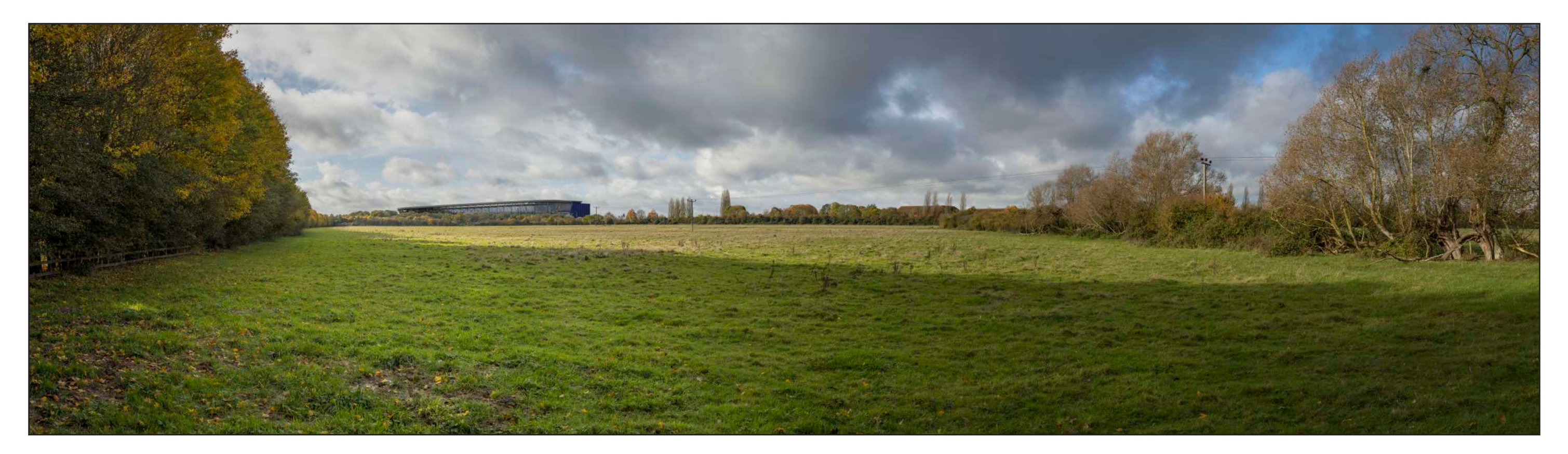
FIGURE 7.70 VVM VIEW 2: PROPOSED DEVELOPMENT AT YEAR 1 VIEW FROM PROW 229/4/30 TO THE EAST OF THE SITE WITHIN THE PR7A RESIDENTIAL ALLOCATION SITE, LOOKING WEST TOWARDS THE SITE WITH THE YEAR 1 PROPOSED DEVELOPMENT VISIBLE AGAINST THE SKYLINE ABOVE THE TREE LINE.