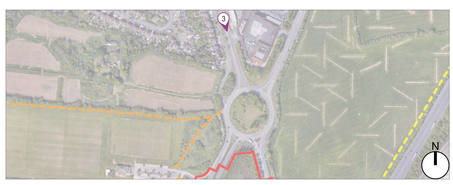
VIEWPOINT LOCATION PLAN