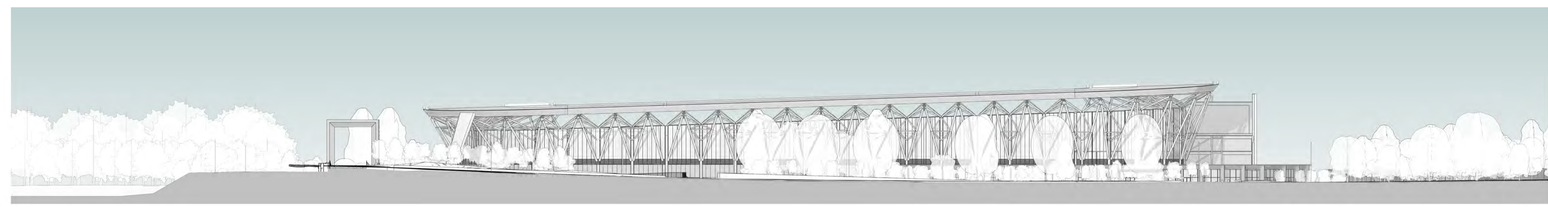
1 Context Elevation East 1 : 500

NOTES All dimensions and levels to be checked on site Any discrepancies are to be reported to the Architect before any work commences This drawing shall not be scaled to ascertain any dimensions, work to figured dimensions only This drawing shall not be reproduced without express written permission from AFL Architects Ltd. DISCLAIMER When this drawing is issued in CAD, it is an uncontrolled version issued for information only, to enable the recipient to prepare their own documents/drawings for which they are solely responsible. SOFTWARE INTEROPERABILITY AFL prepared this drawing using Autodesk REVIT Architecture. AFL does not accept liability for any loss or degradation of any information held in the drawing resulting from the translation from the original file format to any other file format or from the recipient's reading of it in any other programme.