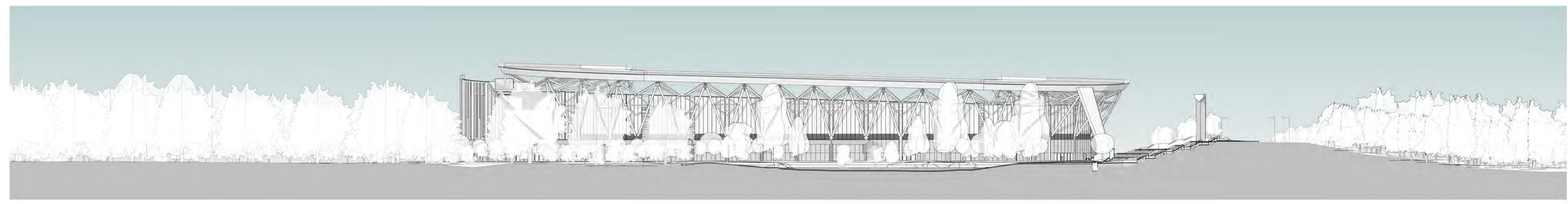
3 Context Elevation South 1 : 500