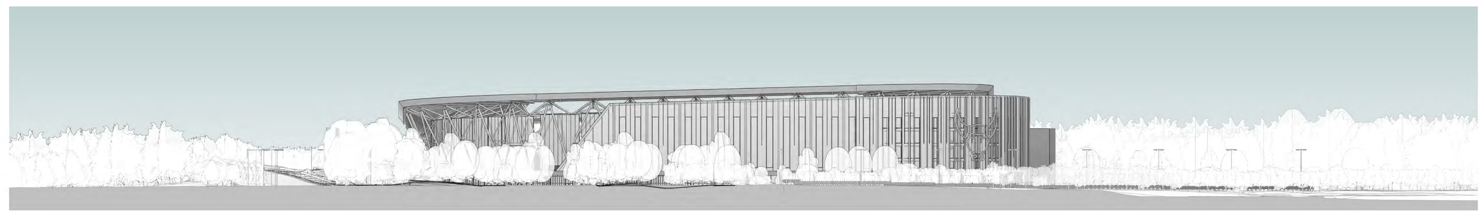
4 Context Elevation North 1 : 500