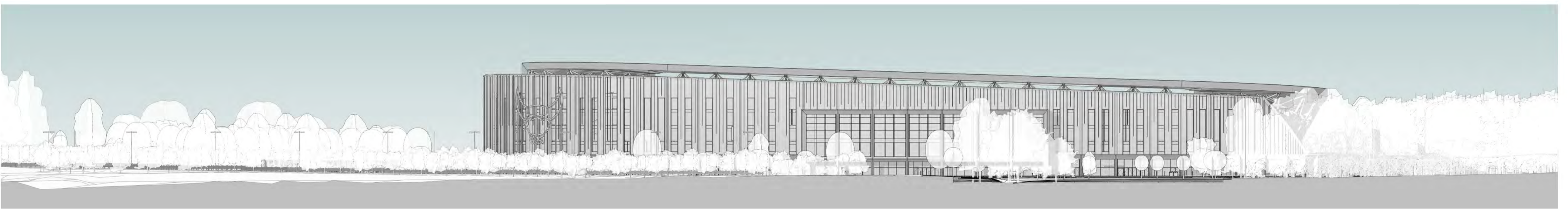
2 Context Elevation West 1 : 500