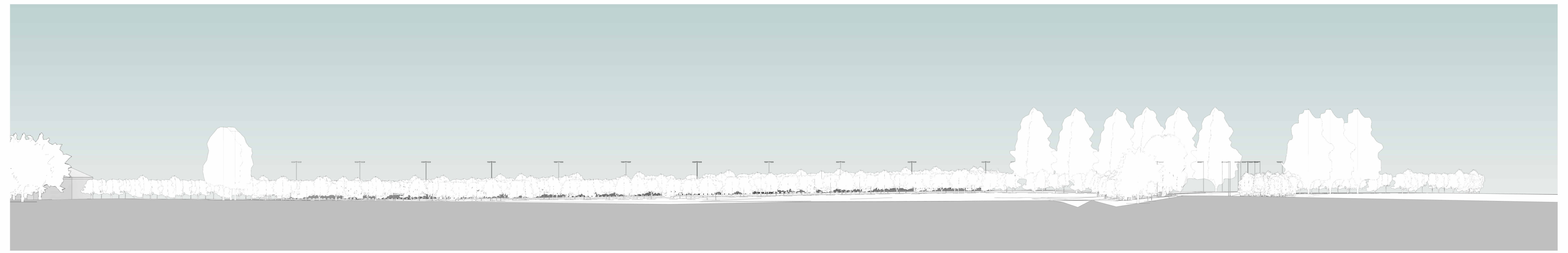
1 Existing Site Section E-W 1 : 500