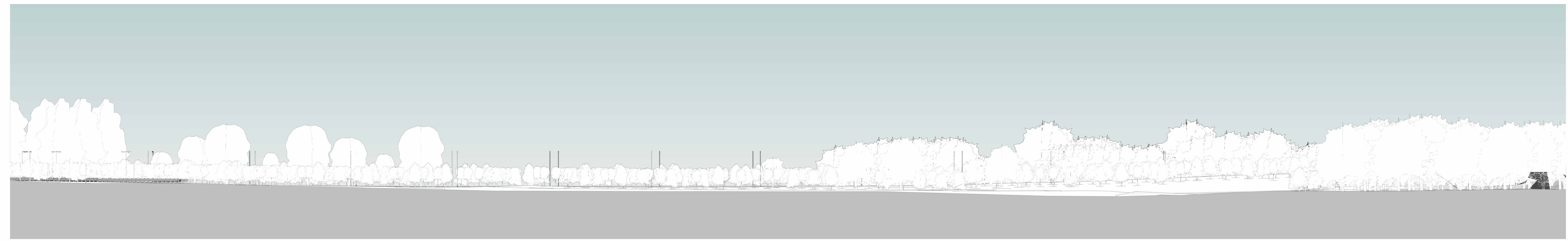
2 Existing Site Section N-S 1 : 500

NOTES All dimensions and levels to be checked on site Any discrepancies are to be reported to the Architect before any work commences This drawing shall not be scaled to ascertain any dimensions, work to figured dimensions only This drawing shall not be reproduced without express written permission from AFL Architects Ltd. DISCLAIMER When this drawing is issued in CAD, it is an uncontrolled version issued for information only, to enable the recipient to prepare their own documents/drawings for which they are solely responsible. SOFTWARE INTEROPERABILITY AFL prepared this drawing using Autodesk REVIT Architecture. AFL does not accept liability for any loss or degradation of any information held in the drawing resulting from the translation from the original file format to any other file format or from the recipient's reading of it in any other programme.