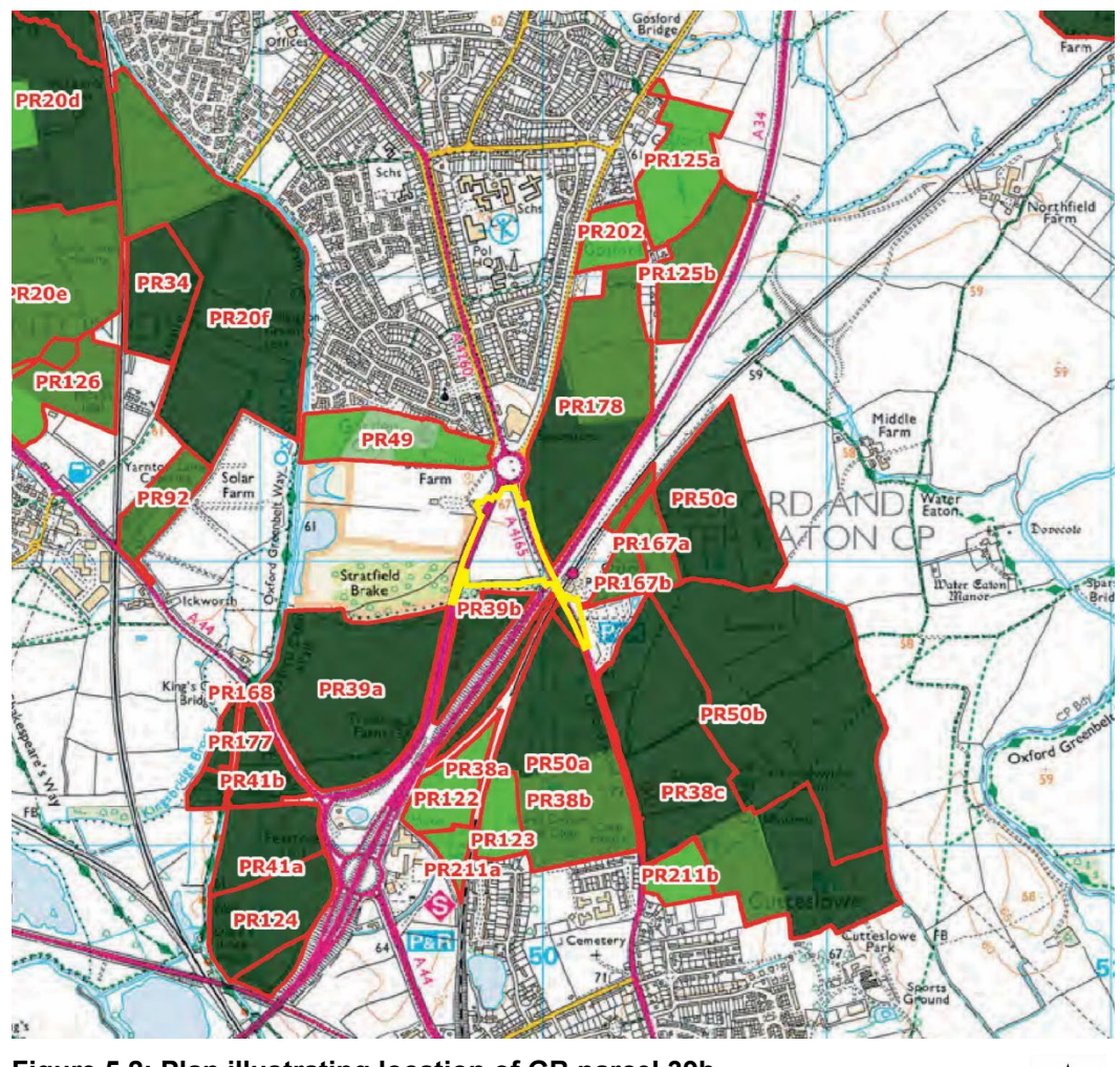
Figure 5.2: Plan illustrating location of GB parcel 39b