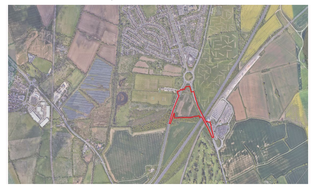
2.05 Figure 2.1: Aerial photo of the Site and its immediate context