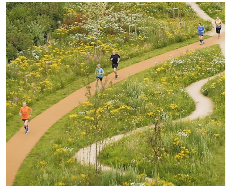
HIERARCHY OF ROUTES THROUGH WILD-FLOWER MEADOW