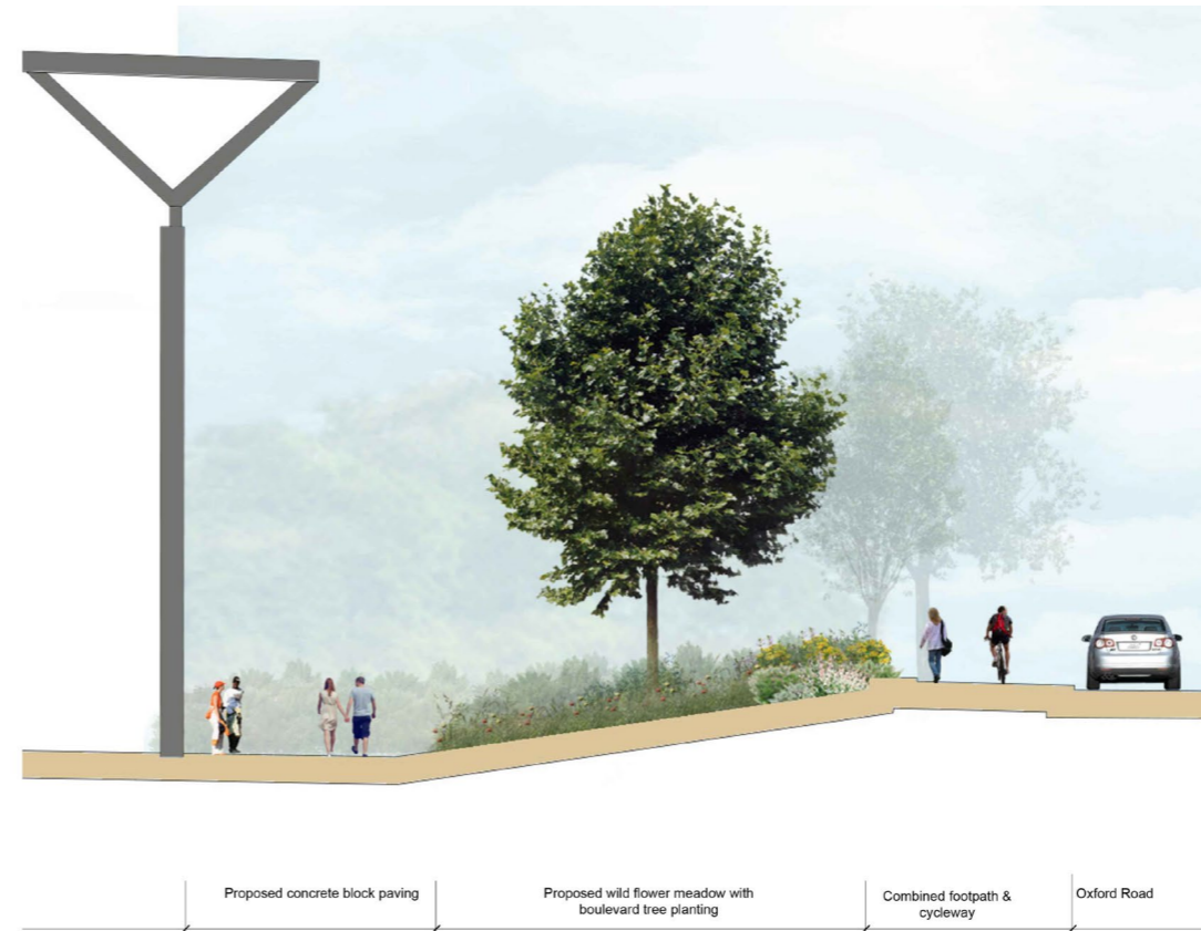
8004 2 Section G-GG Scale: 1:100