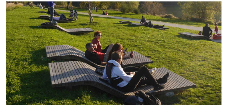
OPPORTUNITIES TO RELAX AND UNWIND