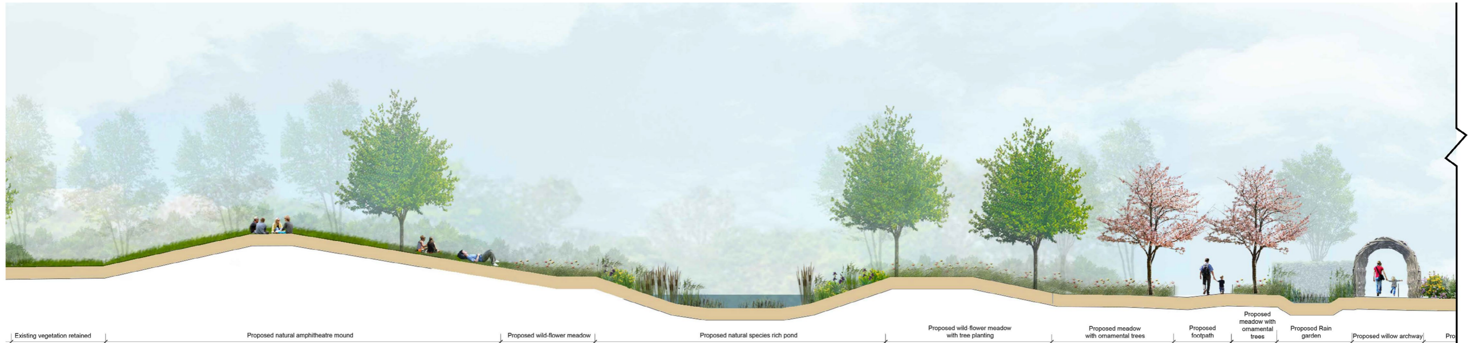
8002 Section C-CC 1 Scale: 1:100