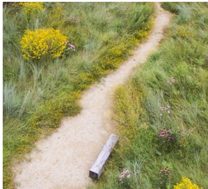
WILD-FLOWER/ ECOLOGY LED PLANTING TYPOLOGIES