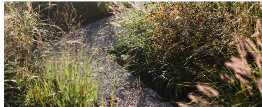
SPECIES RICH PLANTING

With its lush planting, sculpted mound, transitional areas and expansive lawn, it offers a harmonious blend of nature leisure, and community engagement.