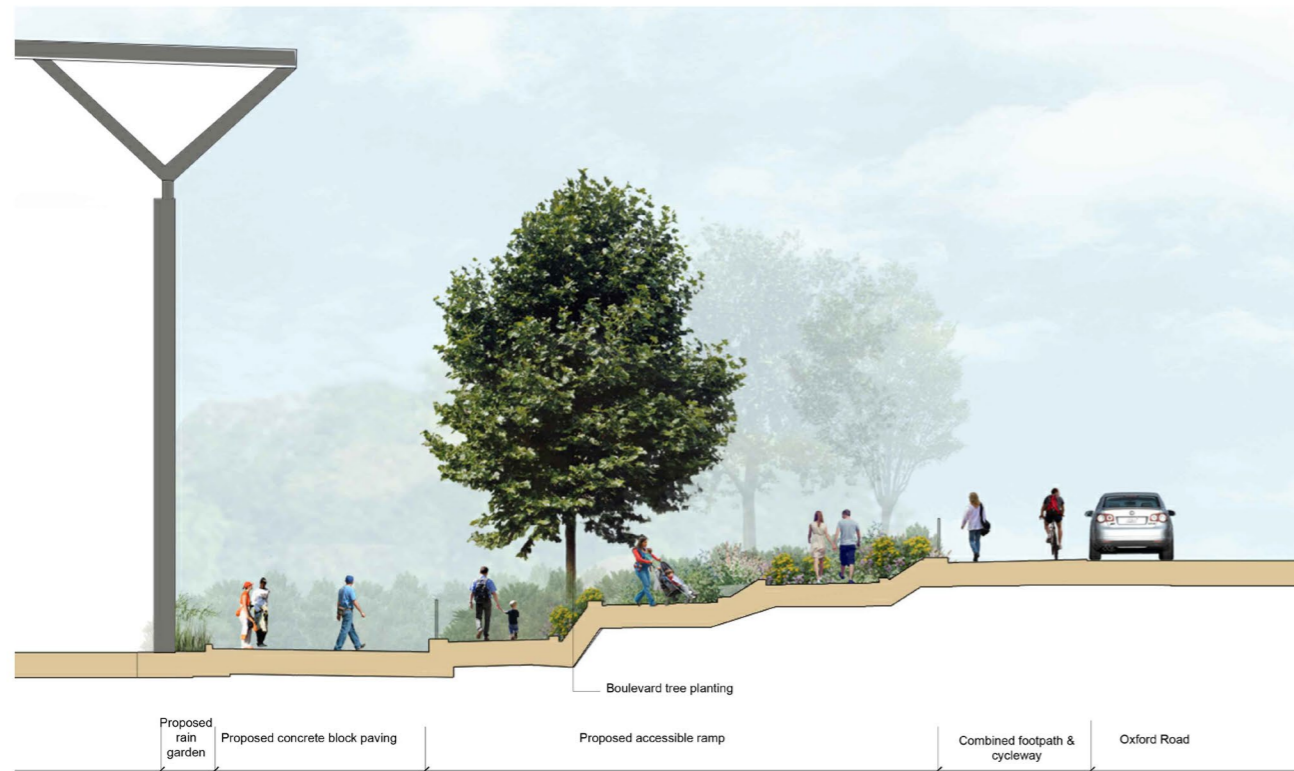
8004 3 Section H-HH Scale: 1:100