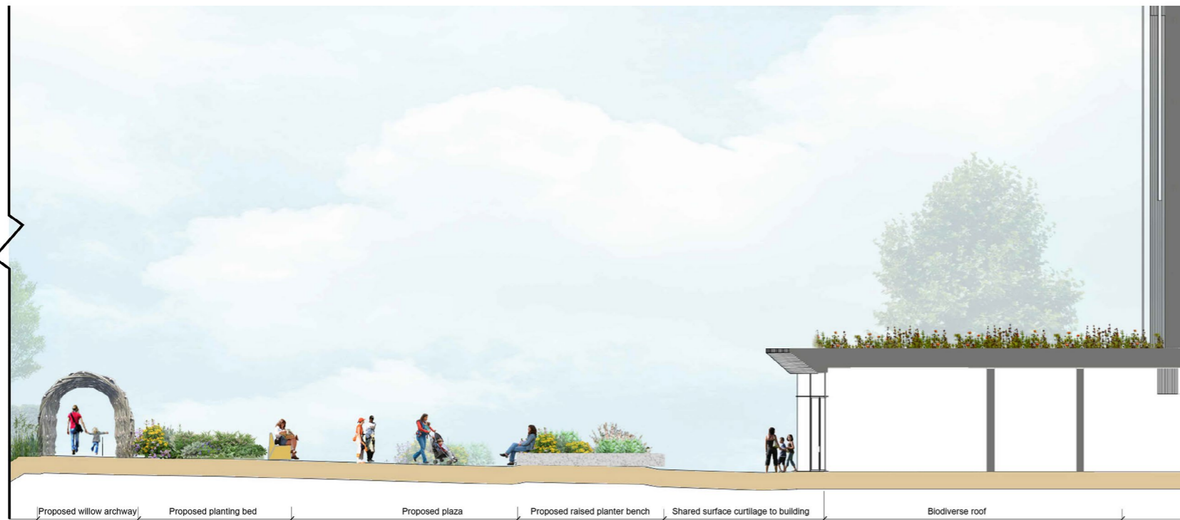
8002 Section C-CC Continued 2 Scale: 1:100