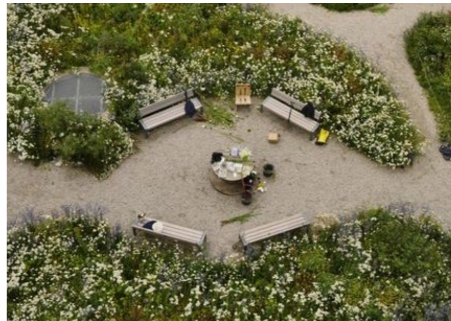
OPPORTUNITIES TO RELAX AND UNWIND WITHIN POCKETS OF NATURE