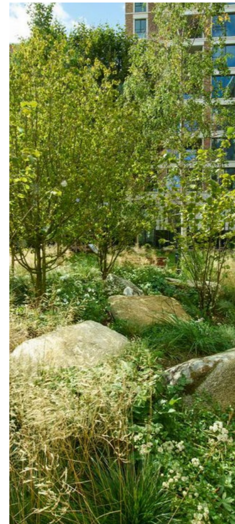
MULTI LAYERED PLANTING