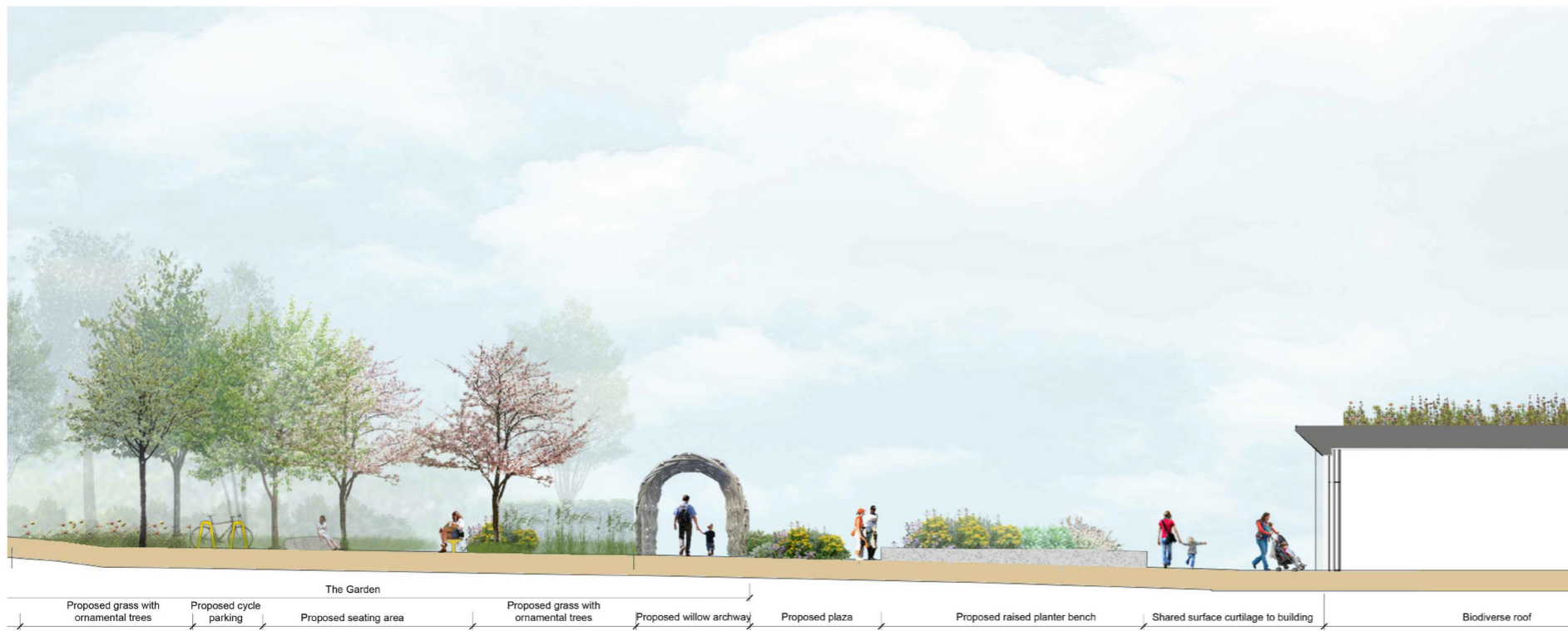
8001 Section D-DD Scale: 1:100