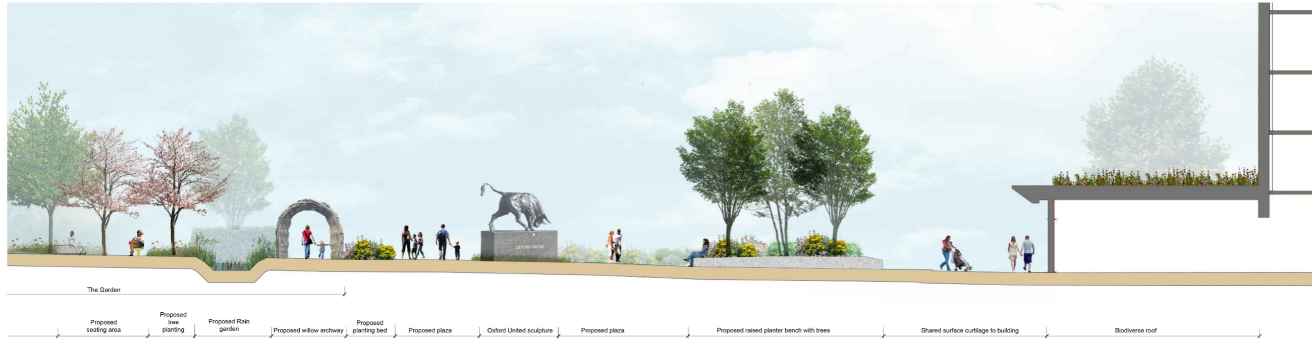
8001 Section B-BB Scale: 1:200