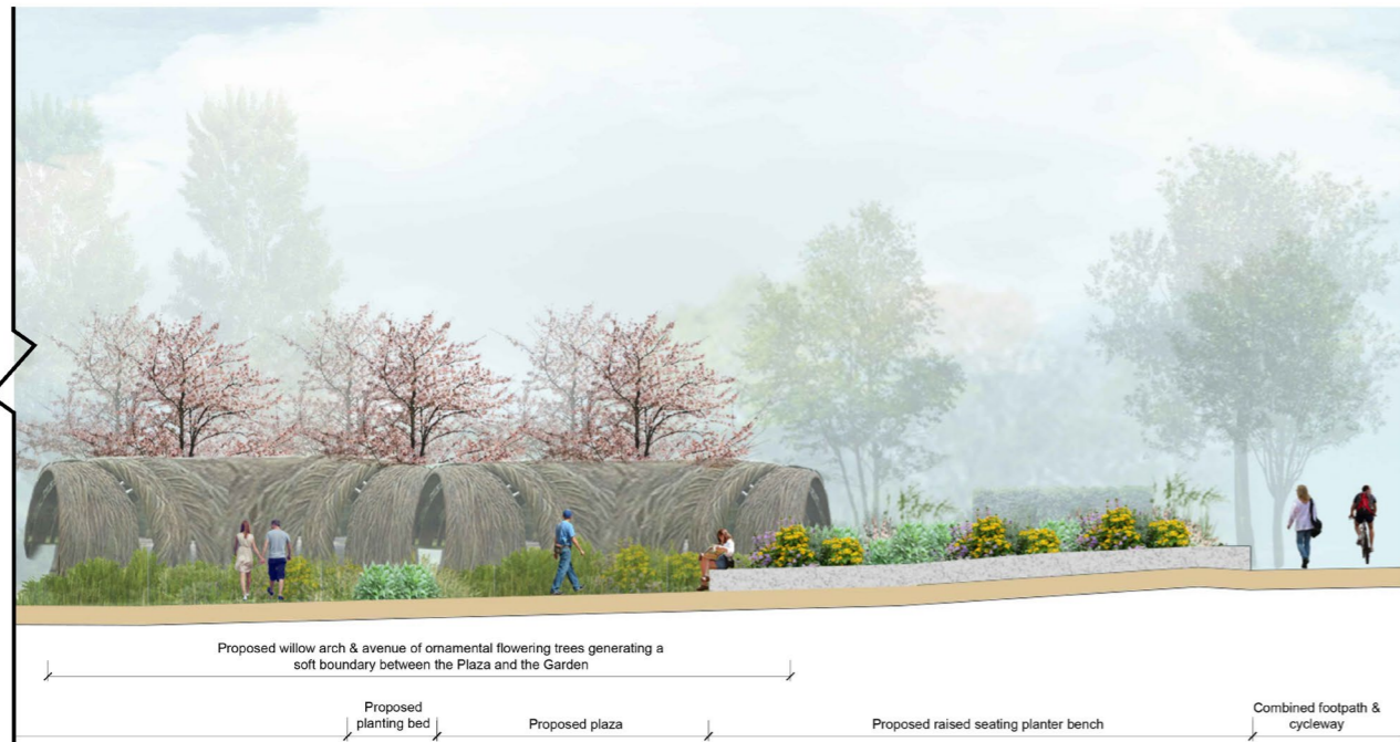
8000 Section A-AA Continued 2 Scale: 1:100