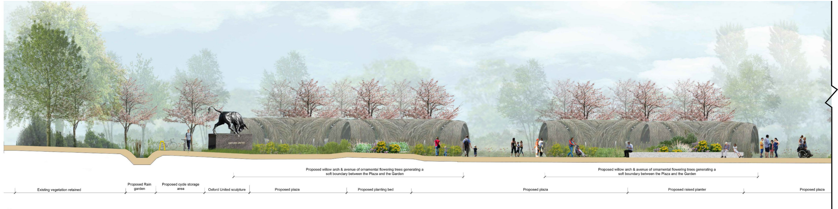
8000 Section A-AA 1 Scale: 1:100