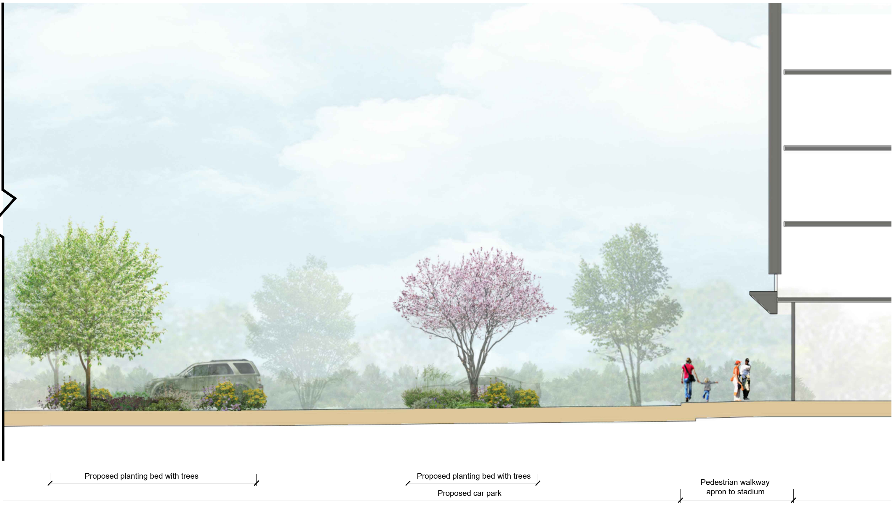
8003 Section E-EE Continued Scale: 1:100