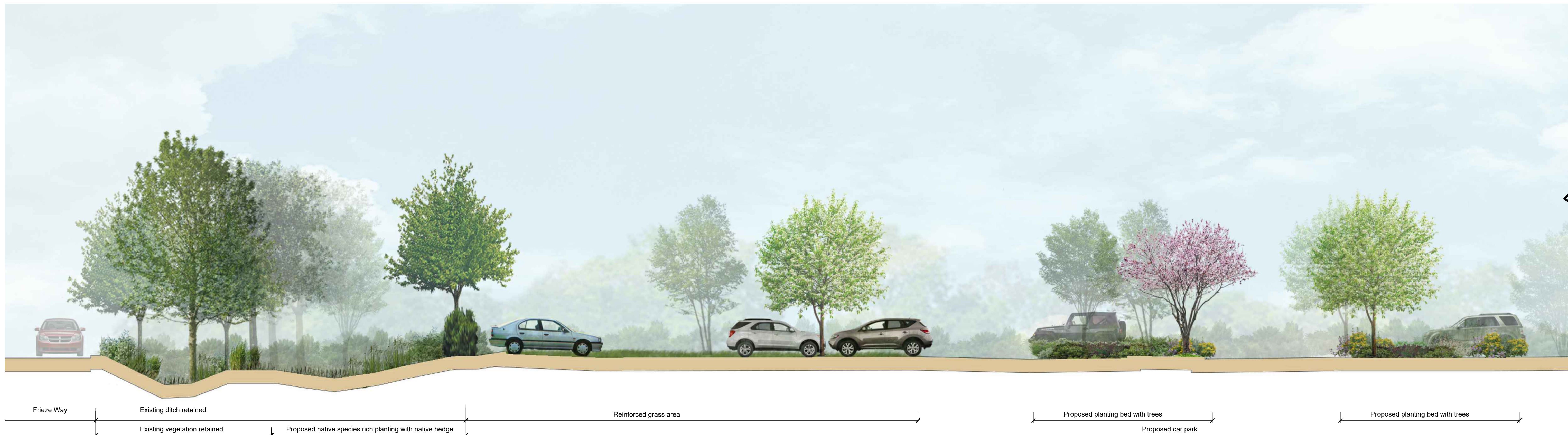
8003 Section E-EE Scale: 1:100