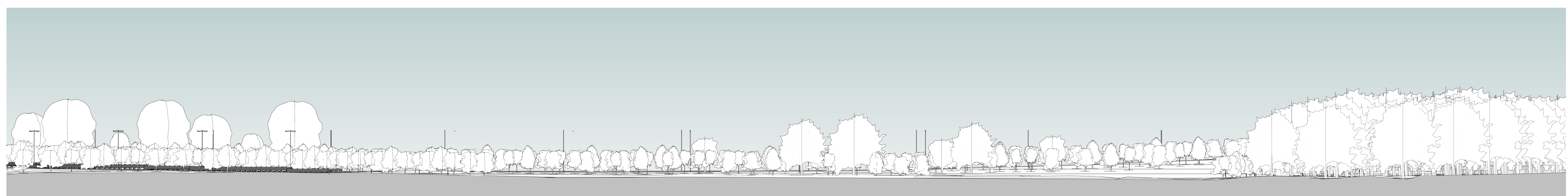
2 Site Section West 1 : 500