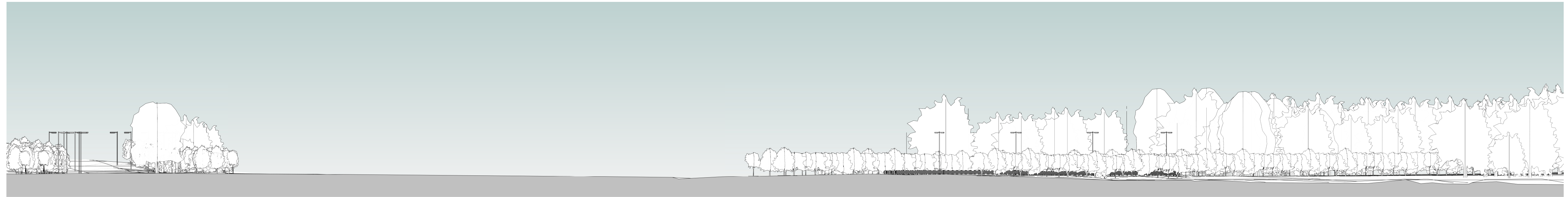
1 Site Section North 1 : 500