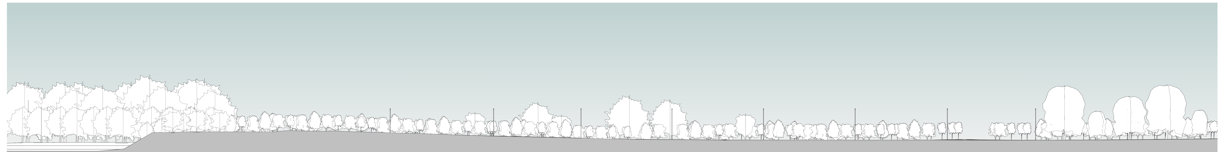
3 Site Section East 1 : 500

NOTES All dimensions and levels to be checked on site Any discrepancies are to be reported to the Architect before any work commences This drawing shall not be scaled to ascertain any dimensions, work to figured dimensions only This drawing shall not be reproduced without express written permission from AFL Architects Ltd. DISCLAIMER When this drawing is issued in CAD, it is an uncontrolled version issued for information only, to enable the recipient to prepare their own documents/drawings for which they are solely responsible. SOFTWARE INTEROPERABILITY AFL prepared this drawing using Autodesk REVIT Architecture. AFL does not accept liability for any loss or degradation of any information held in the drawing resulting from the translation from the original file format to any other file format or from the recipient's reading of it in any other programme.