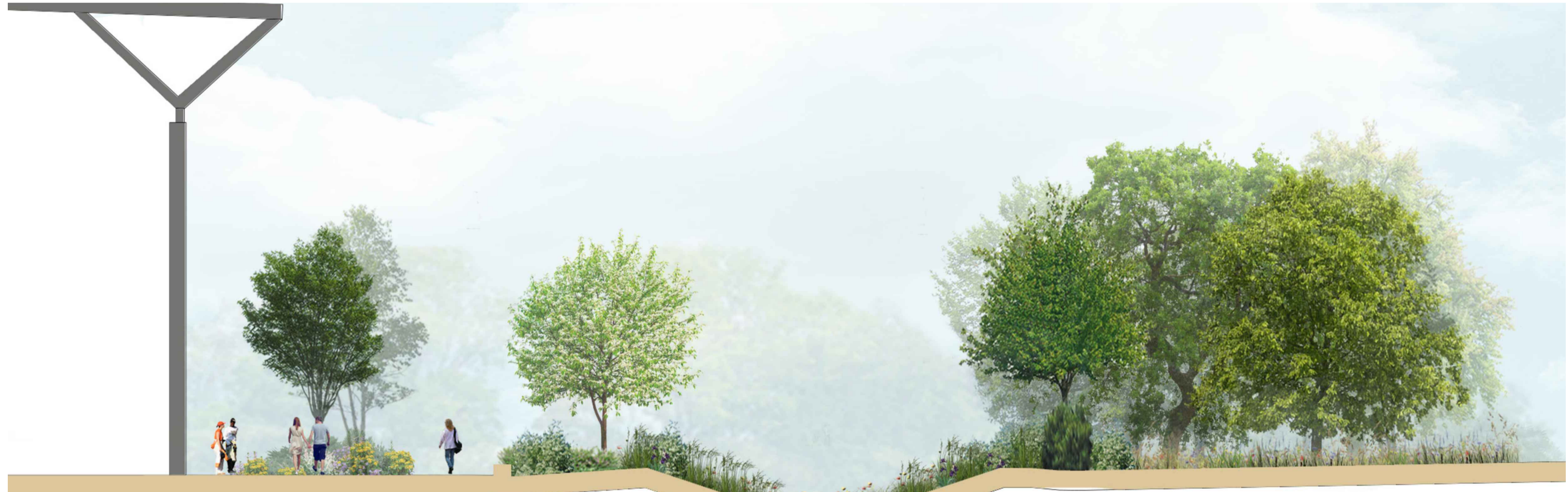
8005 Section J-J 1 Scale: 1:100

South Gate arrival space Proposed shrub planting Buffer to Stratfield Brake Proposed attenuation basin Existing vegetation retained Stratfield Brake