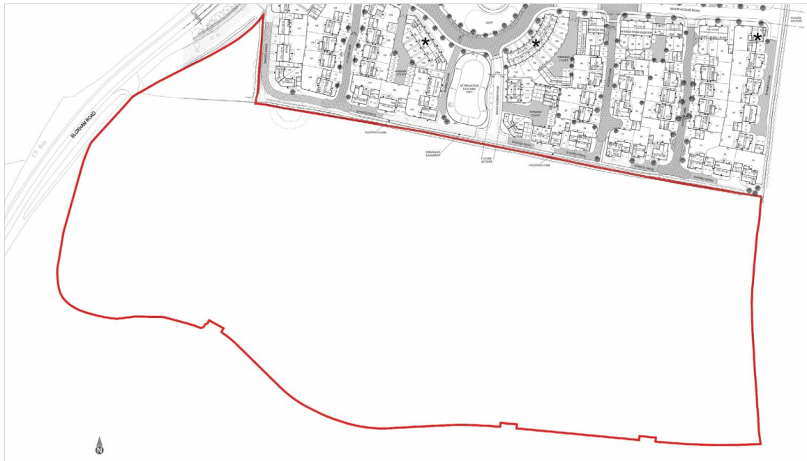
Figure 1. Location Plan of the site and immediate context.

2.3 To the immediate north of the Site lies the residential area of Easington, which provides a residential context and includes Banbury Academy and Blessed George Napier Catholic Schools, separated by an attractive tree lined footpath and cycle way known as Salt Way. Bloxham Road (A361) forms the western edge of the site, and is a heavily tree lined road. Adjacent to the site along Bloxham Road are Crouch Cottages and Wykham Park Lodge.