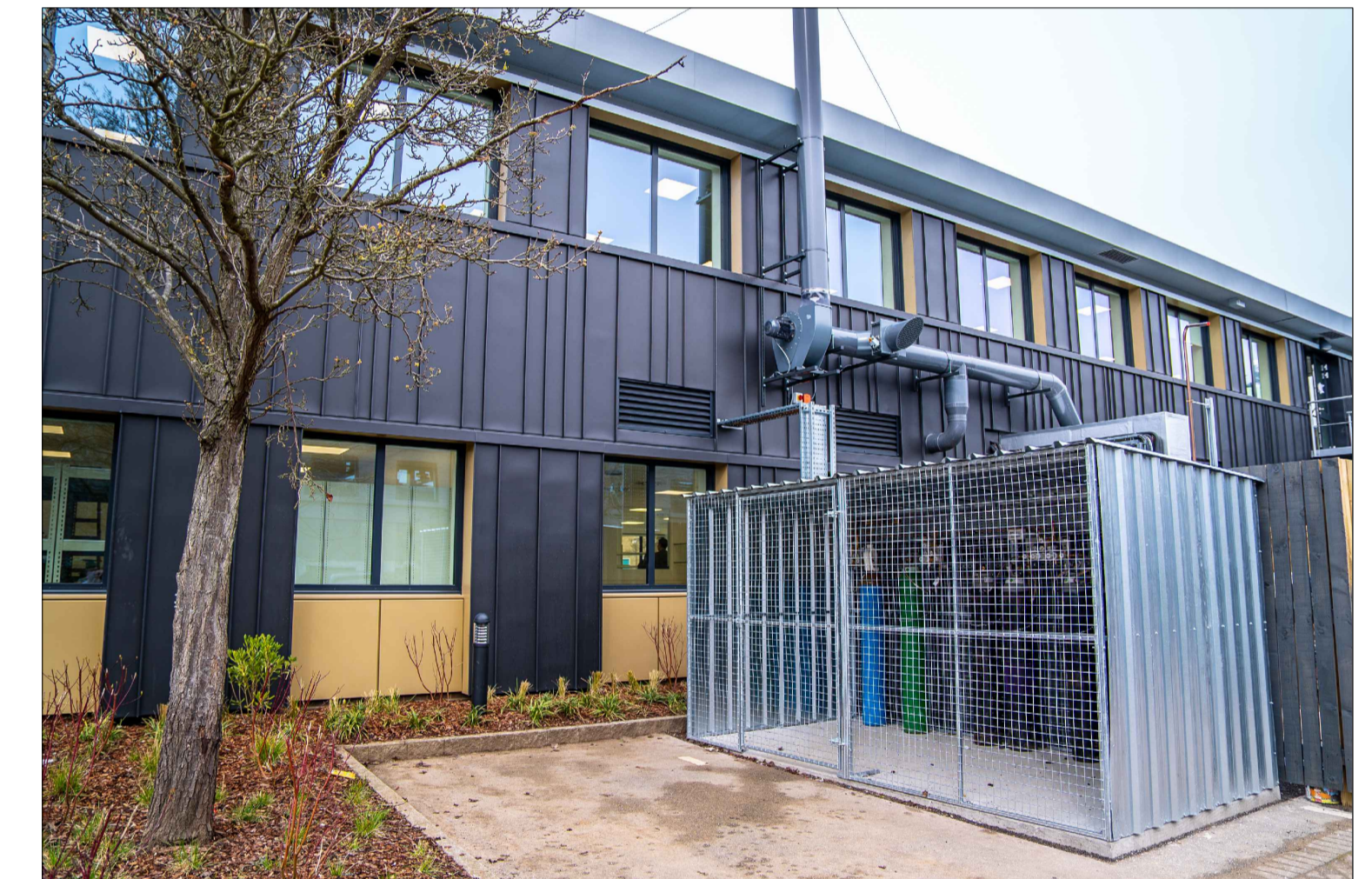
EXAMPLE OF GAS CAGE

Design is protected under Copyright at no time must any portion of this drawing be reproduced or copied in any way without the permission of Bulb Interiors Ltd.