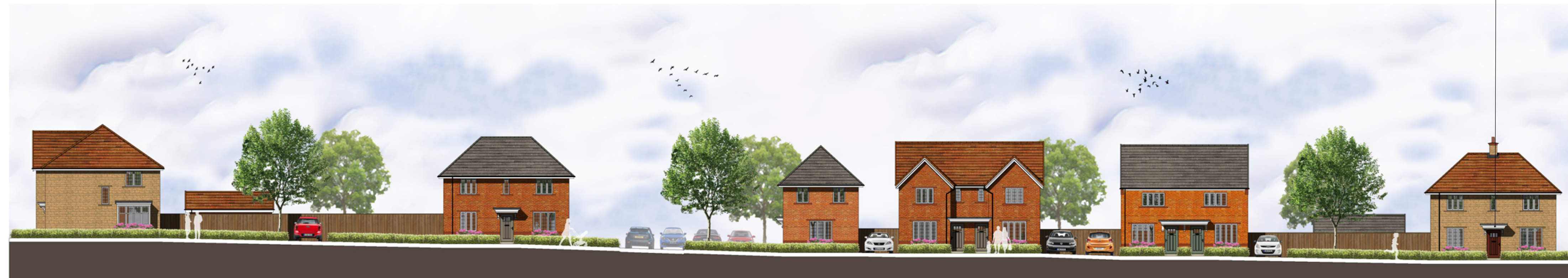
Indicative Street Scene plots 694 - 703