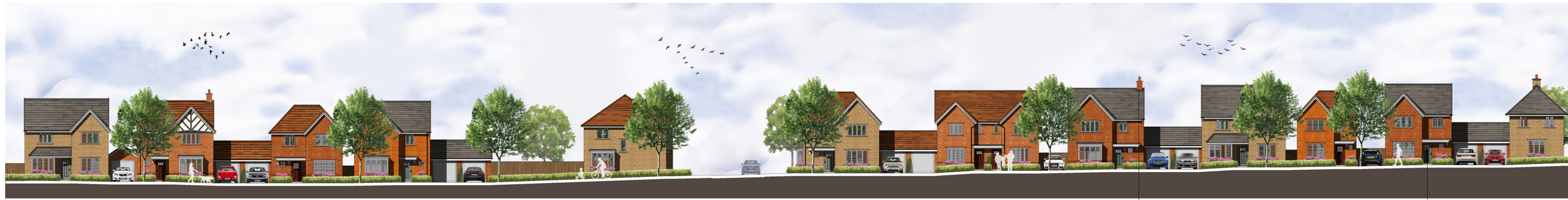
Indicative Street Scene plots 481 - 556

Leaded side hung windows with arts and crafts terracotta heads and cills