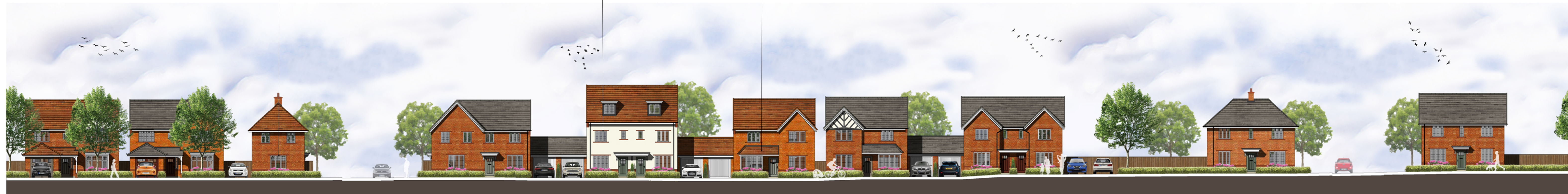
Indicative Street Scene plots 555 - 611

Flat portico with wood grain and rolled lead effect top Contrasting two course string