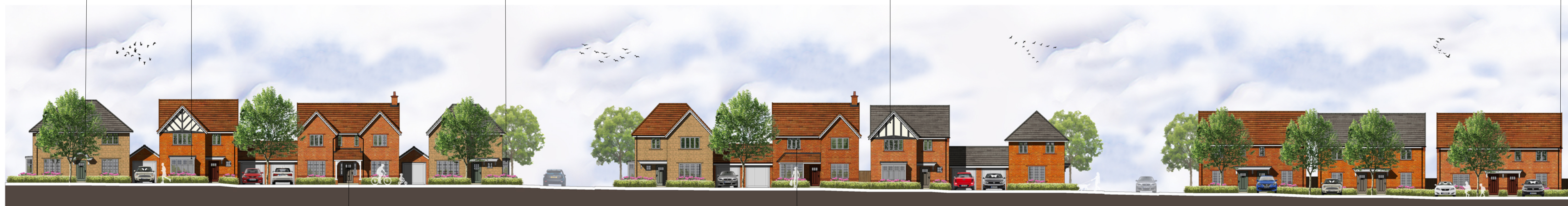
Indicative Street Scene plots 601 - 645