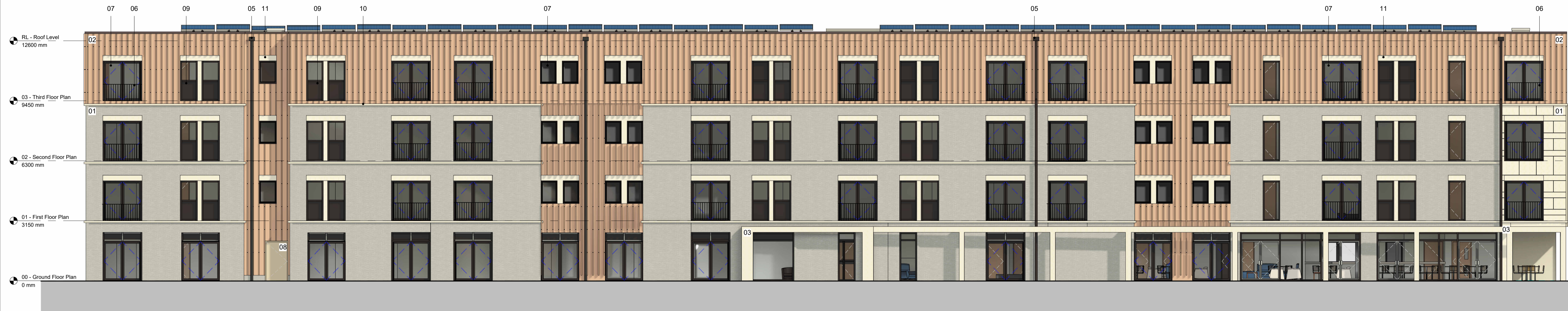
1 South Elevation 1 : 100