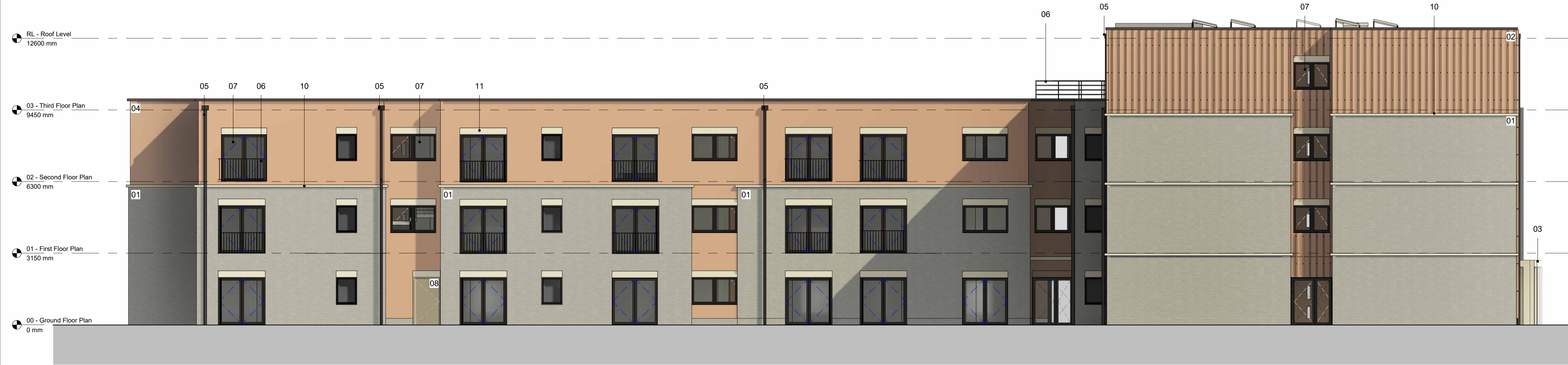
2 West Elevation 1 : 100