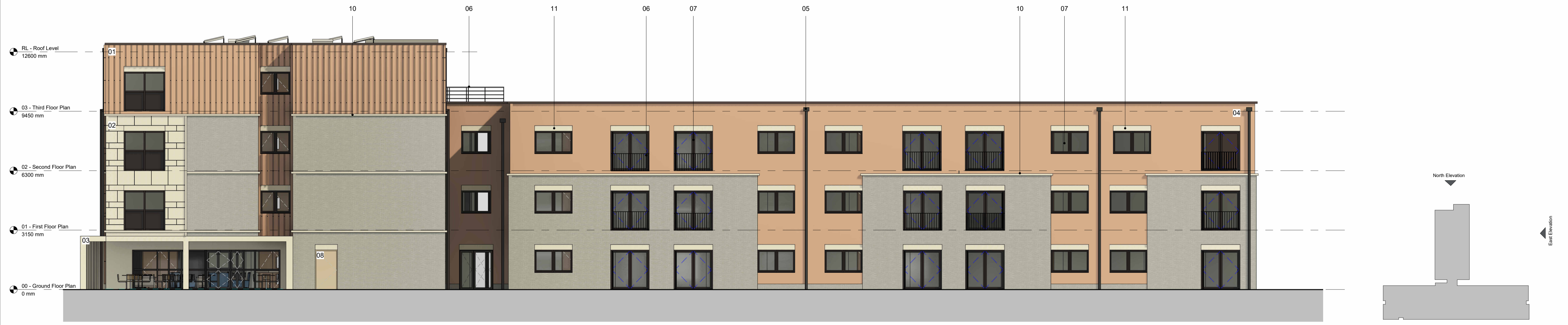
2 East Elevation 1 : 100