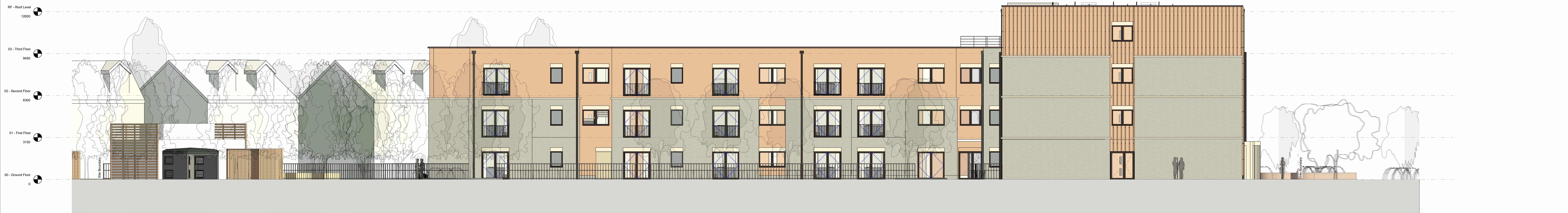
② West Elevation 1:100