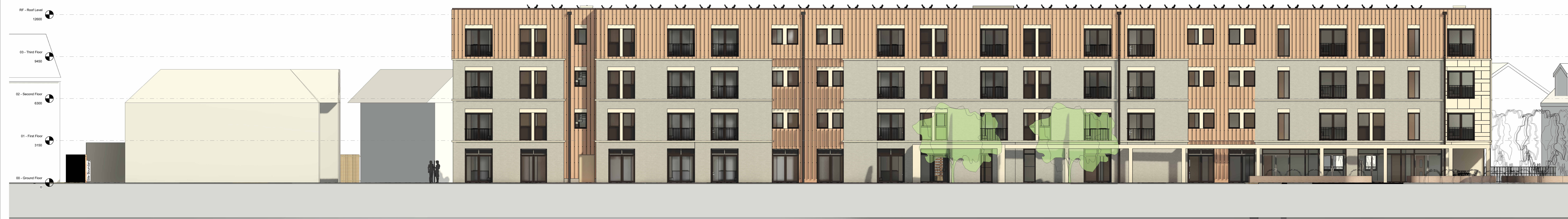
① South Elevation 1:100