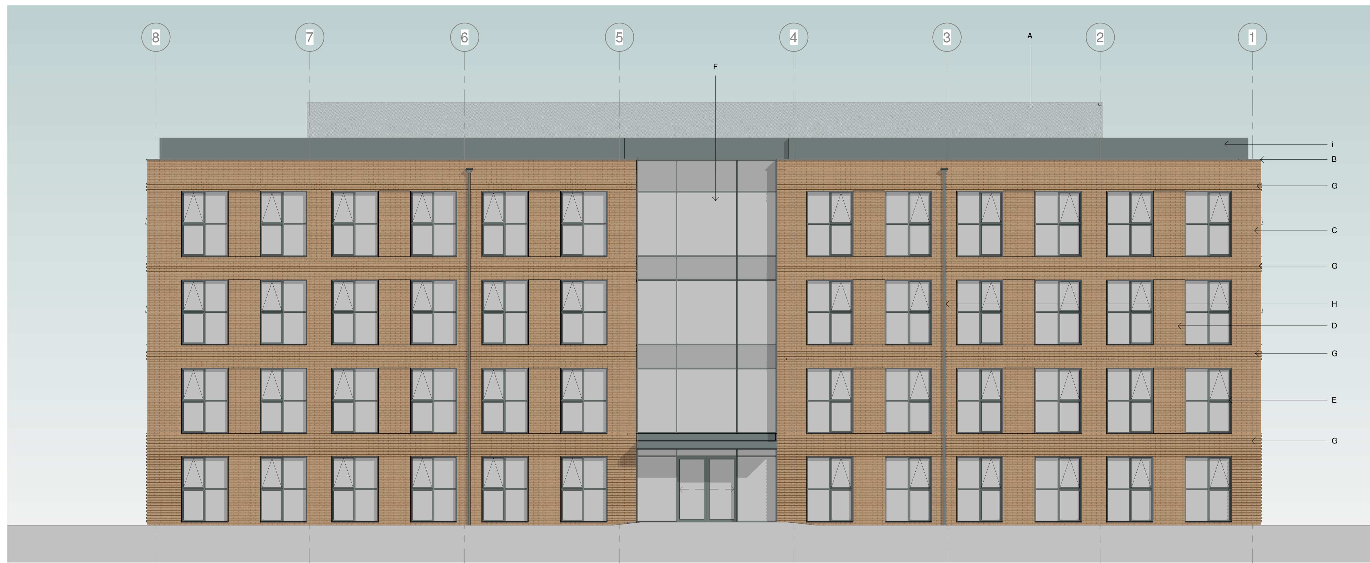
West (Entrance) Elevation