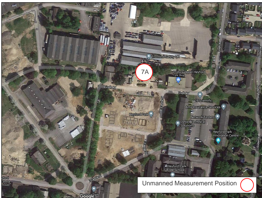
Plan Showing Unmanned Measurement Position.

The position is shown on the plan below.