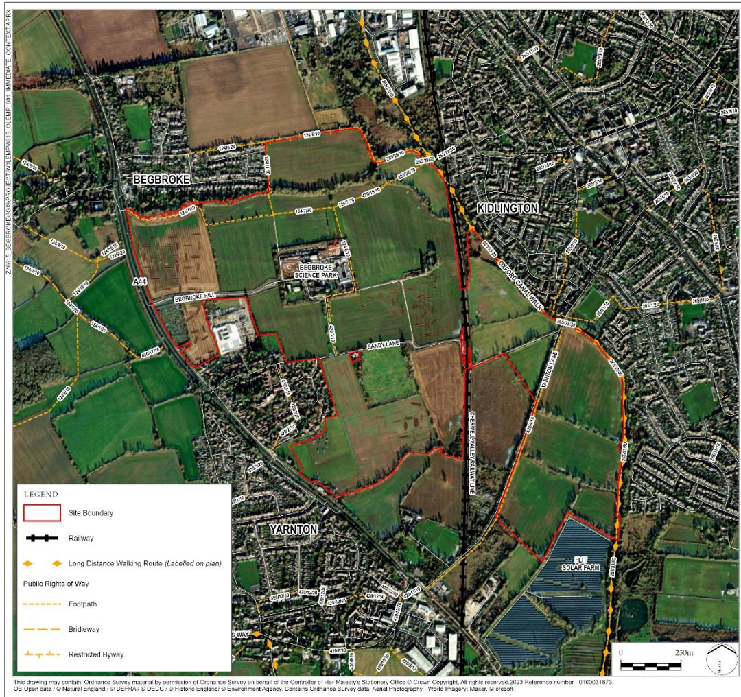
Figure 1: Site Location and its Immediate Context