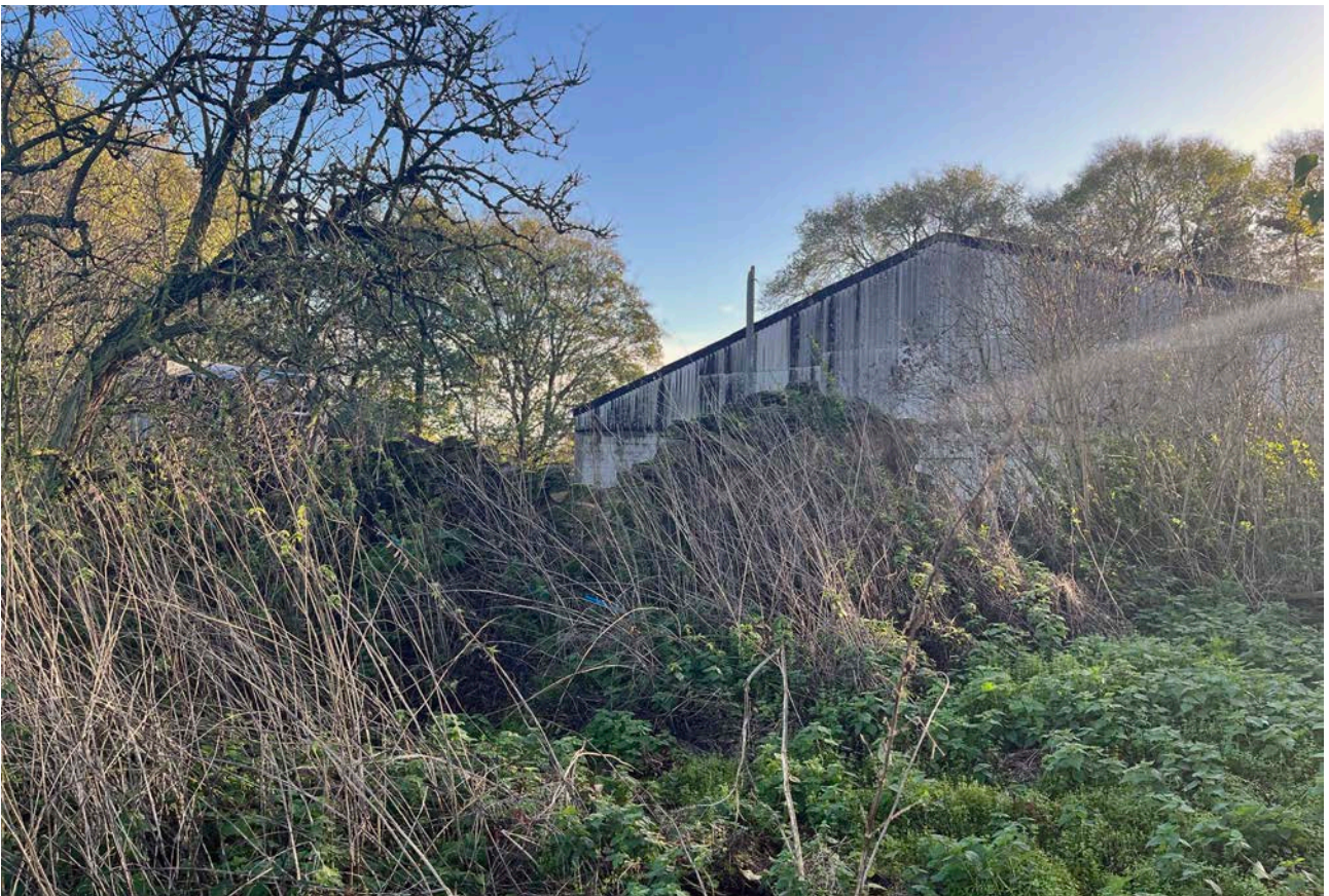
Plate 8: View south. Ruined wall behind agricultural buildings