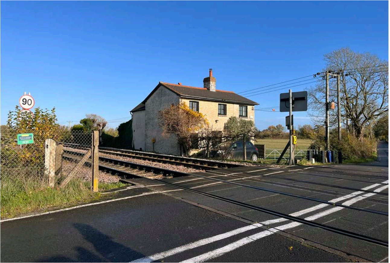
Plate 15: View east. Level crossing and dwelling