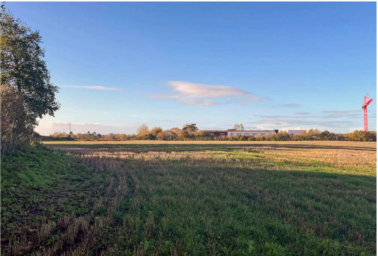
Plate 10: View west. Northern part of site towards Begbroke Science Park