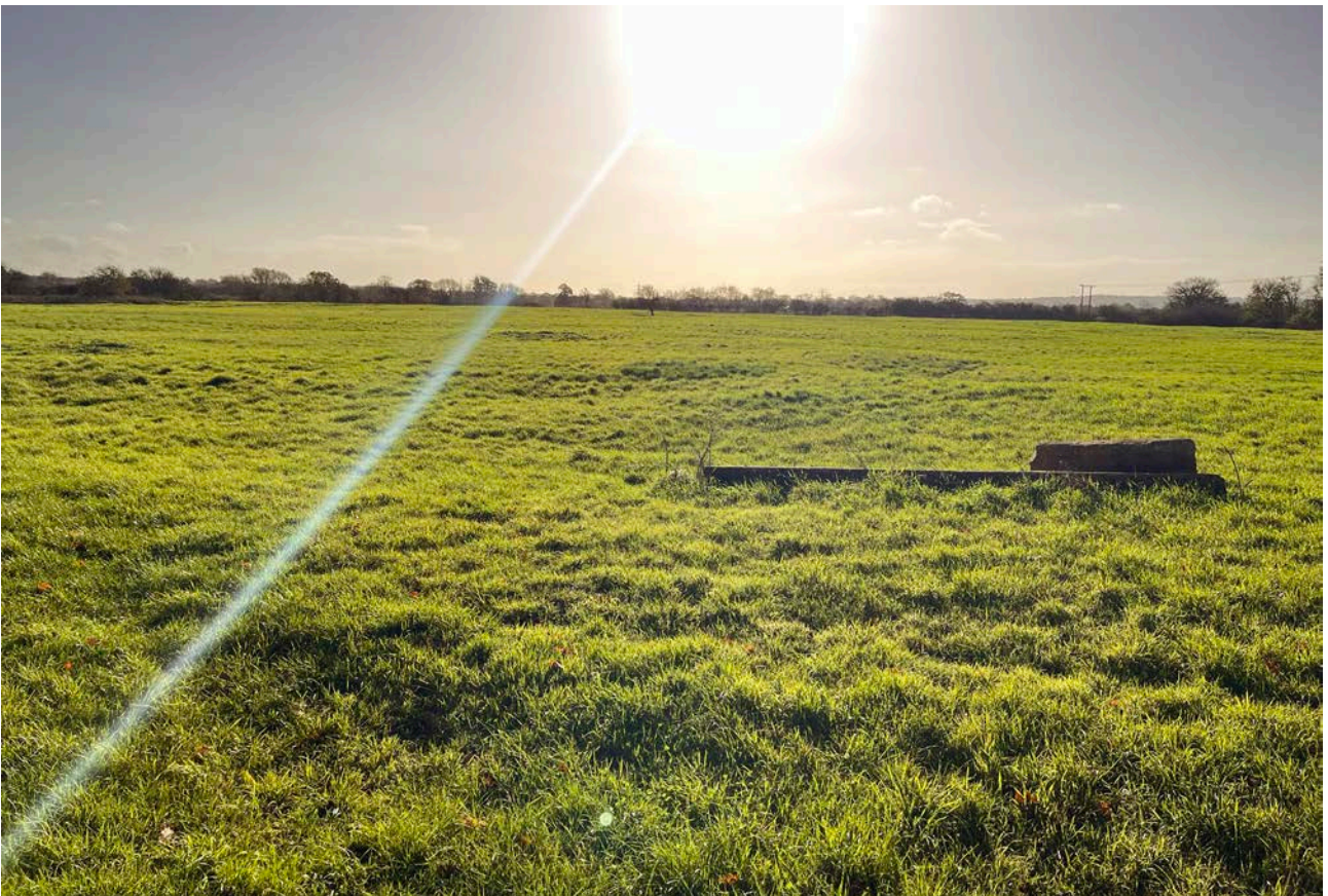
Plate 14: View south. Previous quarry and landfill site off Sandy Lane