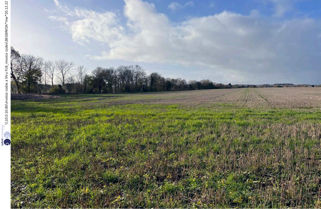
Plate 19: View east. Land north of Rowell Brook