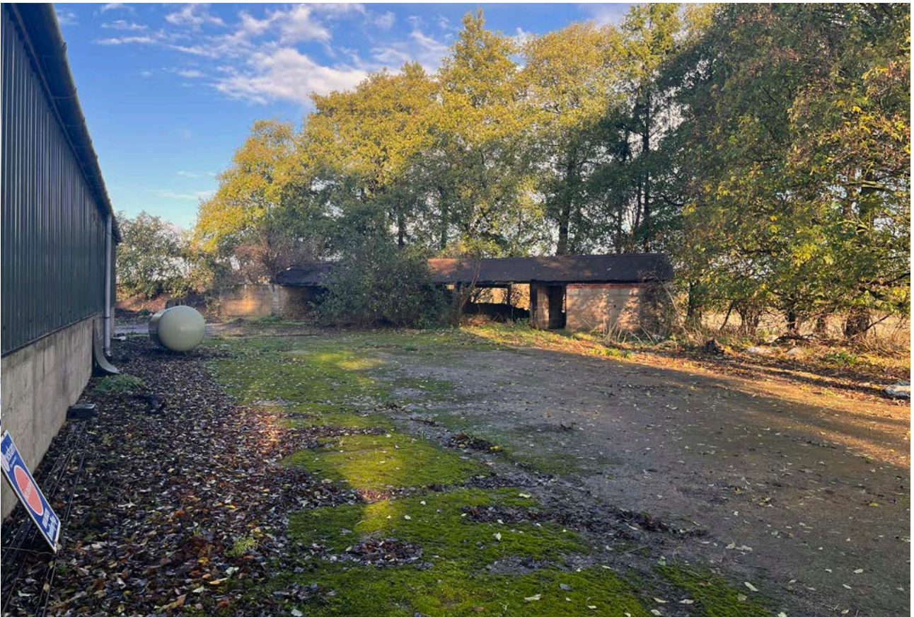
Plate 7: View north. Outhouse/shed in area of Parker's Farm