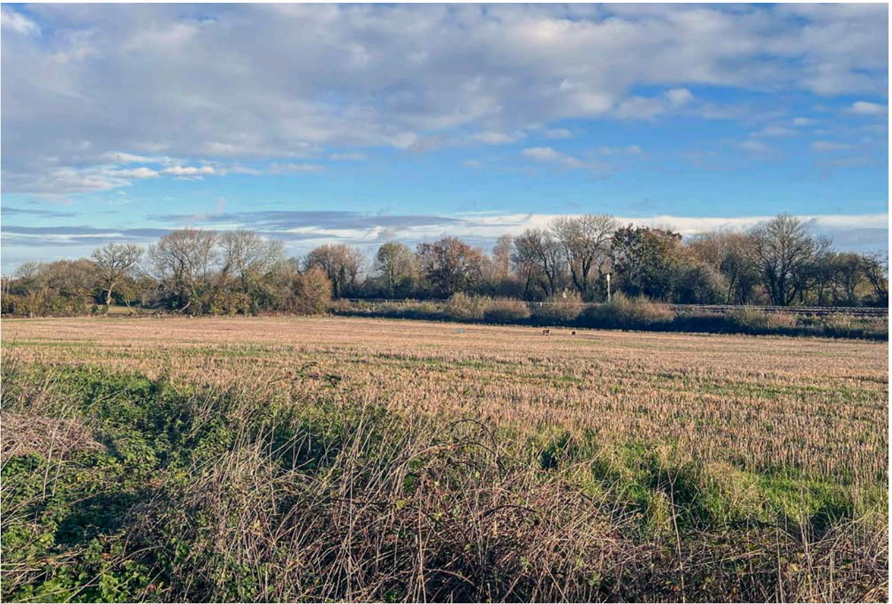
Plate 9: View east. Eastern part of site beyond Parker's Farm, railway line in background