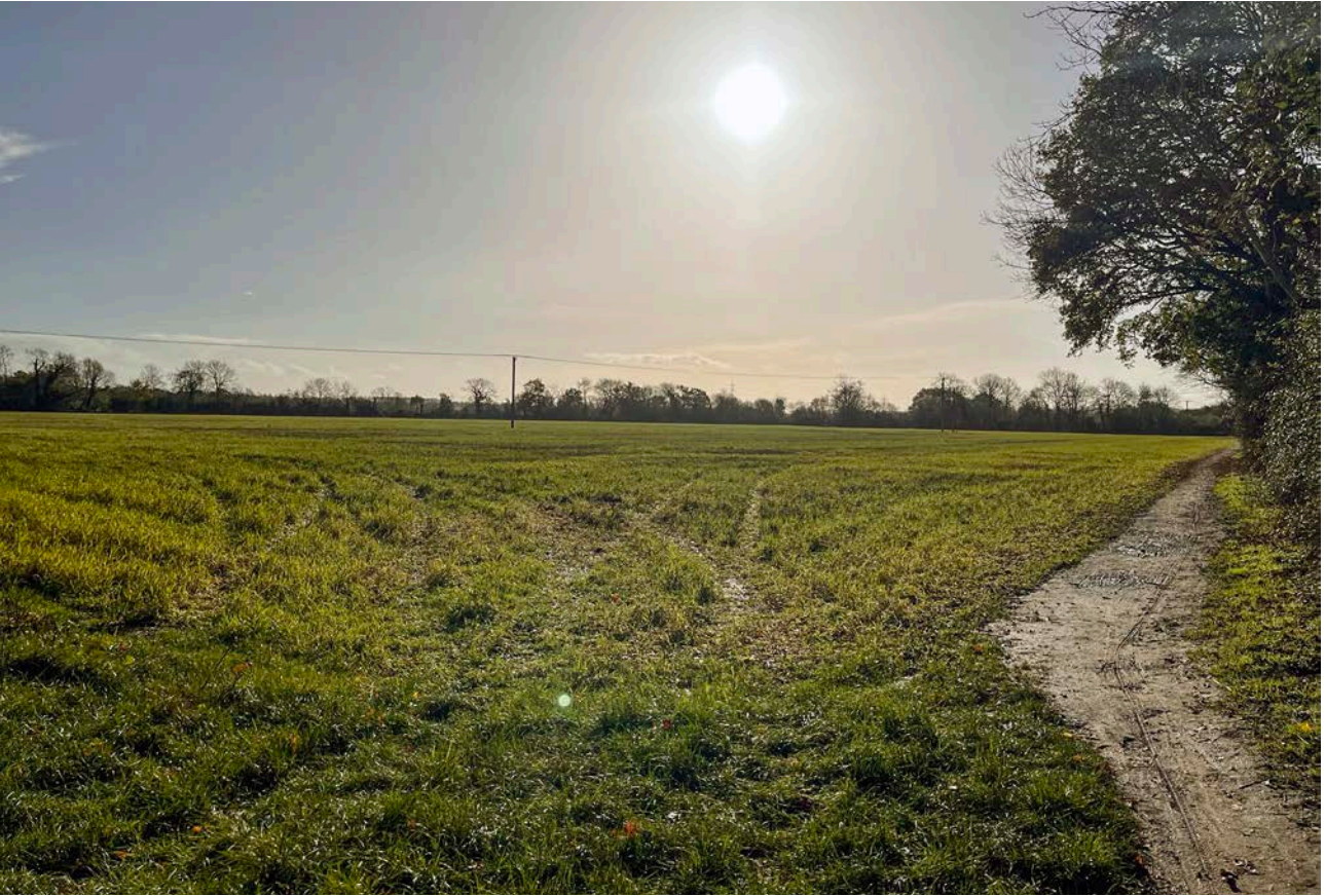
Plate 17: View south. South-eastern part of site