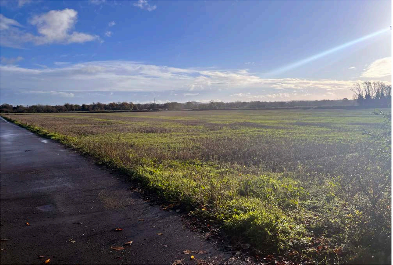
Plate 5: View south-east. Fields and roadway east of science park