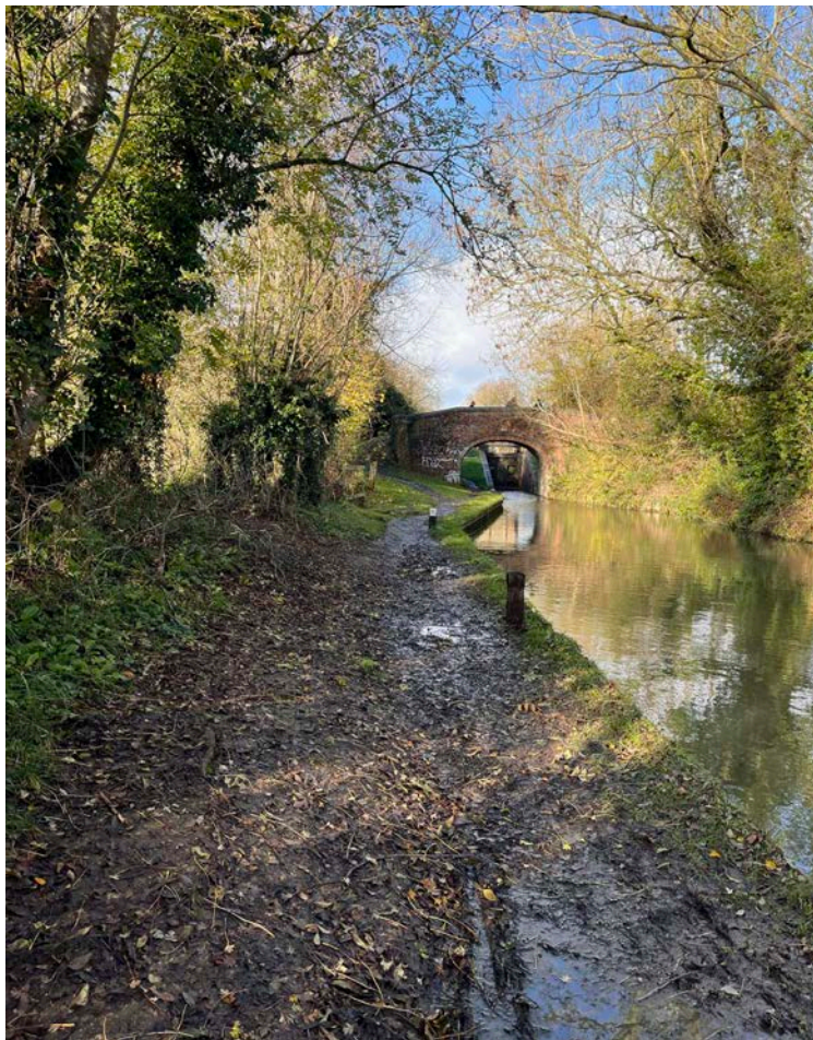
Plate 18: View north. Along the Oxford Canal, site border to left. Bridge 228 and Roundham Lock in background