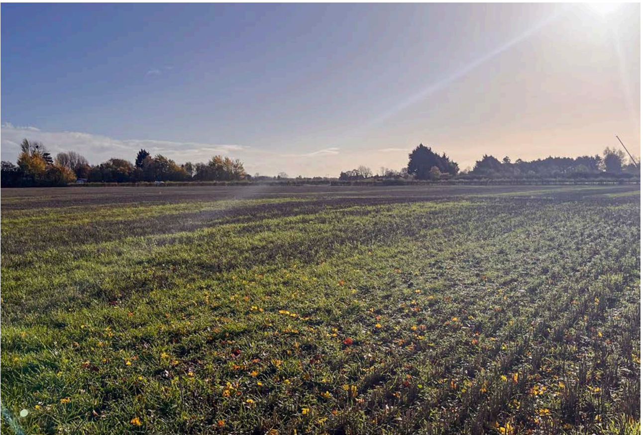
Plate 12: View south-east. From western border of site, Begbroke Hill Road in background