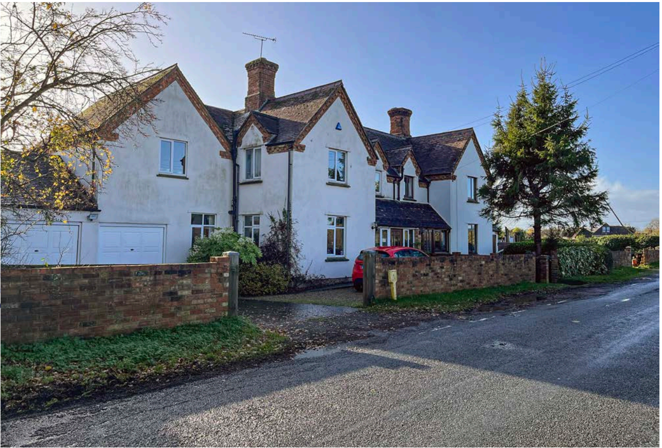
Plate 13: View south-west. From Sandy Lane, house dated 1883