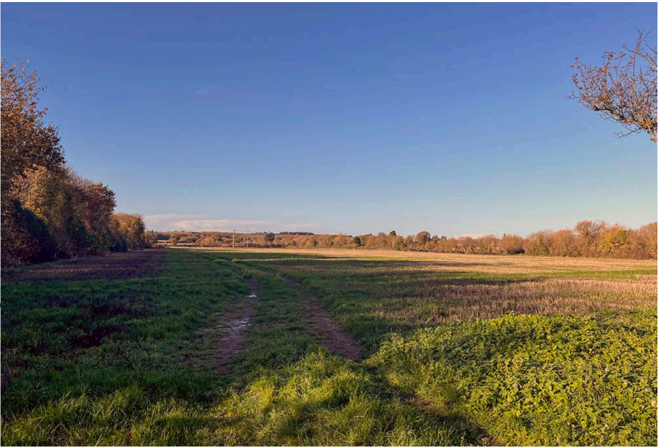
Plate 11: View west. Northern part of site