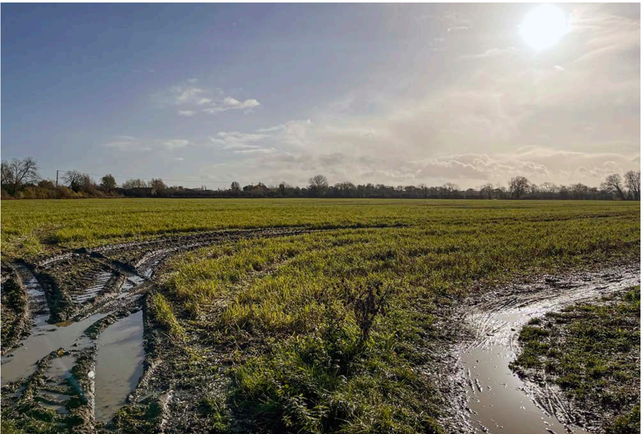
Plate 16: View south-east. South-eastern part of site, canal in background