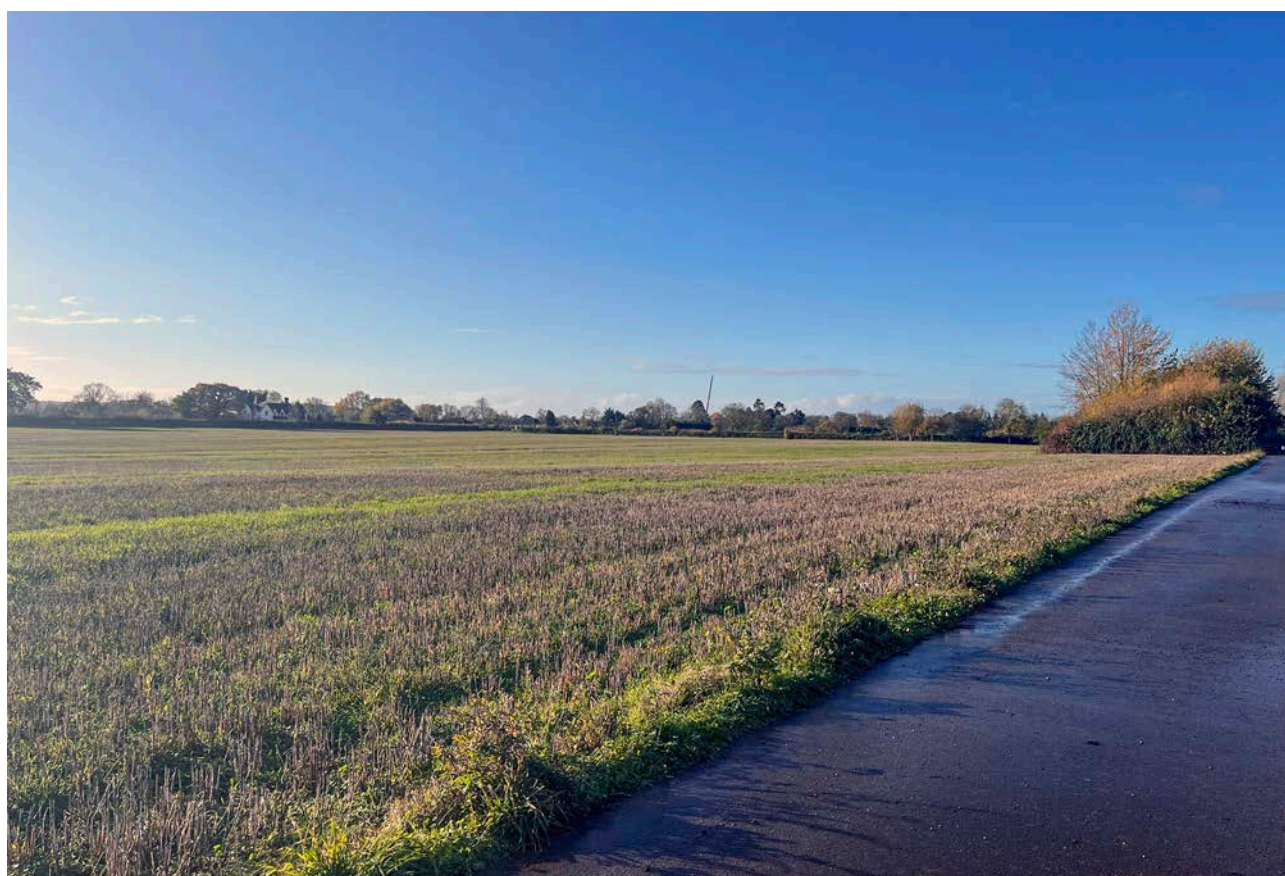
Plate 4: View north-east. Fields and roadway east of science park