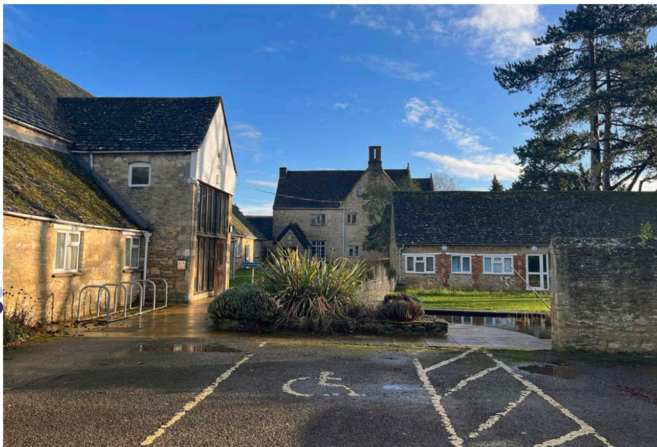
Plate 1: View east. Bebroke Hill Farmhouse within science park complex