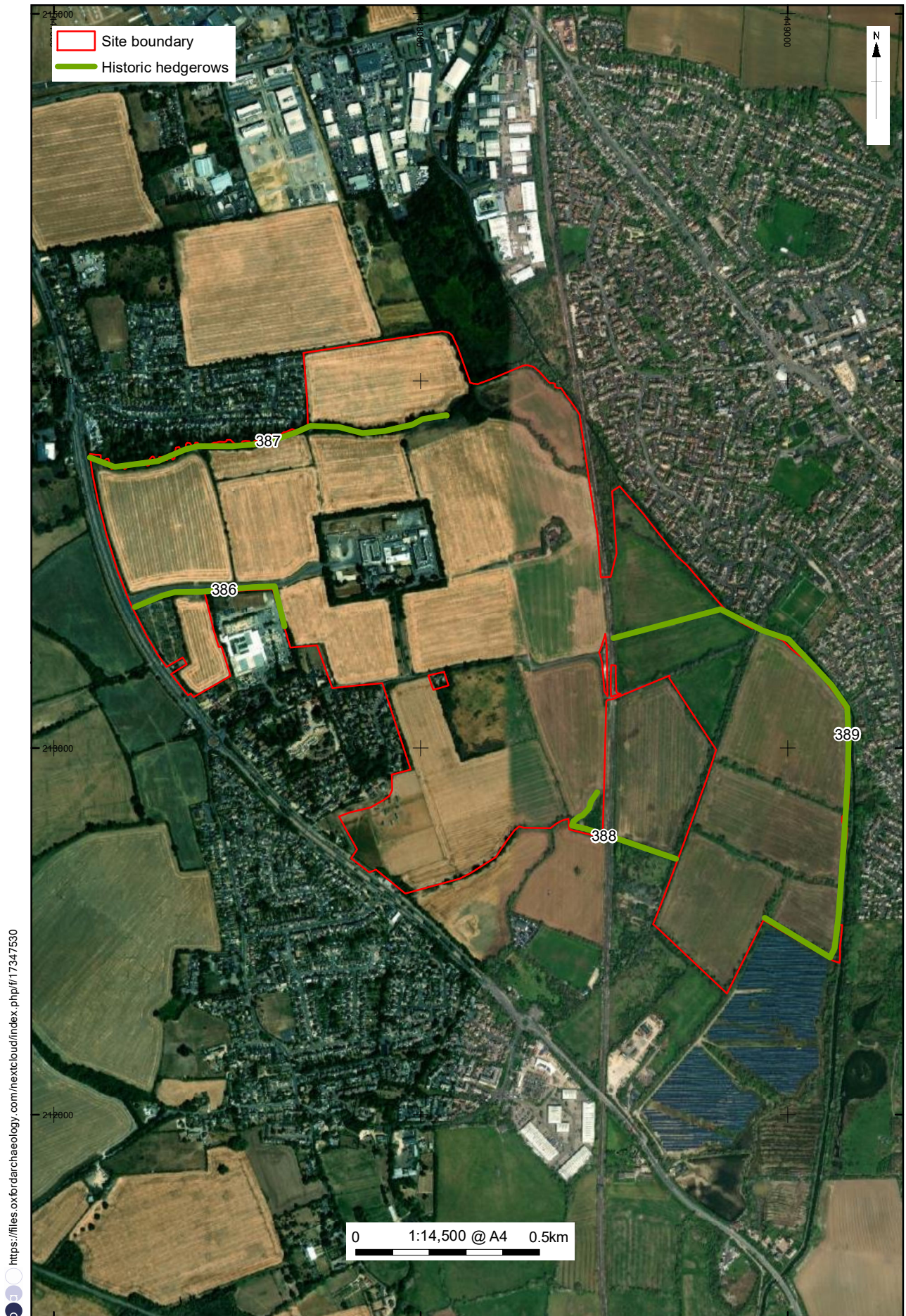
Figure 26: Historic hedgerows in environs of site