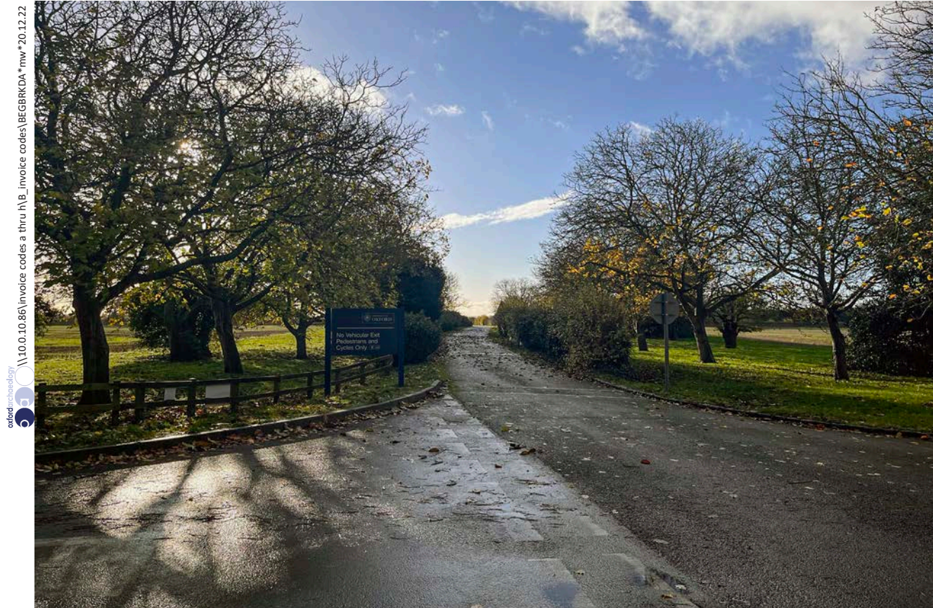
Plate 3: View south. Southern approach to Begbroke Hill Farmhouse