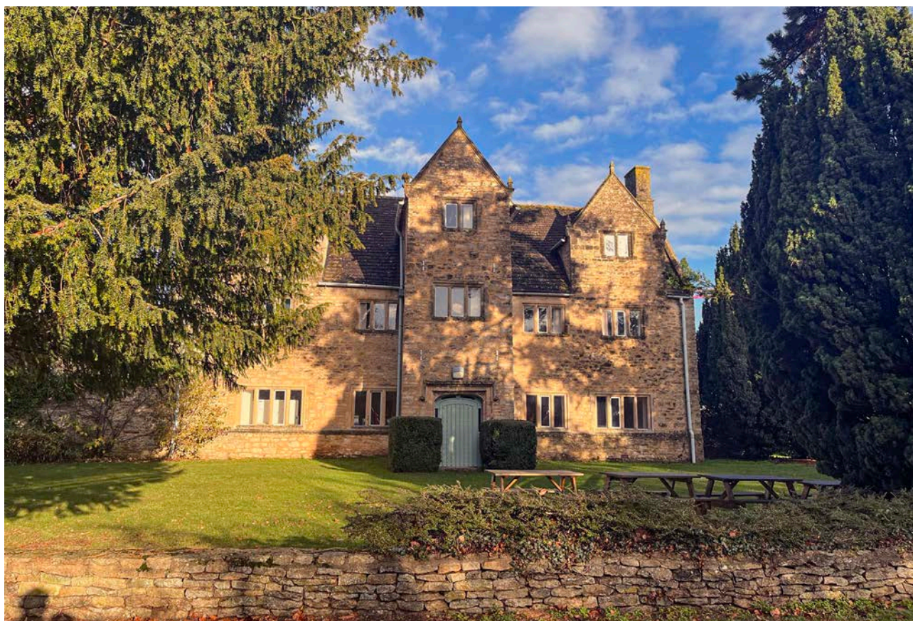
Plate 2: South-facing elevation of Bebroke Hill Farmhouse