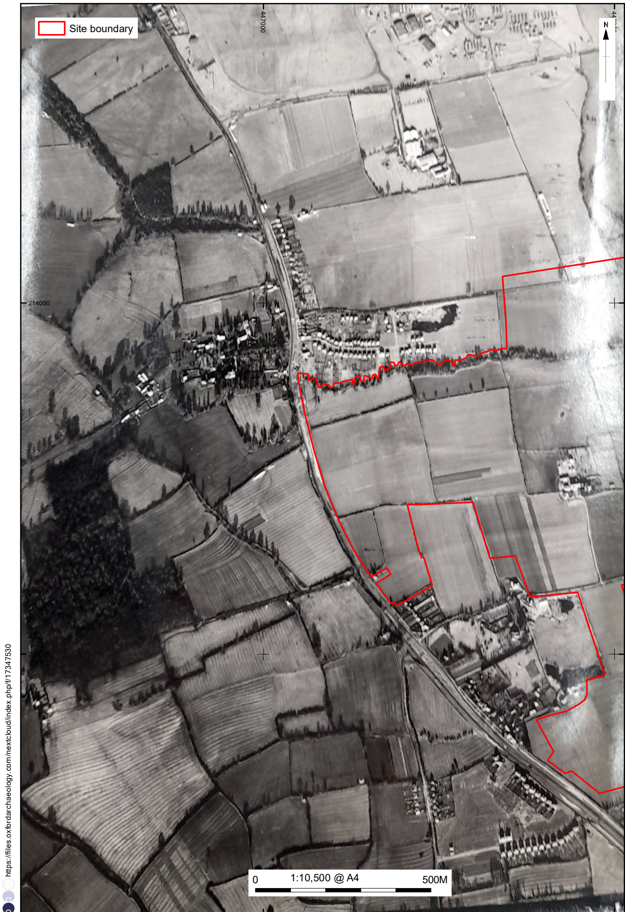
Figure 17: 1947, Aerial photograph showing part of site and ridge and furrow to west