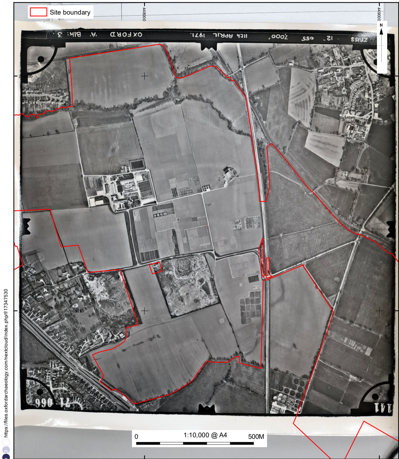
Figure 19: 1971, Aerial photograph showing part of site (Historic England OS/71066)