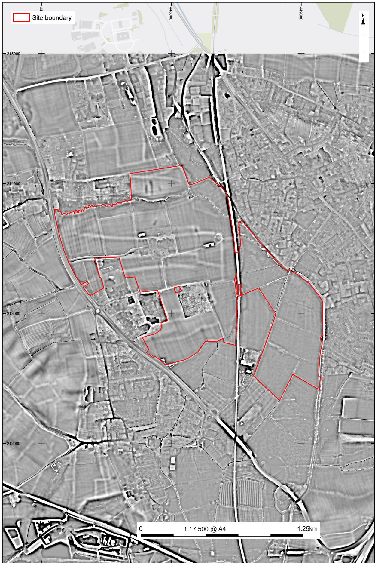
Figure 22: SLRM LiDAR visualisation