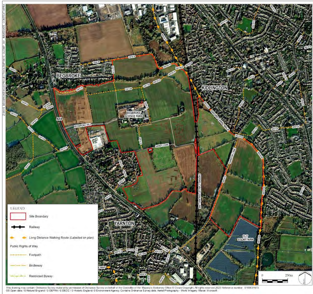
Figure 1: Site Location and its Immediate Context

15. The Site's extent is shown on Figure 1: Site Location and its Immediate Context below: