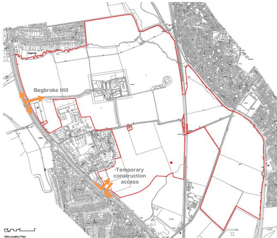
Figure 4.1: Proposed Construction Access Strategy