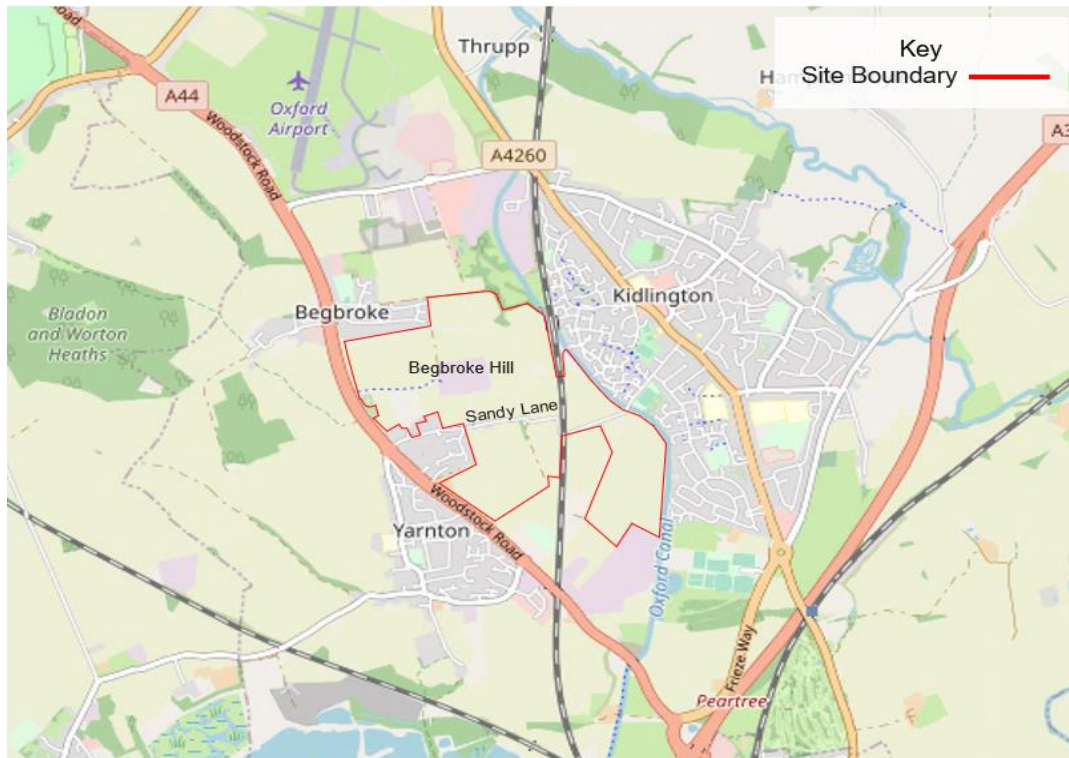
Figure 1-1: Site Location